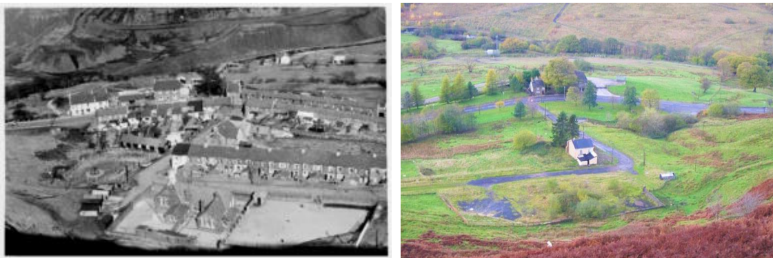
Figure 1: Troedrhiwfuwch before and after evacuation and demolition

One of the few remaining landmarks is the War Memorial, which commemorates the exceptional sacrifice of young lives during the First World War especially, when over one hundred young men went to war, more than one per household, and of these more than twenty never returned. For many, the War Memorial is the only physical reminder, as their relatives' bodies were never recovered. This has become one of the major foci of local interest, with community members developing extensive expertise digging into war records, census returns, and other sources.