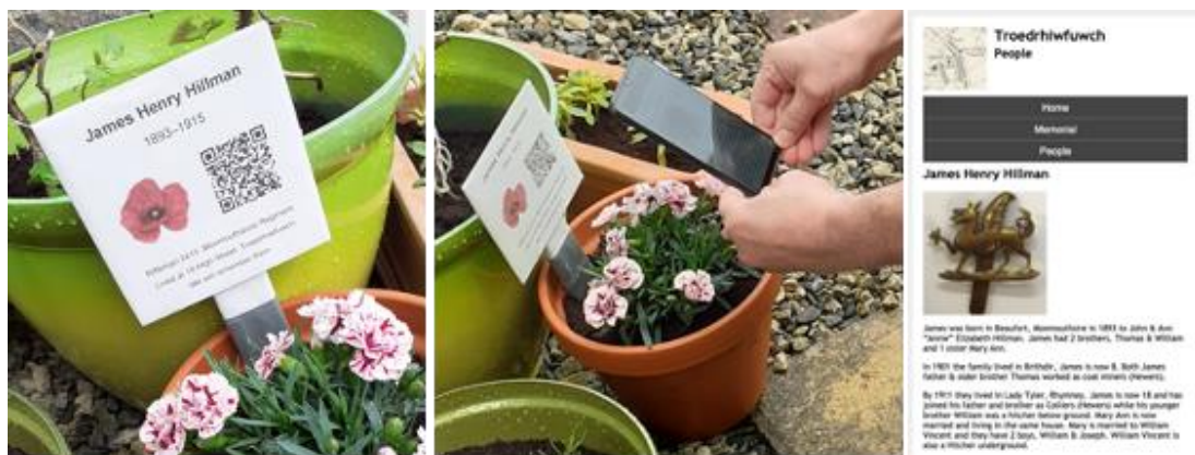
Figure 2: Early working prototype for open day

Based on the outcomes of these stages three aspects moved to a second level of development. TalkOver is an application designed to help people talk about digital photographs recording both what they say and also what they point at in the photo [4]. Also, a group of PhD students have 3D scanned many of the items transferred from Troedrhilwfwch church to Pontlottyn church and created a VR gallery. The third, was the QR-code based signage, which is the focus of this paper.