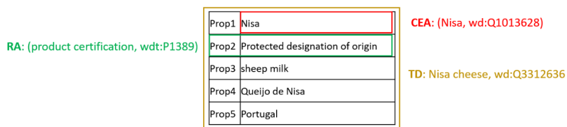
(b) Entity Table.