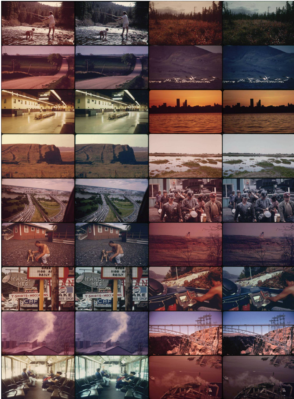
Figure 3: Set of selected photographs from the Documerica collection, with the digitized damaged prints available online to the left of the automatically corrected images using our method. Images are scaled to have the same aspect ratio to make them easier to display.