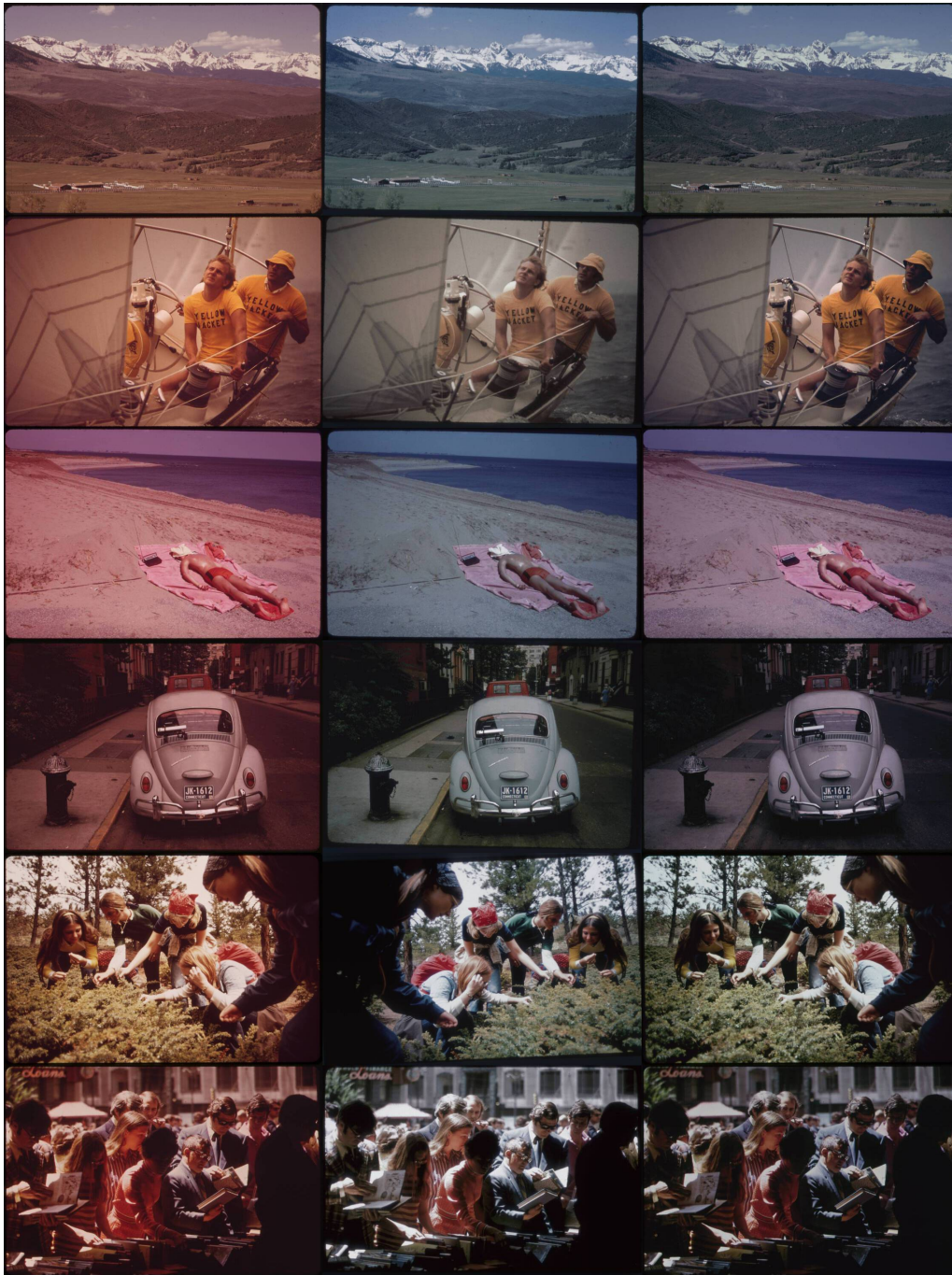
Figure 1: Set of selected photographs from the DocuAmerica collection. The first column contains digitized damaged prints available online; the second column shows manually scanned from the undamaged prints available at the U.S. National Archives; the final column shows the automatically corrected images using our method.