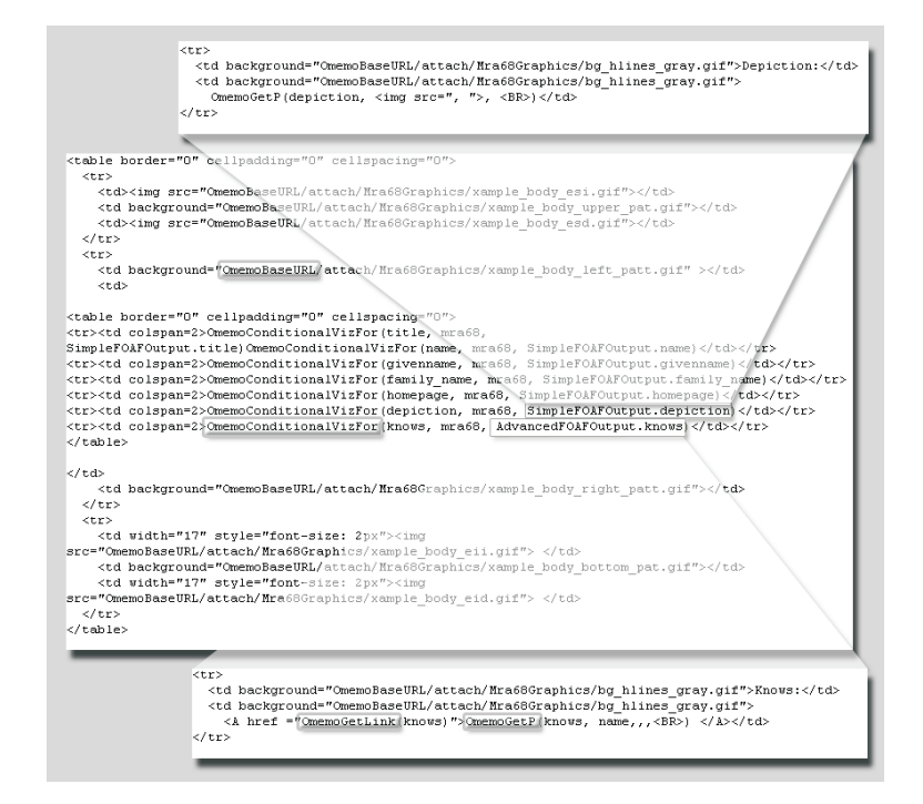
Fig. 1. Template example showing macros (thick rectangles) and templates reuse (thin rectangles).

within a thin stroke. It must be noticed that, unlike other templates systems, the code is essentially client-side code, substituting programming issues by simple macros, easier to understand by web designers. These macros allow a variable number of arguments and can be evaluated in design time, warning web designers when some of the arguments is wrong.