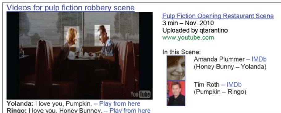
Fig. 4. Sketch of an extended Rich Snippet featuring semantically highlighted video preview (still frame or moving images), actor information, and in-video links.