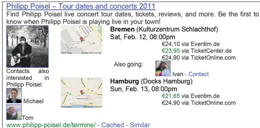
Fig. 3. Sketch of an extended Rich Snippet featuring maps previews, image preview, event and price information, including cheapest offer highlighted. In addition to that, the user's social graph is processed in order to find people interested in the same artist and to display who else plans to attend a particular event.