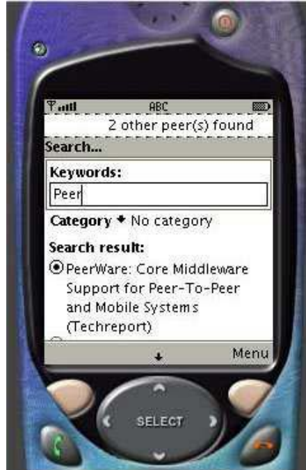
Fig. 3. Screenshot of Omnix running on a J2ME mobile phone emulator.

Omnix has been developed to use only the reduced set of standard packages provided by the MID Profile. Some modules, however, might not be used on a mobile phone (e.g. the encryption module that uses security packages provided only by the Java 2 Standard Edition). We have fully integrated a peer running on a mobile phone emulator with peers running on PCs and Linux handhelds.