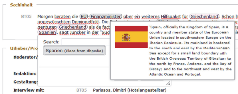
Fig. 2. Annotation and interlinking interface

When browsing search results, editors or journalists are enabled to annotate the content. With the help of a special annotation plugin, the formerly “read-only” search result page becomes editable by injecting the annotation features into the web page. Parts of the page such as the content description are analyzed by Apache Stanbol 5 . As a result, eligible resource annotations are provided to the user as shown in Fig. 2.