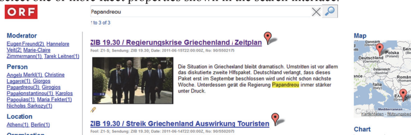
Fig. 3. Search Demonstrator

The search experience can be improved by facilitating the semantic relations of the archived data. By using the semantic concepts of the data which are either production related (e. g. moderator, editor, program etc.) or content related (e.g. persons named or in video, content description, location of the clips content), it is possible to provide a faceted search as shown in Fig. 3, for example to narrow down the search, the user may select one or more facet properties shown in the search interface.