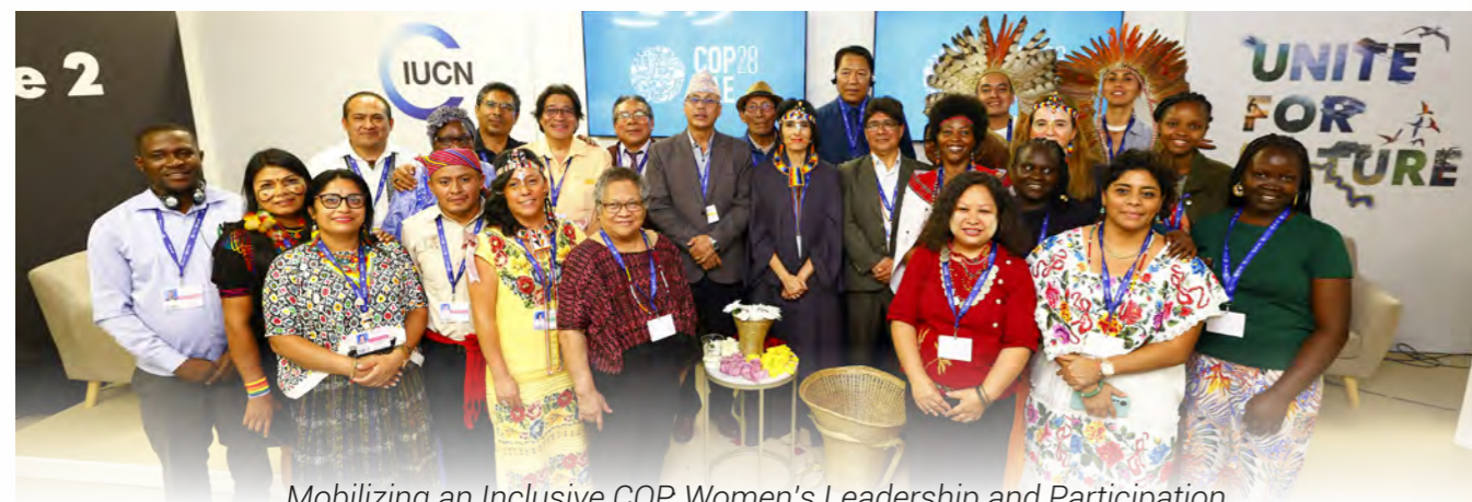
Mobilizing an Inclusive COP. Women's Leadership and Participation

Ensuring meaningful representation and visibility of Indigenous Peoples was a priority throughout the two-week program. COP28 saw the inaugural Indigenous Peoples Day (December 5th) as part of the Action Agenda, featuring events co-curated with Indigenous Peoples Organizations. Over 300 Indigenous Peoples attended the conference, with prominent representation in various segments, including the World Climate Action Summit (WCAS), the Business and Philanthropy Forum, Nature Day, and the Global Climate Action Agenda. Additionally, resources were allocated for the Indigenous Peoples Pavilion in the Blue Zone and a ceremonial space in the Green Zone. The High-Level Champion for COP28 supported the Indigenous Peoples Coordination meeting ahead of COP28 and facilitated the attendance of IP elders through travel and accommodation support.