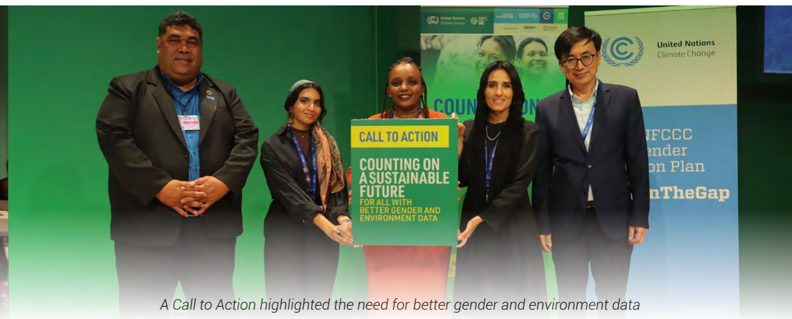
A Call to Action highlighted the need for better gender and environment data