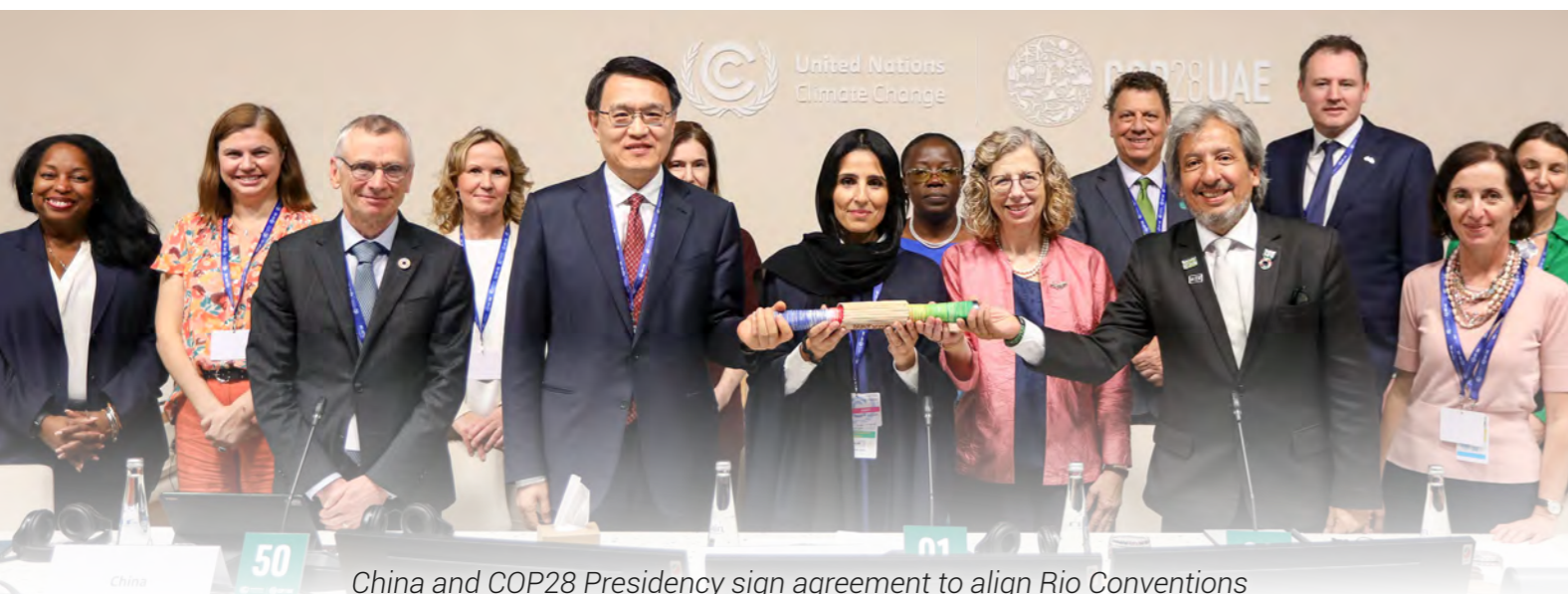
China and COP28 Presidency sign agreement to align Rio Conventions