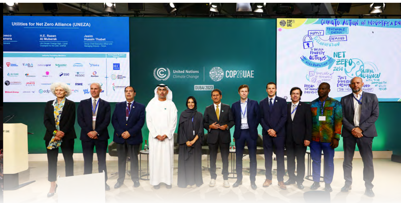
Utilities for Net-Zero Alliance (UNEZA)