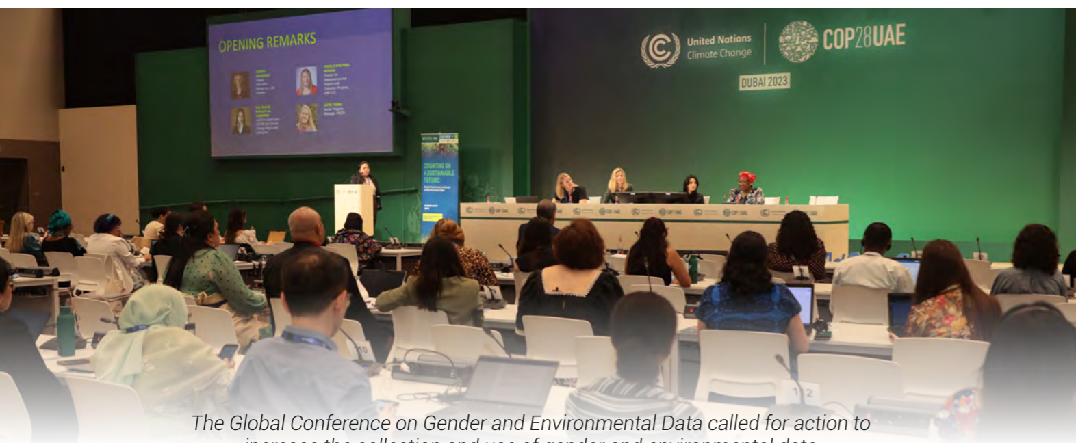
The Global Conference on Gender and Environmental Data called for action to increase the collection and use of gender and environmental data