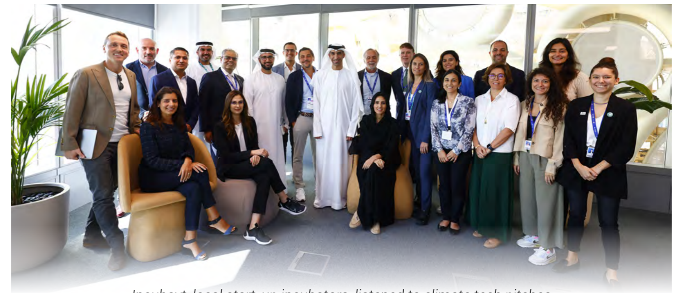
Incubayt, local start-up incubators, listened to climate tech pitches

demonstrating the efficacy of HLC-led Regional Platforms for Climate Projects. The engagement of over 1,000 participants, including 200 financiers in 2023 forums, illustrates the expansive reach and impact of these initiatives. The growth of Global Financial Alliance for Net Zero (GFANZ) in regions like Africa and Latin America/Caribbean, along with the new Capacity-Building Coalition in developing countries, reflects the growing global commitment to regional climate action and financial mobilization.