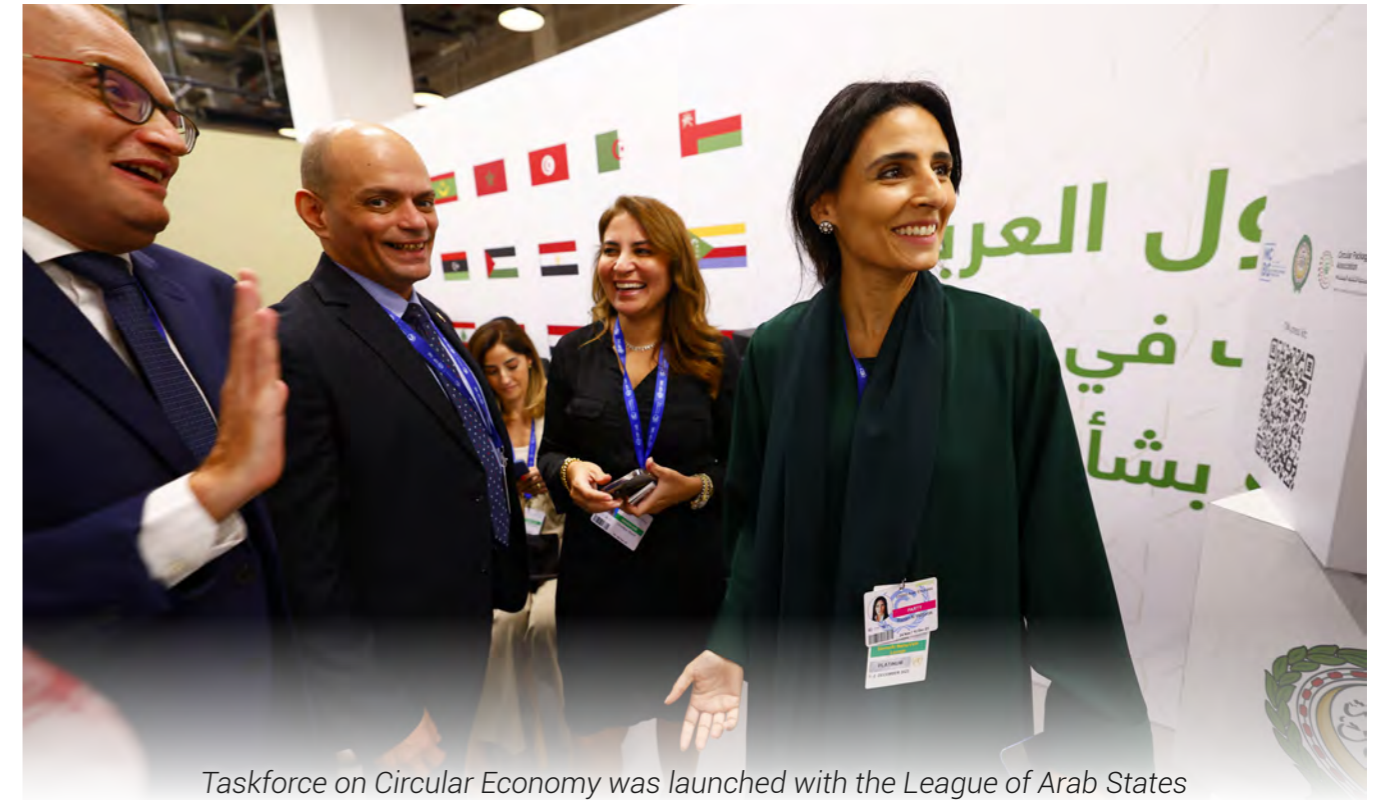
Taskforce on Circular Economy was launched with the League of Arab States

Cities and buildings were at the forefront of climate action, with initiatives like the Coalition for High Ambition Multilevel Partnerships (CHAMP) co-chaired by Bloomberg and COP28, featuring during the Leaders Climate Action Summit (LCAS) which engaged over 70 countries. The UAE Built Environment Sustainability Blueprint , launched by leading UAE real estate developers, and the launch of the Building Breakthrough endorsed by the UAE, were critical in promoting sustainable