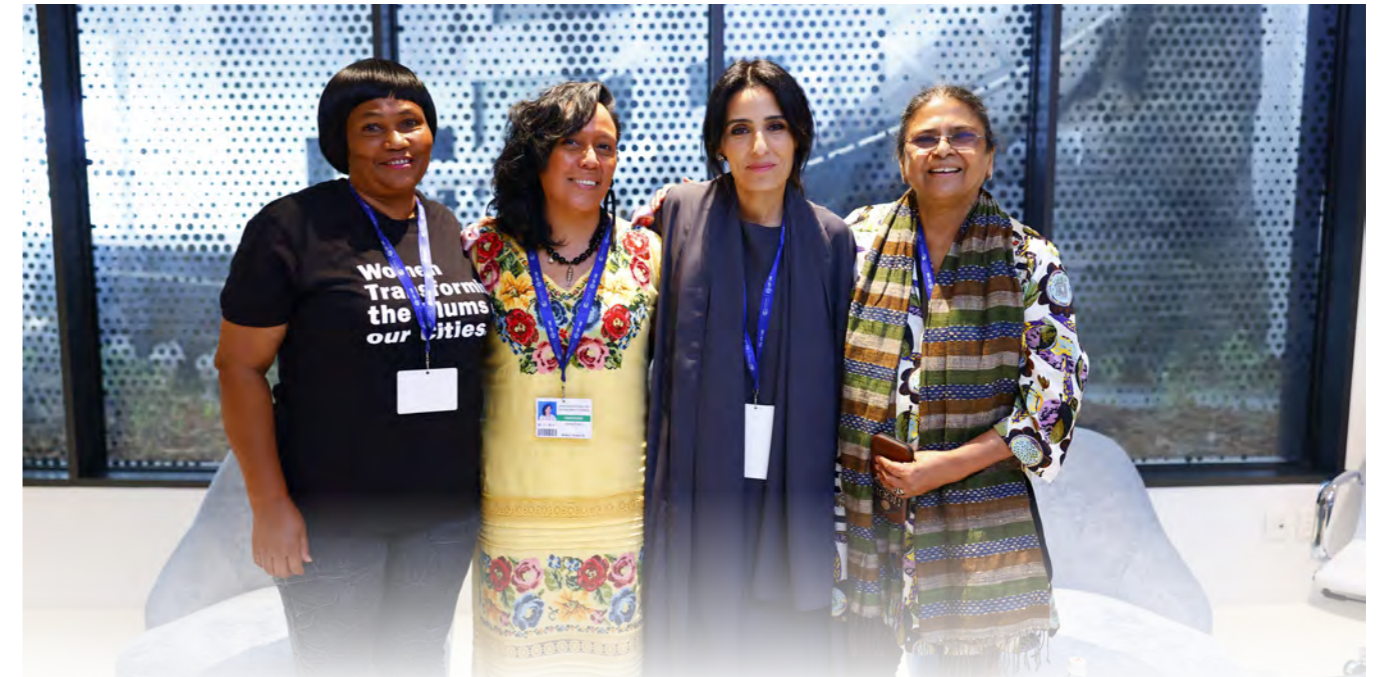
Representatives of the Gender Data Conference called for the collection of better gender and environmental data

Climate change is not gender-neutral - women and girls are disproportionately affected. And we see that the more that women and girls are included in efforts to tackle climate change and advance sustainable development, the faster we move towards a healthier, safer and more equitable society for all.