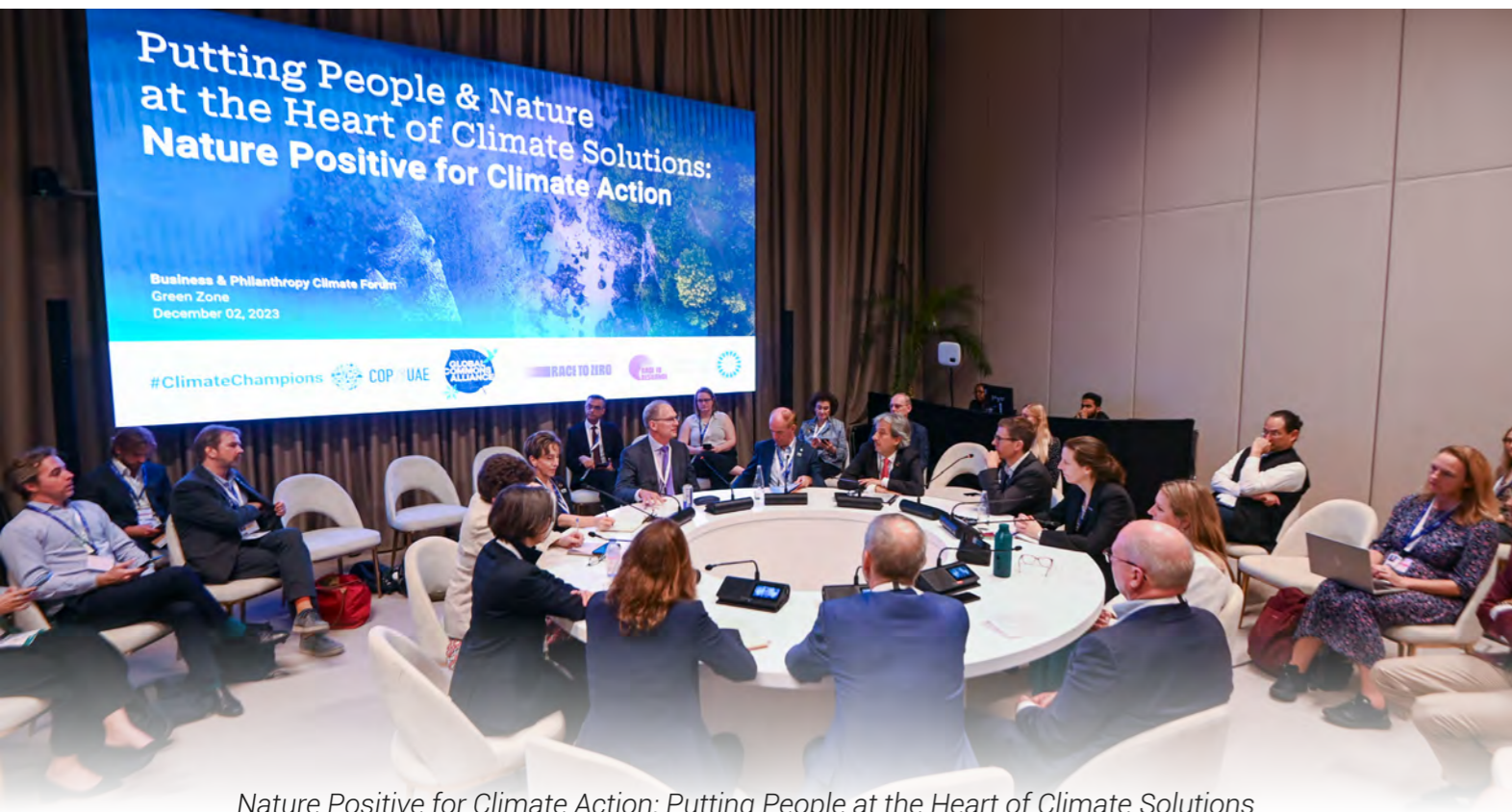
Nature Positive for Climate Action: Putting People at the Heart of Climate Solutions