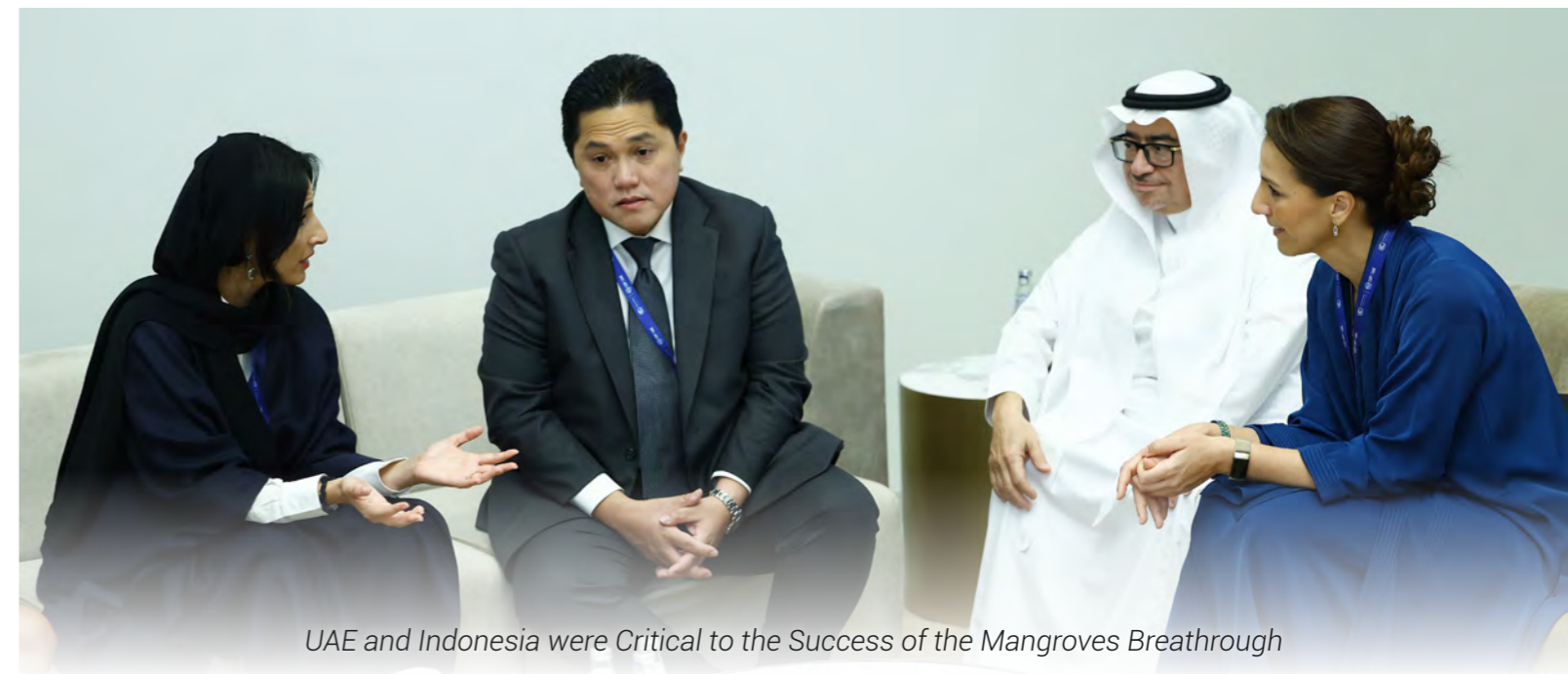
UAE and Indonesia were Critical to the Success of the Mangroves Breakthrough