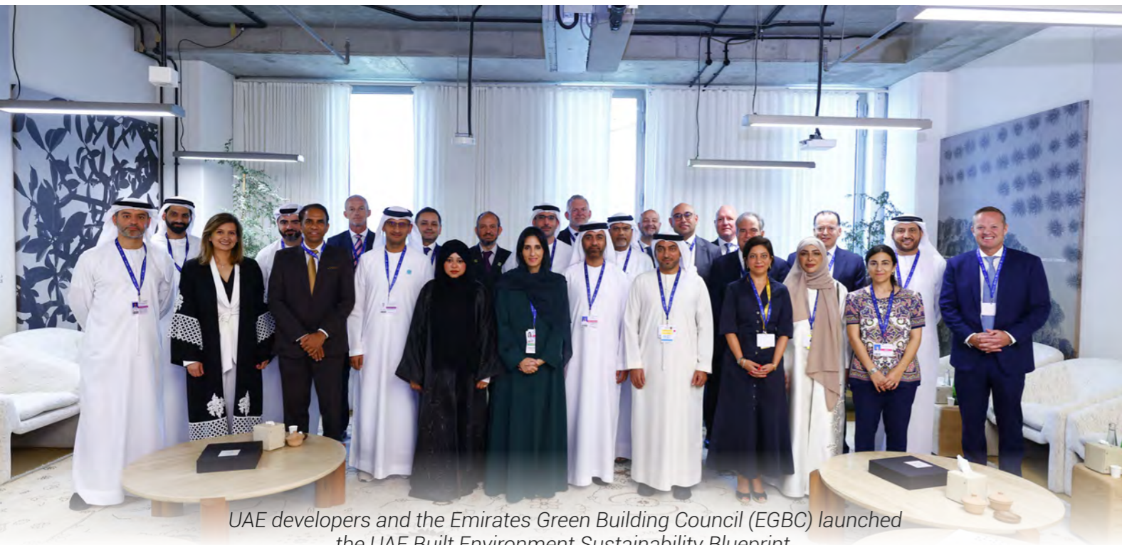
UAE developers and the Emirates Green Building Council (EGBC) launched the UAE Built Environment Sustainability Blueprint.