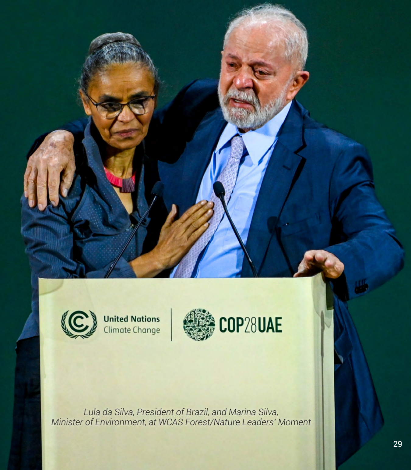
Lula da Silva, President of Brazil, and Marina Silva, Minister of Environment, at WCAS Forest/Nature Leaders' Moment