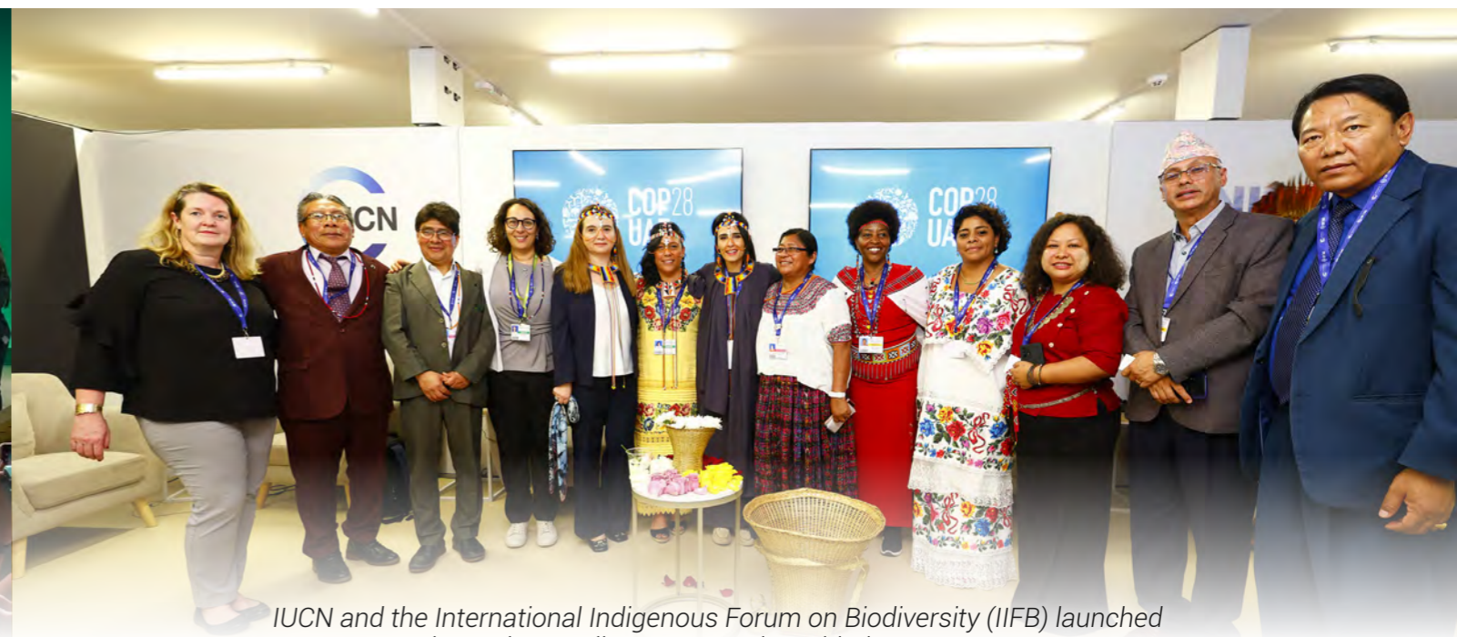
IUCN and the International Indigenous Forum on Biodiversity (IIFB) launched the Podong Indigenous Peoples Initiative at COP28