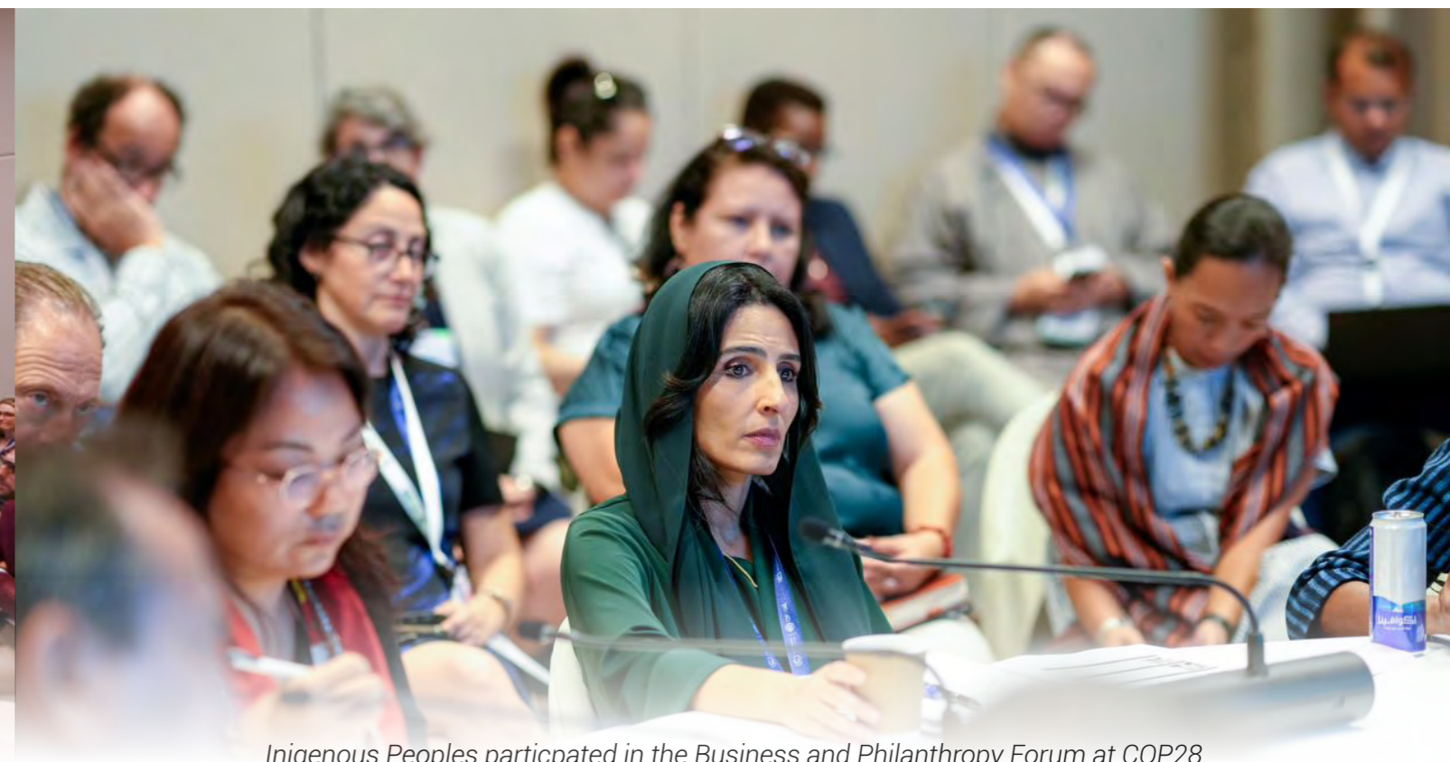
Indigenous Peoples participated in the Business and Philanthropy Forum at COP28