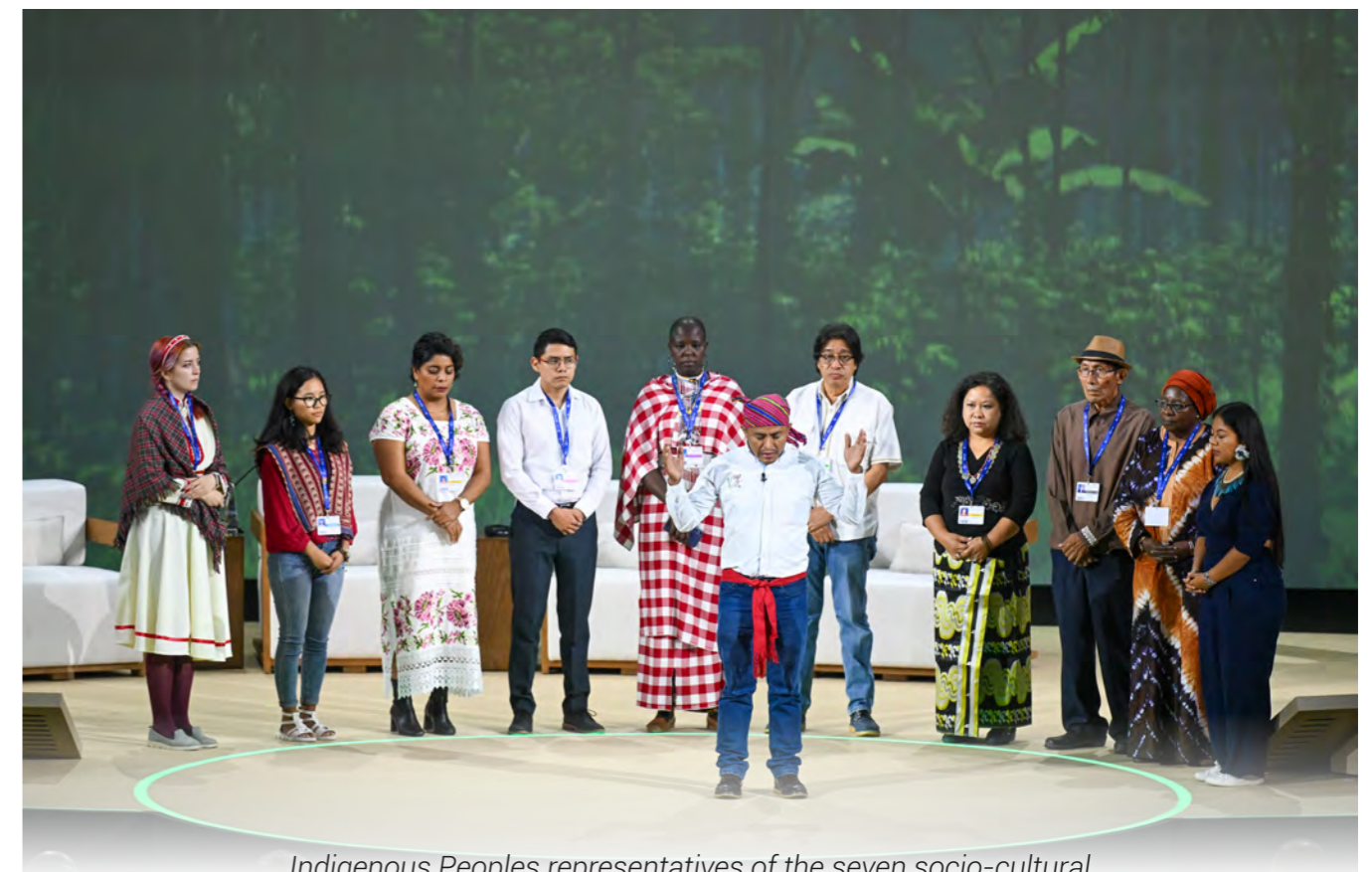
Indigenous Peoples representatives of the seven socio-cultural regions of the United Nations