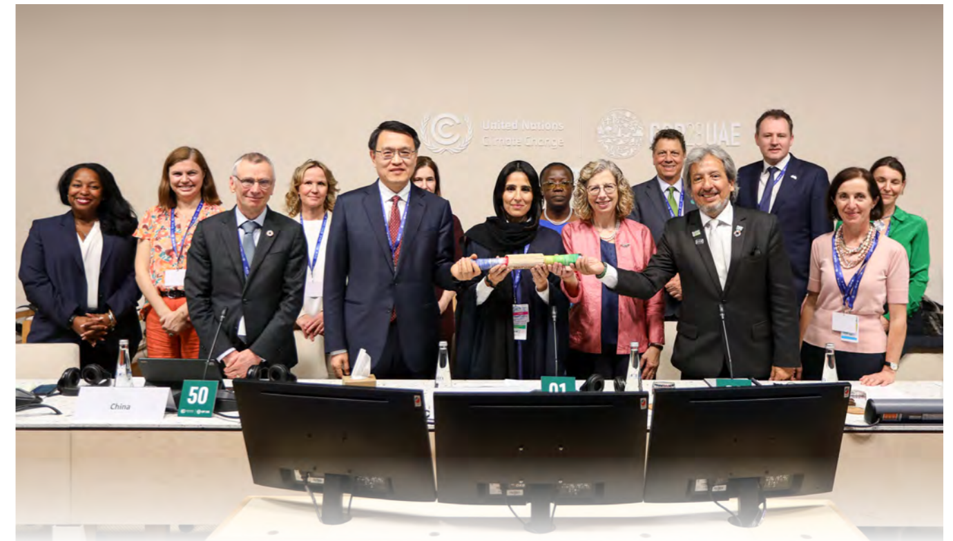
UAE and China Sign Joint Declaration on Nature, People, and Climate

Over 300 organizations and businesses worldwide aligned with the nature-positive transition. More than 200 non-State actors signed the Food Systems Call to Action , complementing the UAE Declaration on Sustainable Agriculture . Furthermore, over 200 businesses and financial institutions joined the call for Nature Positive for Climate Action (NP4CA), committing to nature-focused targets, disclosures, and investments. The Urban Nature Program was also launched by ICLEI and other global partners, emphasizing nature-focused investments in urban areas. The Program will be co-led by the World Bank through its Global Platform for Sustainable Cities (supported by the GEF) , the UN Environment Programme (UNEP) as part of the UN Decade on Ecosystems Restoration, and ICLEI – Local Governments for Sustainability in partnership with the World Resources Institute , International Union for Conservation of Nature (IUCN) , C40 Cities and World Business Council for Sustainable Development (WBCSD) . The program is supported by the High-Level Climate Champions.