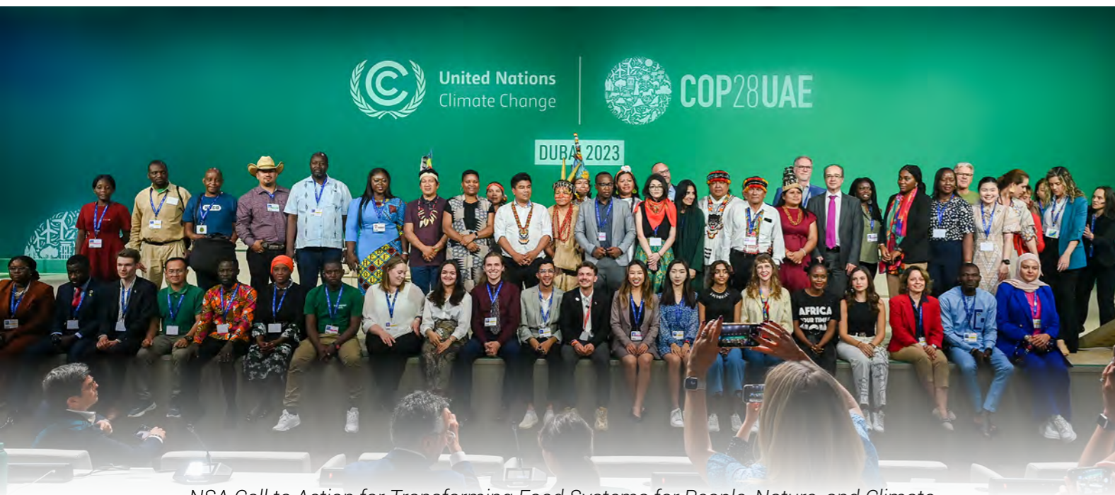
NSA Call to Action for Transforming Food Systems for People, Nature, and Climate