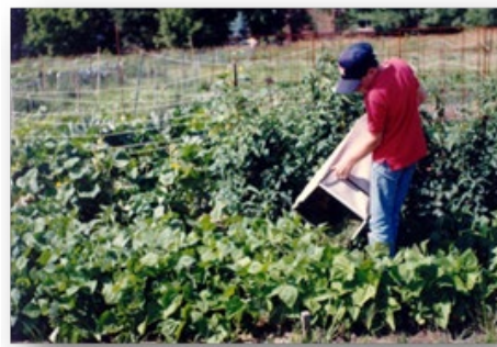
Figure 5. Grass clippings are great for the vegetable garden and around annual flowers. Directly from the bag, place them around the plants in thin layers, allowing each layer to dry before adding more.

Mulch changes the way that heat is transferred to the ground and surrounding structures. Gravel mulch transfers more heat to underlying soil than wood chip mulch. This may serve to keep landscape plants in better overall health in cold-winter temperate climates like ours. On the other hand, it can also transfer heat to buildings and utilities or cause some tender plants to begin growing too early in the spring. Wood chip mulch insulates the soil against temperature swings, but the surface temperature of sun-exposed wood mulch can be hotter than that of gravel mulch. Match your mulch to your situation.