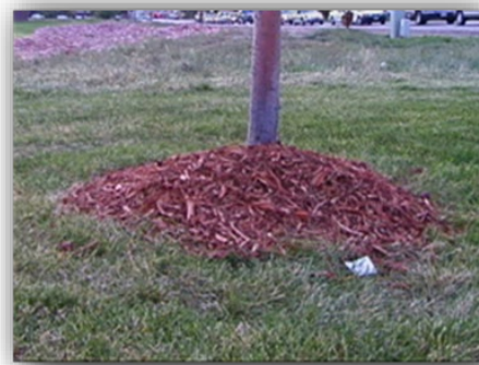
Figure 6. Never make a “mulch volcano.” It leads to decay of the bark and interferes with trunk taper. Keep mulch back six inches from the trunk.

Wood chip mulch is great for trees and shrubs, protecting trees from lawnmower damage. However, do not make “mulch volcanoes” around tree trunks by applying chips up against a tree’s trunk, as seen in Figure 6 . Wet chips piled up against the trunk can cause bark problems and interfere with growth. Keep the mulch back at least six inches from the trunk, and do not apply too deeply.