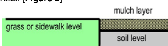
Figure 2. To keep mulch in place, drop the soil level in the mulch bed so the top of the mulch is at the grass or sidewalk level.

An effective alternative is to drop the soil level on the mulch bed three inches, so the top of the mulch is at grade level. However, ensure that the mulched bed does not fill with water draining from higher areas. [Figure 2]