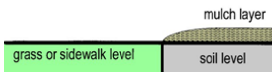
Figure 1. Mulch added above grade spills out onto the lawn or sidewalk.

It is a common practice to add mulch above grade level. Without a defined edge, the mulch can spread off the bed onto lawns or sidewalks, creating a mowing or trip hazard. [Figure 1]