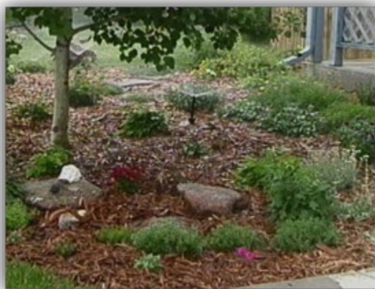
Figure 4. Wood chip or bark mulch in the perennial and shrub bed enhances soil tilth over time.

An important consideration for wood chip and bark mulch stems from the intense sunlight and typically dry conditions across much of Colorado. Wood chips exposed to high surface temperatures from intense sunlight can become hydrophobic, preventing water infiltration to the soil. Wood chip or bark mulch, therefore, is not recommended for use in xeriscapes or with open planting plants unless it can be frequently checked and distributed to maintain its ability to conduct water to the soil. Wood chips under a canopy of leaves or in regularly irrigated settings are typically not affected by hydrophobicity.