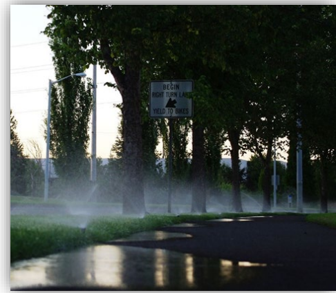
Figure 2. Sharing lawn irrigation.

A similar but more durable option is plastic tubing with drip emitters inside it at regular intervals. This is sometimes called "drip tape" or "dripline." Ideally the tubing would be run in a circle around the tree near its drip line.