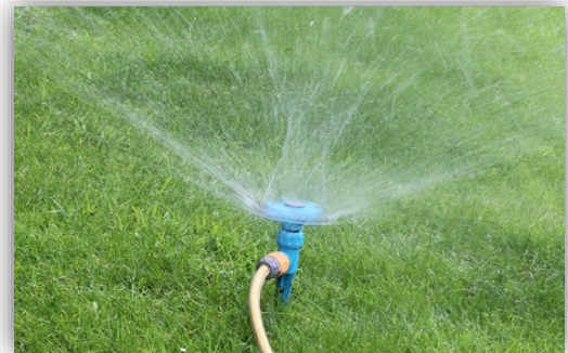
Figure 3. Hose and sprinkler.

A hose and sprinkler are an effective way to water trees. [Figure 3] A hose and sprinkler should always be used when the lawn irrigation system is turned off. Place several cups in the pattern of the sprinkler to collect output or attach a water meter to the hose to determine how much water was applied. The most effective place to water mature trees is just outside the dripline, NOT at the trunk. Depending on the type of sprinkler, it may take thirty to sixty minutes of run time to apply one inch of water.