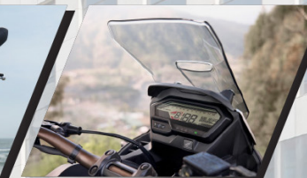
FULL DIGITAL METER PANEL