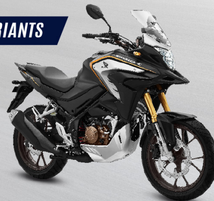
MATTE GUNPOWDER BLACK METALLIC