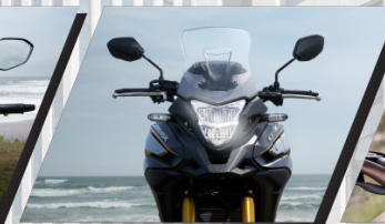
ALL LED LIGHTING SYSTEM