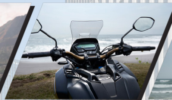
TAPERED HANDLEBAR & COCKPIT DESIGN