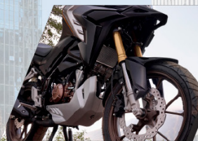
INVERTED FRONT SUSPENSION