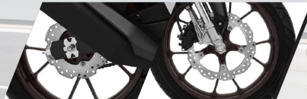
FRONT AND REAR WAVY DISC BRAKE