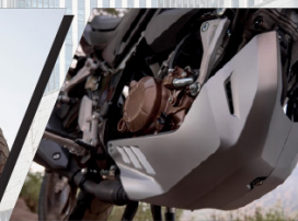
ADVENTURE STYLE UNDERCOWL