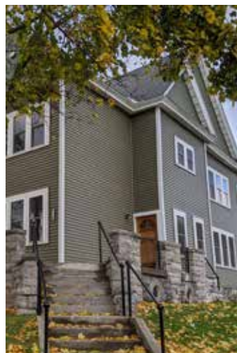
LEFT: Before RIGHT: After CREDIT: City Link Architecture - Syracuse, NY