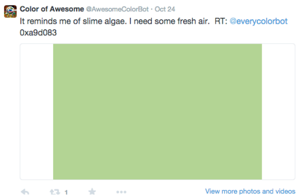
Figure 3. A tweet with a colour, a name, and an attitude.

@AwesomeColorBot also tailors its tweets to suit the category of a name, to produce outputs like that of Fig. 3.