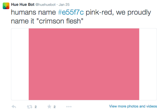
Figure 1. A tweet with both RGB hexcode and apt name.

A Twitterbot named @HueHueBot has been constructed (by the second author) to showcase the perceptually-anchored creativity of this readymade-based approach to colour-name invention. An example tweet of this bot, with attached colour sample, is shown in Fig. 1.