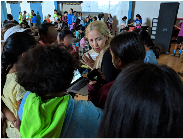
Figure 1: Alysia demo in a middle school. Line up of students waiting to try Alysia first hand. One of many facets of evaluating Alysia via broad audiences pre-launch. Student faces blurred to protect privacy.

Users asked us to assist with lyrics creation, many did not have the production skills to use Digital Audio Workstations to flesh out Alysia’s melodies, and many more struggled with singing. We got a lot of feedback on the melodies themselves: An expert musician pointed out that the melodies consist of too many large intervals, while users wanted melodies that are less varied in both pitch and rhythm (notably, this finding directly conflicted with the user study that we had conducted in the academic context, where Alysia’s melodies appeared too monotone based on subjects’ preference for more varied tunes in their ranking). If we were to help people create songs, we had to do a lot more work. This gave our team a huge push forward, and we completed what was originally supposed to be a five year research plan (and more) in less than a year.