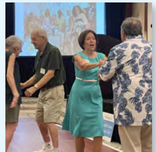
Sarasota, FL – During Cancer Resource Network’s “Celebrate the Music of Life” Cancer Survivors Day event, participants joyfully hit the dance floor.