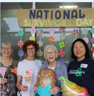
Dallas, TX – Survivors are all smiles during the "It's a Sweet Life!" National Cancer Survivors Day® celebration at the Cancer Support Community North Texas Clubhouse.

Event volunteers enthusiastically dish up ice cream sundaes for survivors and their families.