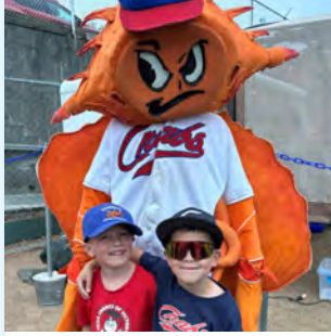
Arcata, CA – Two young attendees pose for a photo with Crusty, the Humboldt Crabs mascot, as part of the Cancer Survivors Day hosted by Providence St. Joseph Hospital Cancer Program.