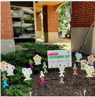
Naperville, IL – During Edward-Elmhurst Cancer Center's "Hope Grows Here" Celebration of Life, cancer survivors were greeted with a "flower" display.