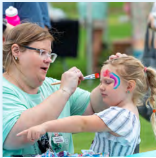
Oklahoma City, OK – In Scissortail Park, a young attendee enjoys a face painting session during INTEGRIS Health Cancer Institute's National Cancer Survivors Day® celebration, which featured dance performances and craft projects.