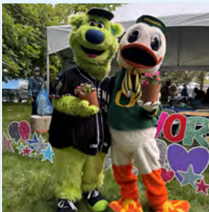
Eugene, OR – Eugene Emeralds mascot Sluggo and The Oregon Duck welcome guests to the planting station during the Oregon Cancer Foundation's "Hope Blooms!" Survivors Day celebration.