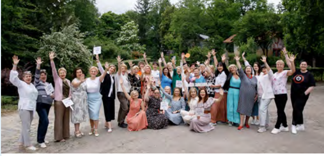
Lviv, Ukraine – Event attendees hold up their hands and NCSD photo-op signs in excitement while celebrating life in High Castle Park during LIVE NOW's National Cancer Survivors Day® event.