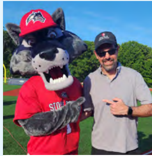
Stony Brook, NY – Stony Brook University mascot Wolfie the Seawolf and a surgical oncologist greets cancer survivors and their supporters at the NCS D event hosted by Stony Brook Cancer Center.