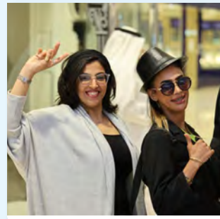
Jeddah, Saudi Arabia – Event guests strike a pose during the King Faisal Specialist Hospital & Research Center's NCSD Celebration of Life at the Roshana Altahlia Center.