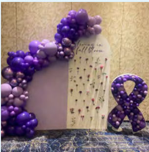
Staten Island, NY – Event guests are greeted with a beautiful display at The Florida Cancer Center’s “Living in Full Bloom” NCSD celebration hosted by Northwell Health.