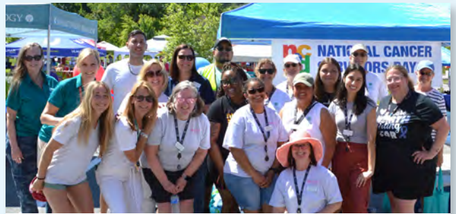
Annapolis, MD – Event staff and volunteers get ready to honor survivors and bring awareness to the challenges cancer survivors face ahead of Maryland Oncology Hematology and Wellness House of Annapolis's Cancer Survivors Day celebration.