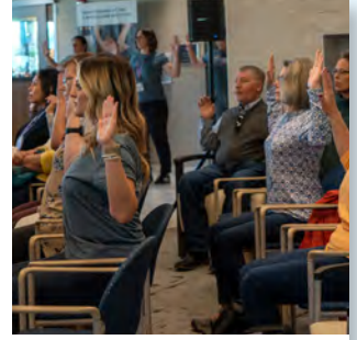
A group of attendees participate in a chair yoga demonstration during the Celebration of Life.