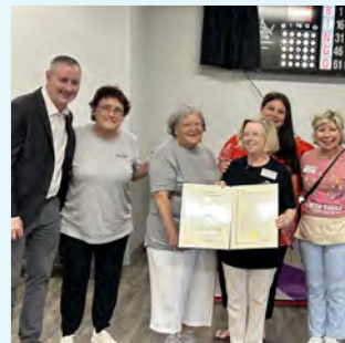
Philadelphia, PA – Cancer Support Community Greater Philadelphia is presented with a congressional proclamation and record during their National Cancer Survivors Day® event.