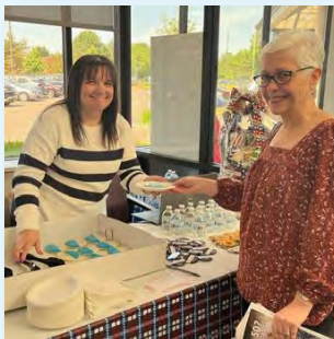
East Syracuse, NY – An event attendee accepts a cookie during the Cancer Survivors Day celebration hosted by Hematology-Oncology Associates of CNY.