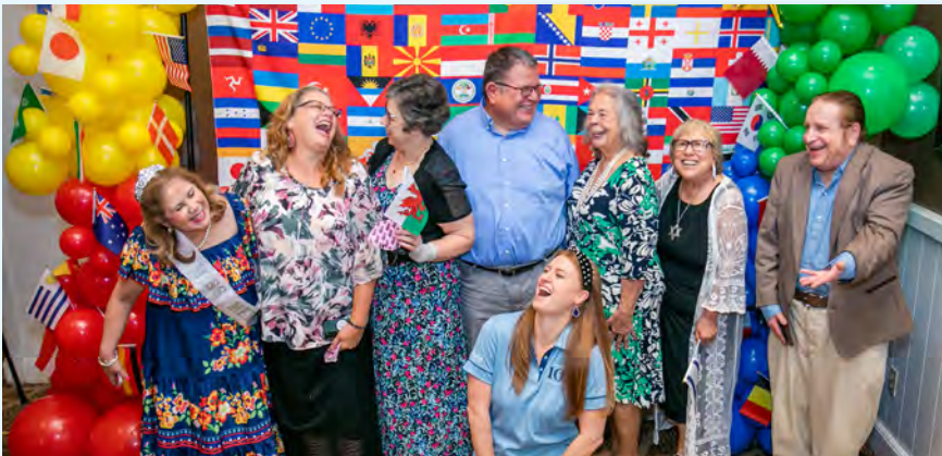
ON THE COVER: Sugar Land, TX – Music therapist Ashley (center) shares a joyful moment with survivors and caregivers as part of the “United, Surviving and Thriving” National Cancer Survivors Day® celebration hosted by Houston Methodist Sugar Land Hospital.

Coping's Official Coverage of National Cancer Survivors Day® 2024