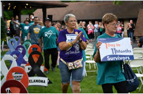
Evansville, IN – Cancer survivors gather together grouped by length of survivorship while attending the 7th annual Tri-State National Cancer Survivors Day® event hosted by Cancer Pathways Midwest.

An event attendee poses for a photo with therapy pig Teddy during the Celebration of Life.