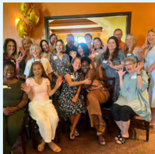
Durham, NC – Lung cancer survivors share a joyous and silly moment at the “Sunshine and Self-Care” Survivors Day celebration hosted by Lung Cancer Initiative.