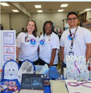
Dayton, OH – Members of the radiation oncology team greet survivors at the National Cancer Survivors Day® Walk and Vendor Fair hosted by the Dayton VA Medical Center.