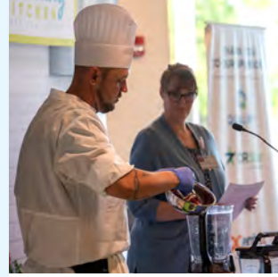
Rapid City, SD – A chef and dietician demonstrates how to make healthy smoothies at Monument Health Cancer Care Institute's Survivors Day event.