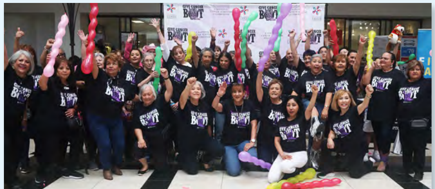
A group of survivors and their supporters sporting matching t-shirts give a rousing cheer during the celebration.