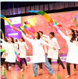
Mumbai, India – Survivors give a dance performance for the 15th annual UGAM celebration held to empower childhood cancer survivors, advocate for survivorship issues, and create awareness of childhood cancer at the NCSD event hosted by the Indian Cancer Society.