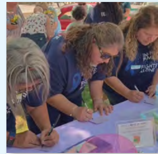
Midland, TX – Event guests write notes of hope to infusion patients during Gifts of Hope's "Hope Grows Here, Hand in Hand" National Cancer Survivors Day® event.