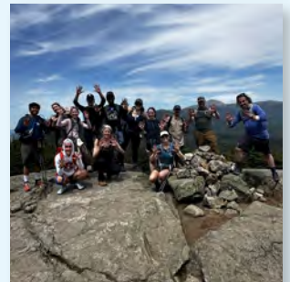
White Mountains, NH – Camp Casco “Camp Champions” pause at the top of Mt. Jackson to celebrate summiting the 10th of 11 peaks in two days to raise money to support childhood cancer survivors in celebration of NCSD.