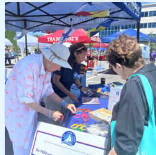
Annapolis, MD – Survivors stop by the Sail Beyond Cancer Annapolis booth to gather resources and gifts during the Maryland Oncology Hematology Survivors Day event.