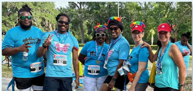
Orange Park, FL – A group of event participants don their finisher medals following the 10th annual Pink Ribbon Symposium Butterfly 5K Run/Walk.