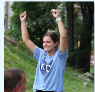
Kansas City, MO – During Gilda's Club Kansas City's National Cancer Survivors Day® celebration, event attendees participate in an instructor-led yoga session.