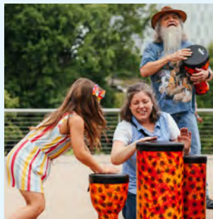
Greenville, SC – Survivors and their families celebrate with music and fellowship during the Upstate Cancer Network and Greenville SC Cancer Survivors Park NCS D celebration.