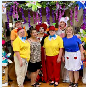
Las Cruces, NM – Staff show off their "Wonderland Tea Party" outfits during the NCS D Celebration of Life hosted by Memorial Medical Center.