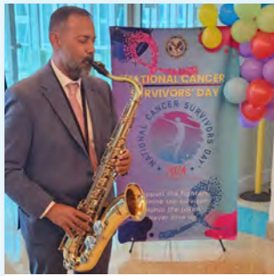
San Juan, Puerto Rico – A bone marrow transplant survivor plays the saxophone for fellow survivors and hospital staff at the NCSD event hosted by San Juan VA Hospital.