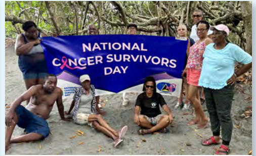
Choiseul, St. Lucia – Survivors enjoy time in nature at a protected mangrove and serve soup at Owen King European Hospital as part of the Faces of Cancer St. Lucia National Cancer Survivors Day® celebration.