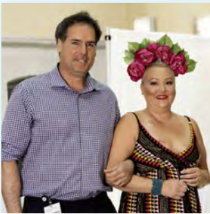
West Palm Beach, FL – A member of medical staff and cancer survivor walk arm in arm down the runway at the Good Samaritan Medical Center's "Surviving in Style" NCS D fashion show.