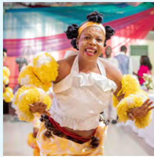
Uyo, Nigeria – Event attendees are treated to a celebratory dance performance during Only Believe Care Foundation's "Cancer Care, Uniting for a Cure" Survivors Day event.