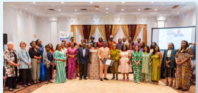
Calgary, Canada – Along with the Mayor of Calgary Jyoti Gondek (center), survivors and caregivers gather together for The Oladele Foundation and African Cancer Support Group’s National Cancer Survivors Day® event.