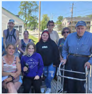
Bradley, ME – Survivors and caregivers enjoy fellowship and a treat at Spencer's Ice Cream during the NCSD celebration hosted by Purple Iris Foundation.