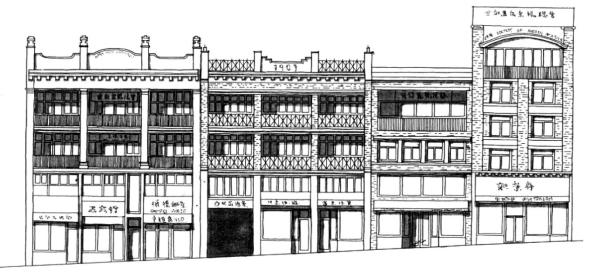
Figure 1 - Society Heritage Building Streetscape of the 100 Block of East Pender Street - North Side From left to right: Wong Benevolent Association building (1921 alternations, 1904 original building), Lee building (no longer owned by a Society), Lung Kong Kung Shaw building (1923), and the Mah Society building (1913).