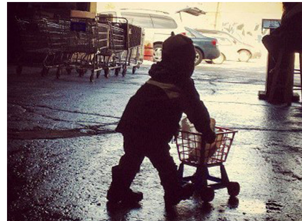
Recycle HERE! Holden location (District 5)