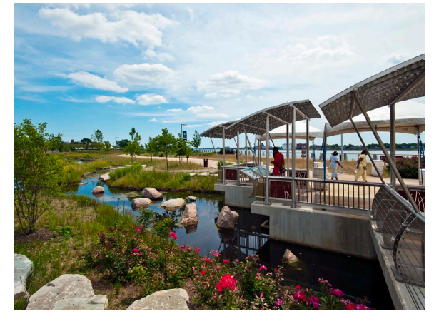
Milliken State Park at Detroit River (District 5)