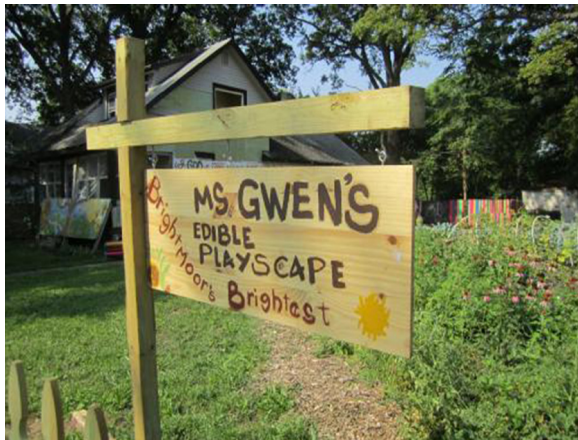
Brightmoor Farmway (District 1)

Detroit must recognize the role a healthy environment plays in creating a city where people want to live, work, and raise a family.