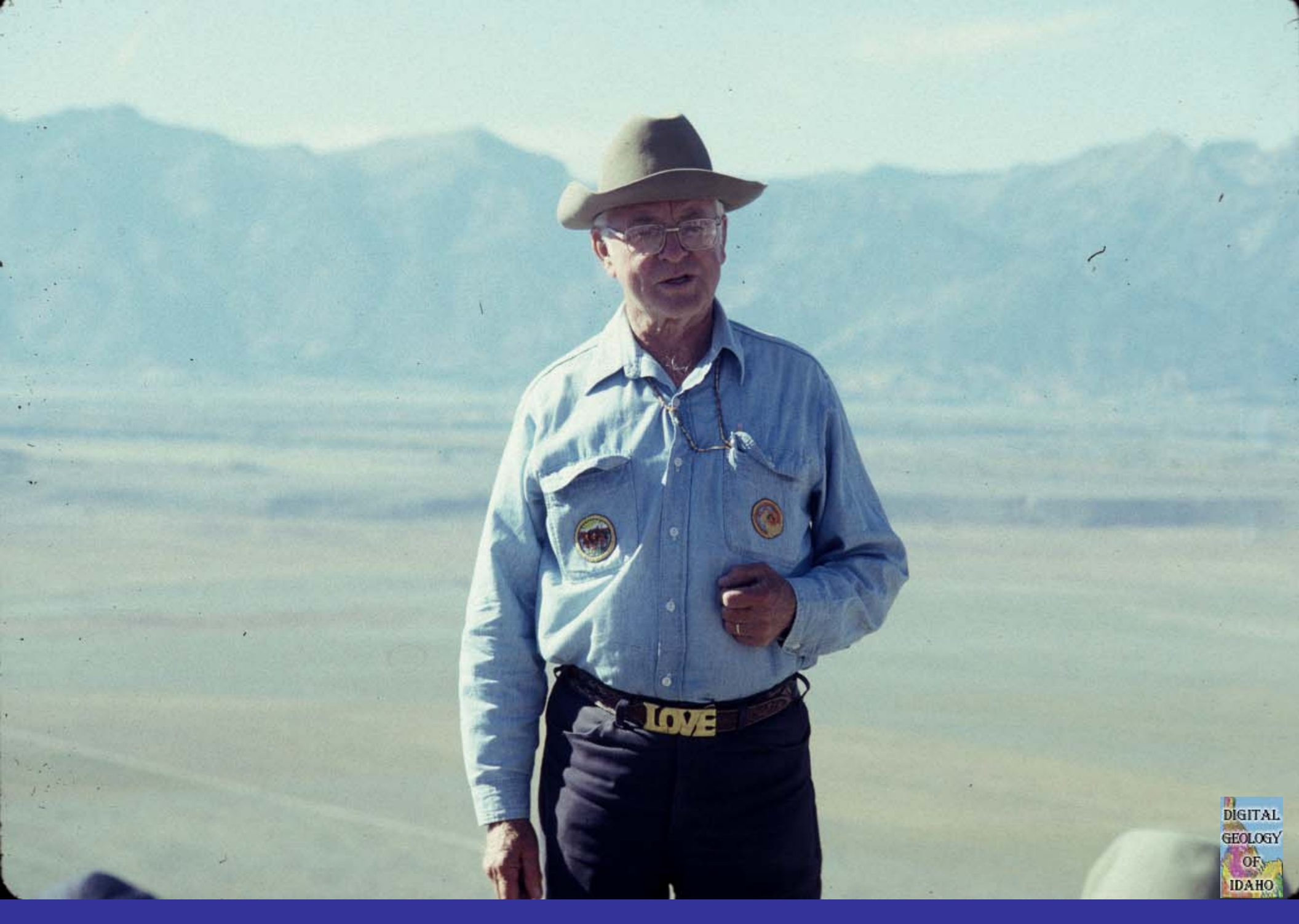
Photo of long-time famous Teton area geologist, Dave Love, circa 1990.