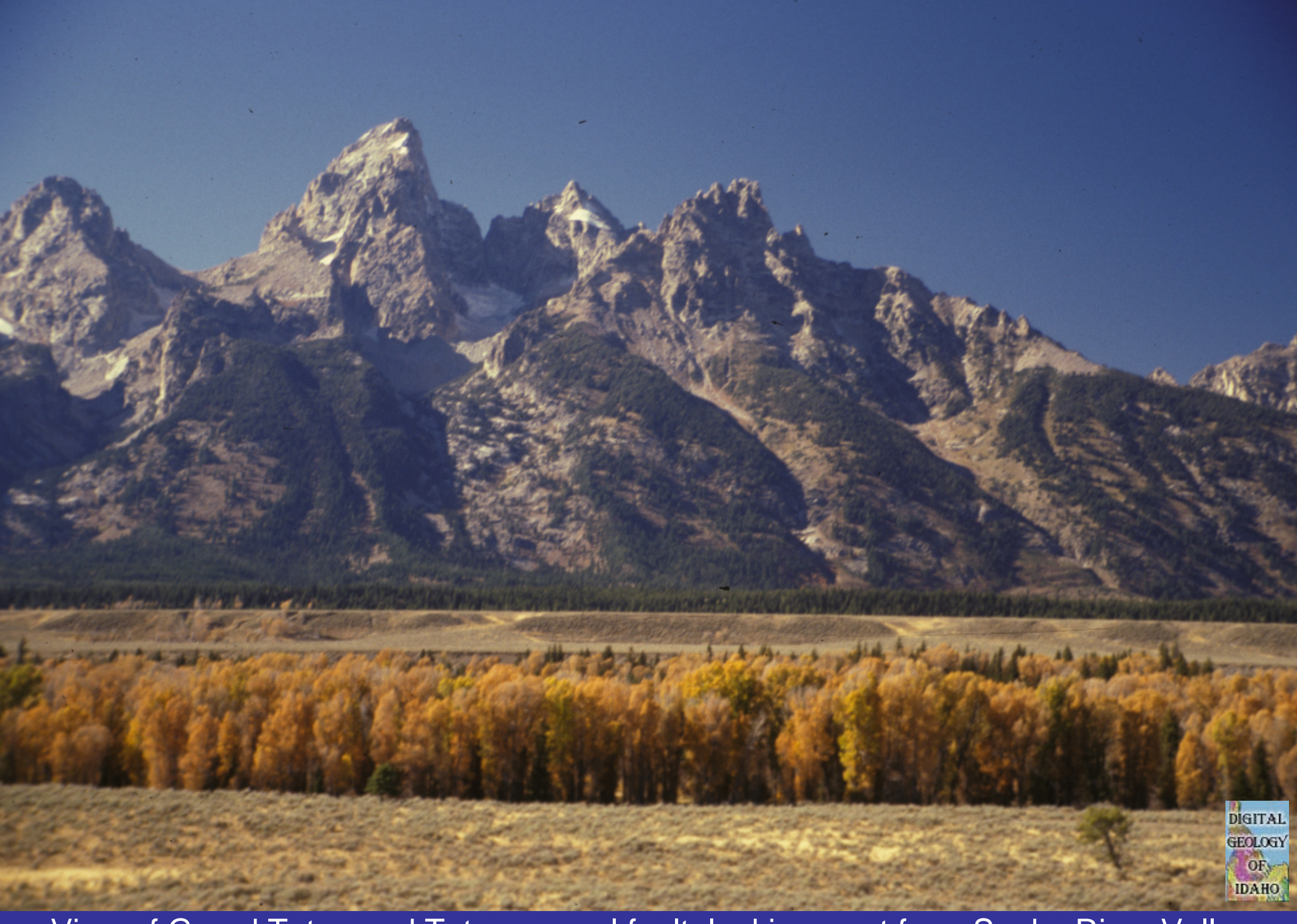
View of Grand Teton and Teton normal fault, looking west from Snake River Valley. Note Snake River terraces in foreground.