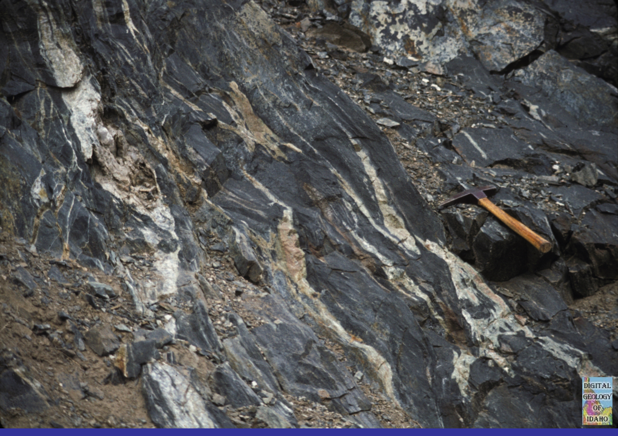
Archean Amphibolite with isoclinally folded quartz veins.