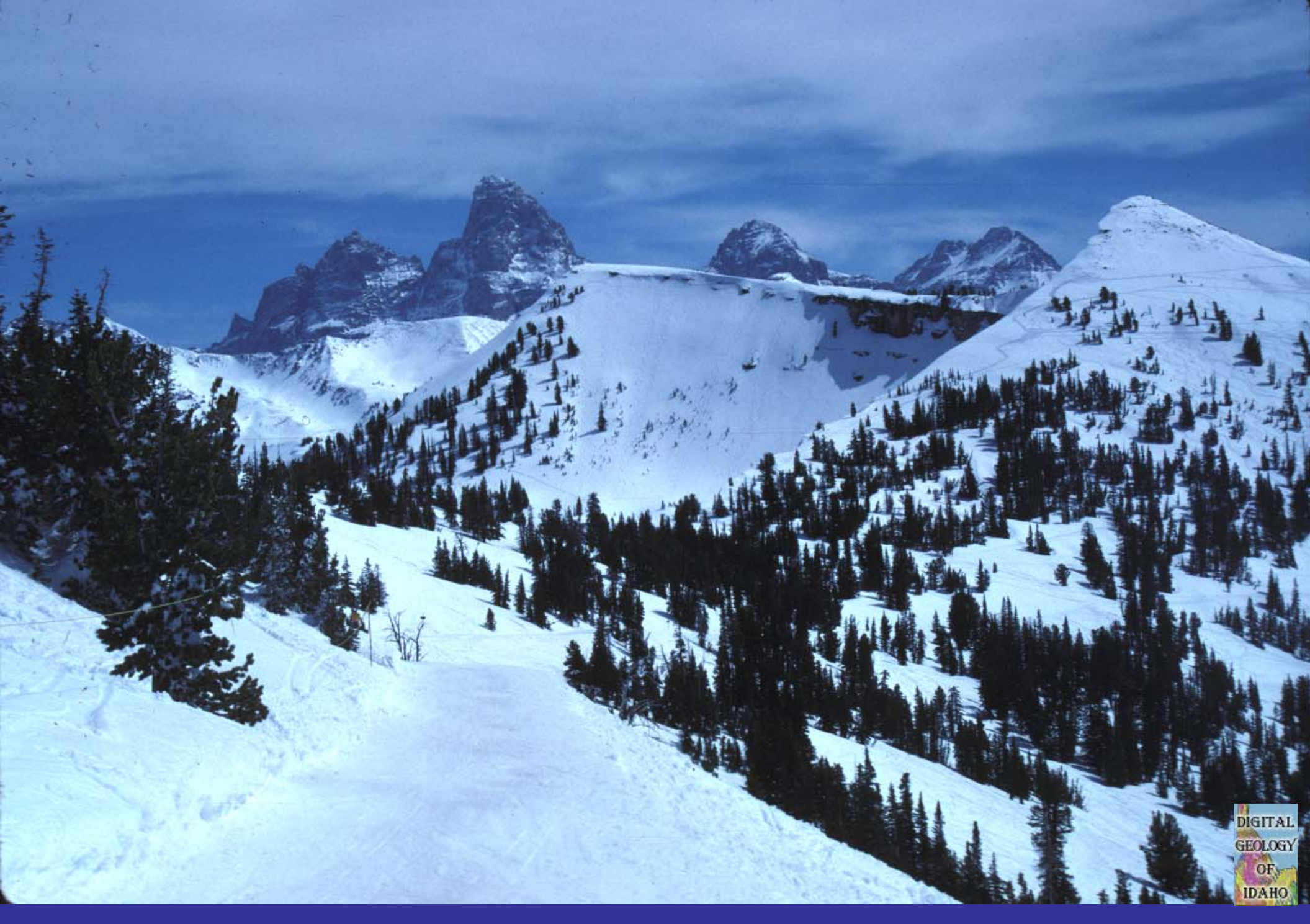
View of Grand Teton, looking east from Targhee Ski resort.