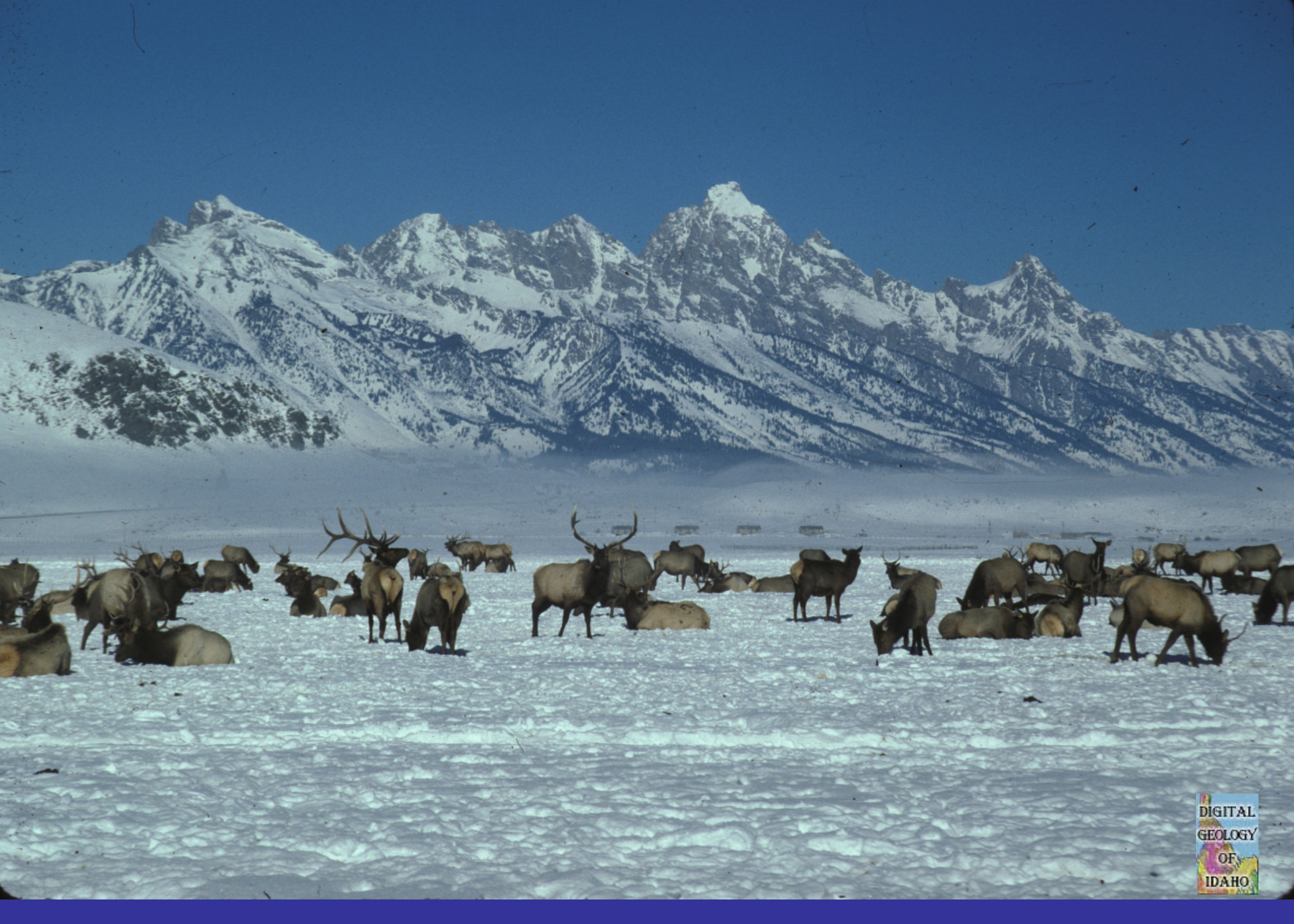
View of Teton Range from the southeast, with elk in the foreground.