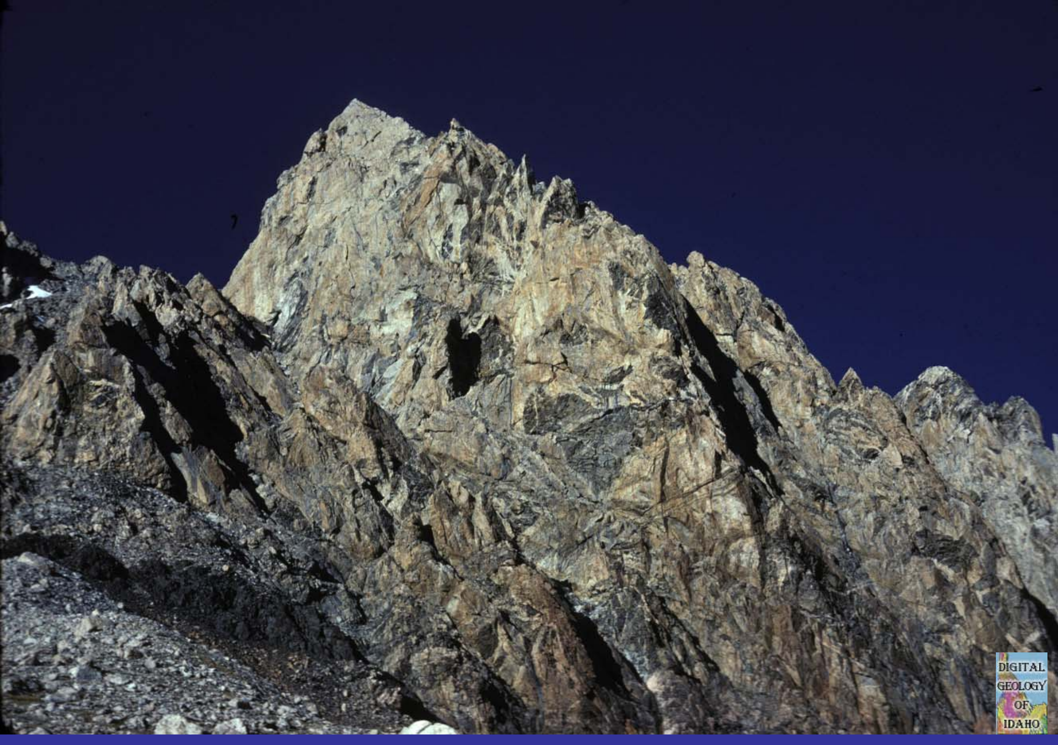
Here is a photo of the Grand Teton. It contains Archean gneiss intruded by granite. The dark blocks in the photo are amphibolite.