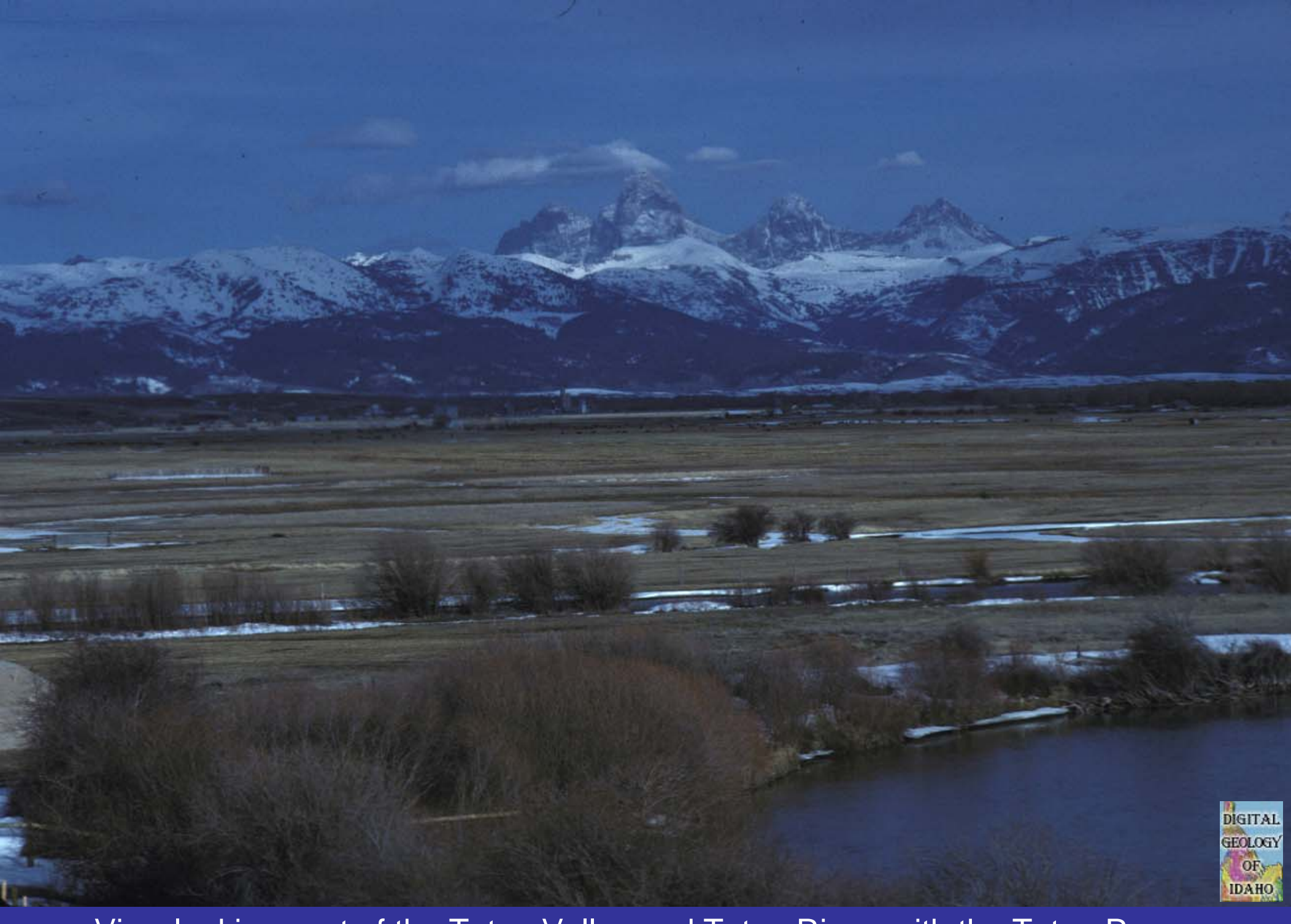
View looking east of the Teton Valley and Teton River, with the Teton Range and Grand Teton in the background.