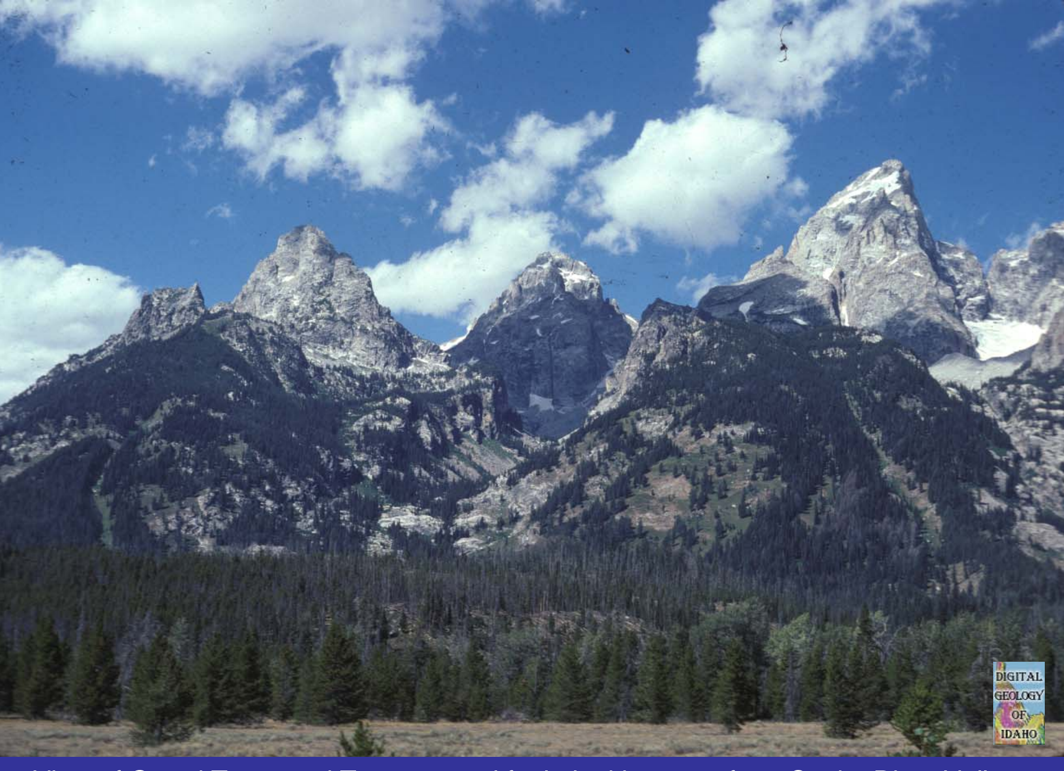
View of Grand Teton and Teton normal fault, looking west from Snake River Valley.