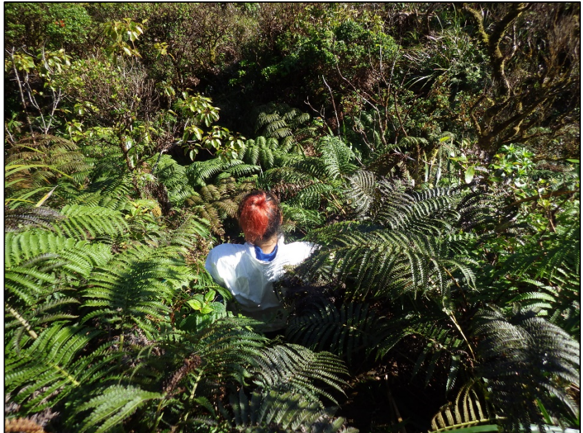
Above: Surveying through dense ground cover. Crews wear Tyvek in order to make sure seeds do not get spread from dirty gear or clothing.

Cane ti threatens priority watershed habitat in Poamoho, an area in the northern Ko‘olau Range that hosts 11 animals and 18 plants with federal status, meaning these species are vulnerable to or have a high risk of extinction. The O‘ahu Army Natural Resources Program (OANRP) discovered the highly invasive cane ti ( Tibouchina herbacea ) in the Poamoho region in 2008. This aggressive weed was not known to be naturalized on O‘ahu, but it is widespread on both