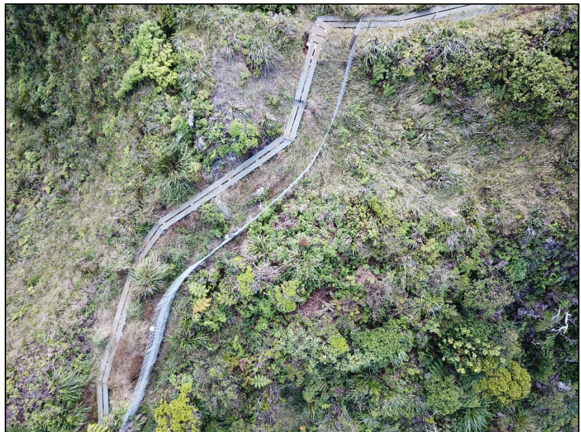
Below: The new boardwalk at the summit of Poamoho trail.