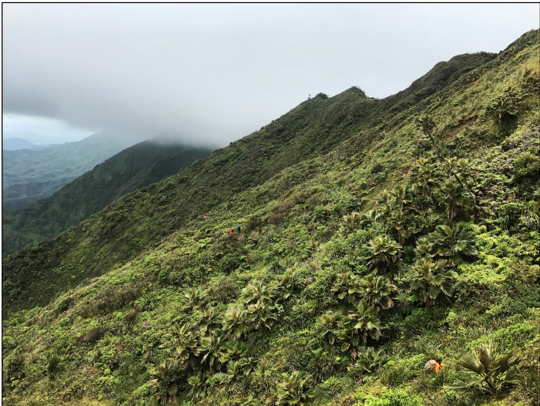
Surveying for Cane ti on the windward side of Poamoho