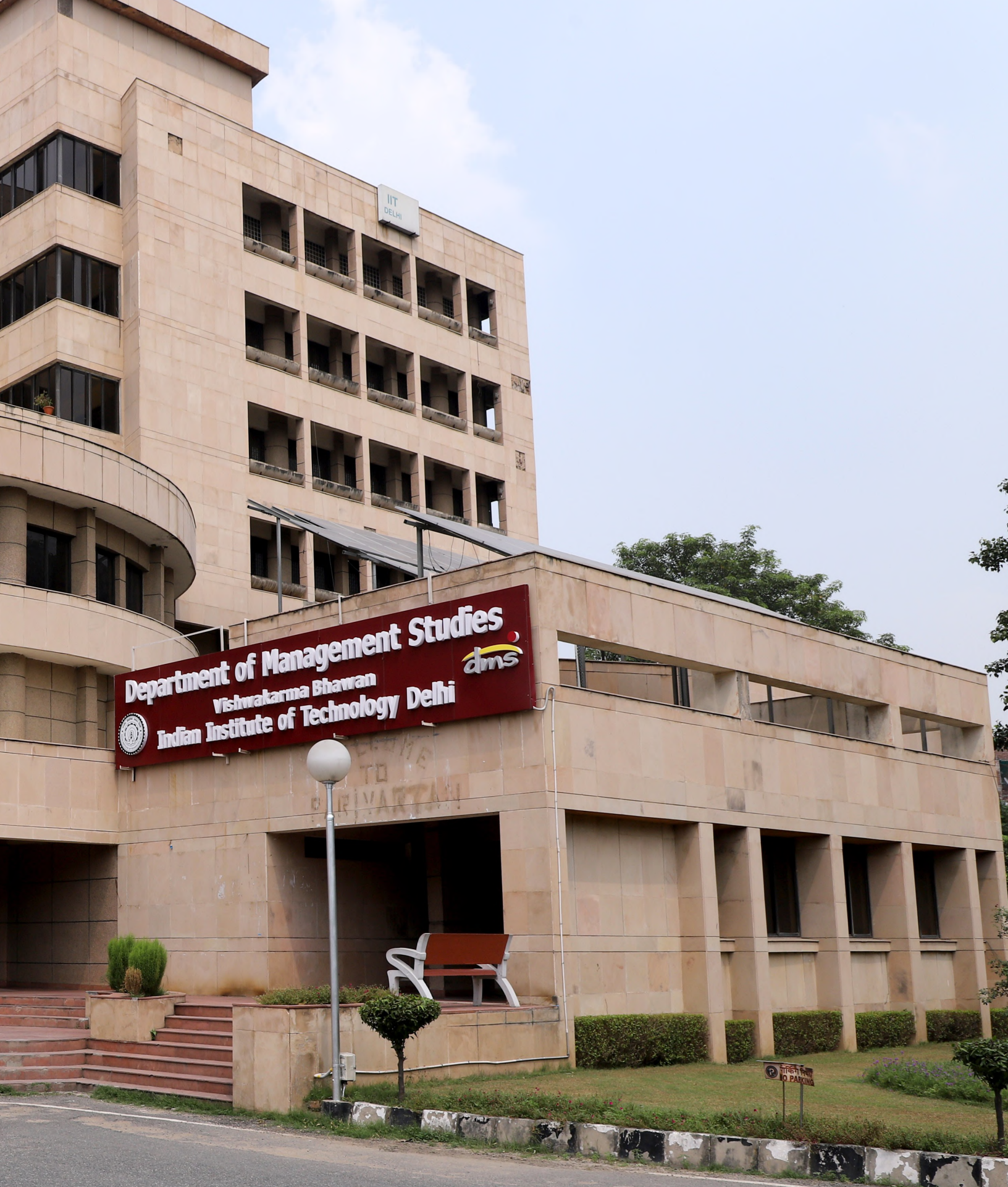
Department of Management Studies Indian Institute of Technology, Delhi