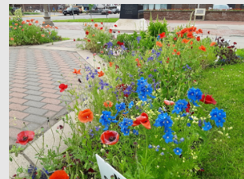
From the 2021 season

Dunn County Master Gardeners are hard at work getting gardens planted and programs underway. One such garden volunteers have supported for many years is at the Dunn County Veterans Memorial where every year volunteers create a beautiful display.