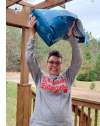
Strong bones is paying off! 30# bag of dog food. I couldn't even pick up this bag a year ago!

A series of virtual strength training sessions for older adults where they improve strength, balance, and flexibility. This effort helps them to stay healthy and socially connected with other seniors throughout the state.