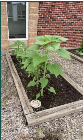
Youth garden at River Heights

A key strategy of Extension programming is live presentations whether in-person or online (which allows for increased access to Extension expertise and resources). Examples of 2021 programming efforts include my work on the Foundations in Horticulture Steering Committee. Foundation in Horticulture is a self-paced, statewide, online course that teaches research-based methods to grow plants and manage pests. In 2021, the course was piloted in several counties including Dunn. The course had over 300 statewide participants. Part of my work with this committee included serving as a lab instructor and coordinating the newly added Q & A sessions that involved interactive sessions with 13 Extension specialists on topics of soils, insects, plant disease, wildlife, weeds, container growing, fruit, vegetables and lawns.