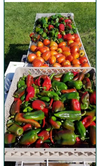
Dunn County Jail Garden produce donated to area food pantry

To support volunteer development, in 2021, we piloted a Master Gardener Mentorship Program. The overall goal of the program was to help acclimate new volunteers to their local Master Gardener Program and, ultimately, increase volunteer retention. I reviewed feedback from the mentees and found that 86% stated that the mentorship had helped them become better familiar with their local Master Gardener Program and helped facilitate their involvement in volunteer service. In general, mentees described the program as successful because it provided hands on learning opportunities, support to get started volunteering and occasion to learn from an experienced gardener. The results were very positive and supported our program objective. Successful mentoring programs have been shown to increase volunteer retention.