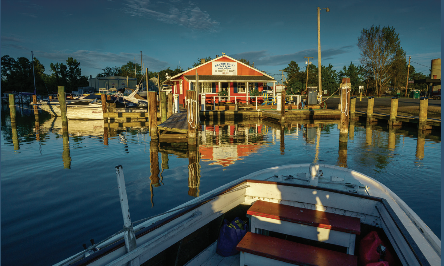
Easton Point Landing