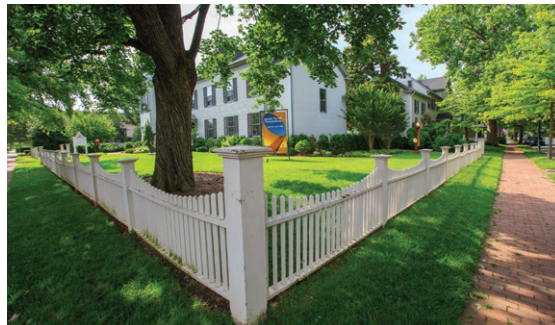
Academy Art Museum