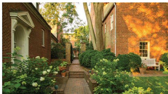
Talbot Historical Society

27 S. Washington St. The Neall families were Quakers and cabinet makers. Their house is an example of the high-style Federal townhouse, although more conservative than the Bullitt House. One of the largest and finest townhouses of its period on the Eastern