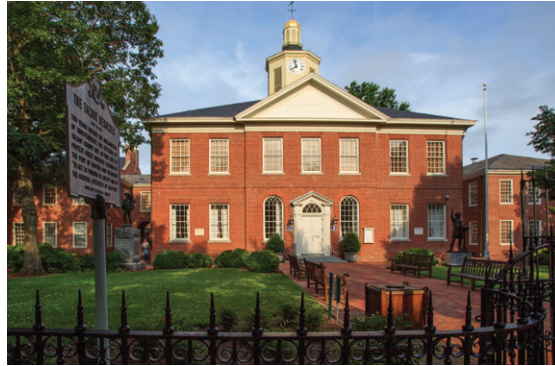
Talbot County Courthouse

14 Talbot County Courthouse: (1792) 11 N. Washington St. Beginning in 1692, court was held in private homes in Talbot County. In 1712, a courthouse was erected in Easton but was replaced with the current structure.