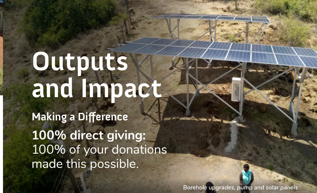
Borehole upgrades, pump and solar panels

100% direct giving: 100% of your donations made this possible.