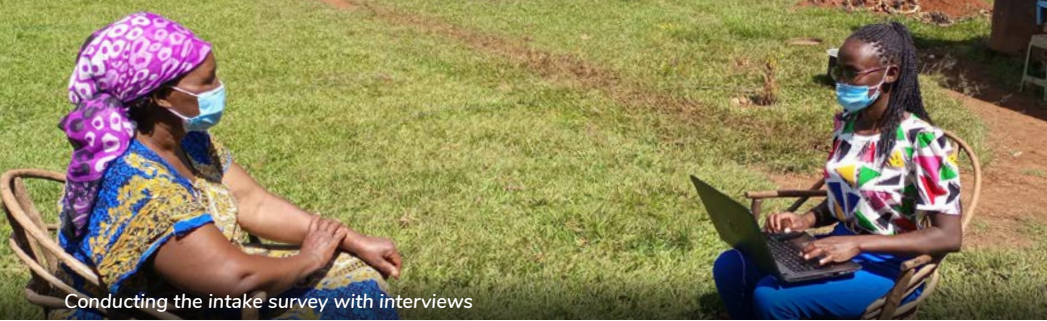
Conducting the intake survey with interviews