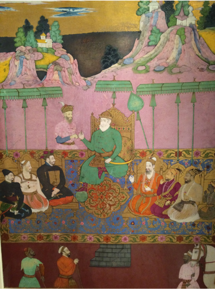
Figure 9 New York, MET, Kamal Muhammad and Chand Muhammad. The House of Bijapur . Ink, opaque watercolour, gold and silver on paper, 1680 ca. 41,3 × 32,5 cm.

of the new Mughal emperor, Aurangzeb – an uncompromising Sunni. According to Zebrowski, the MET painting is the most important work created during the reign of young Prince Sikander (Zebrowski 1983, 150). It was commissioned for the king from two artists, Kamal Muhammed and Chand Muhammed, and the attribution is confirmed by an inscription in Persian on the left side of the picture (Haidar, Sardar 2015, 154). Aspects pointed out by the curator of the Metropolitan