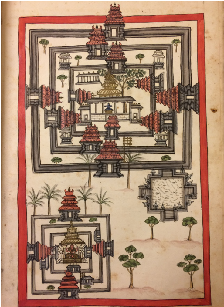
Figure 24 Venice, Biblioteca Nazionale Marciana, Codex Ita VI 136 (=8300), Libro Nero , c. 81 r. Anonymous Indian artist for Nicolò Manucci, The Temple of Kanchipuram . Watercolour on paper, 1700-10 ca., 415 × 250 cm

cent photographs show. 13 The colonnaded rooms and the majestic red gopuram (the towers through which the holy yard of the temple