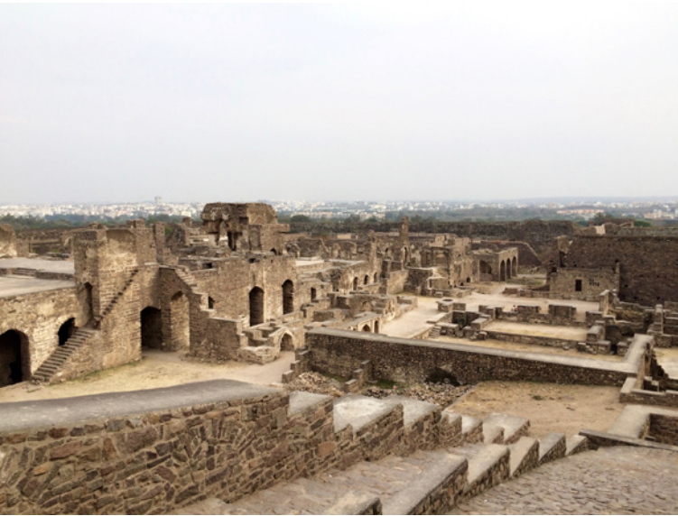
Figure 3 View of the Golconda fort

nucci proved to be a diplomatic success. Shortly thereafter, he was appointed a Knight of the Order of Santiago by the Portuguese, an important noble title which brought him a great deal of money and prestige (Irvine 1907, 2: 282-3).