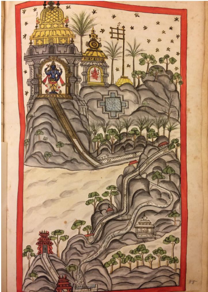
Figure 22 Venice, Biblioteca Nazionale Marciana, Codex Ita VI 136 (=8300), Libro Nero , c. 85. Anonymous Indian artist for Nicolò Manucci, View of the Temple at Tirupati . Watercolour on paper, 1700-10 ca., 415 × 250 cm (© BNM)

fours, or on their knees, others at full length, rolling their body over and over. Others carry up water to wash the temple, et cetera. (Irvine 1907, 3: 143-4)