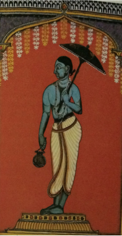
Figure 19 Warsaw, Warsaw University Library (476):. Anonymous Indian artist for a French commercial agent of Andhra Pradesh, The Avatar of Vishnu, Vamana. Watercolour on opaque European paper, 1680-1700 ca.