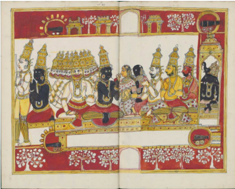
Figure 20 Paris, Bibliothèque Nationale de France. Shurapadma et le siens dans la magnifique ville de Viramahendrapatnam qu'il fit édifier par son beau-père. Watercolour on paper (Karikal-Tanjore) from the Histoire de Shiva assembled by the French agent Abraham Pierre Porcher des Oulches. BnF OD 39 f. 91v-92, Cat. RH nr. 298 a-b.

time of Gorla's second visit, that is, between 1699 and 1710. Nobody could give Gorla better information on Hindu costumes than Manucci: he had been living in India all his life and was an expert, because he was writing his work just at that time.