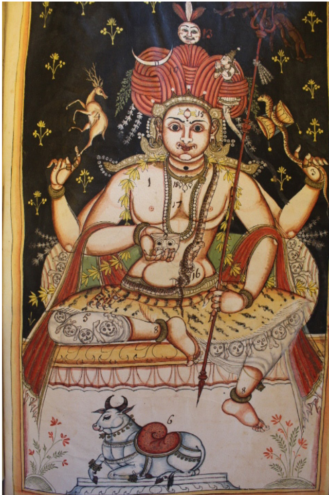
Figure 17 Venice, Biblioteca Nazionale Marciana, Codex Ita VI 136 (=8300), Libro Nero . Anonymous Indian artist for Nicolò Manucci, Shiva represented as Rudra with his vehicle the sacred bull Nandi. Watercolour on paper, 1700-10 ca., 415 × 250 cm

representation which has always fascinated the Europeans, accentuating their propensity for the 'exotic' (Archer 1970, 104-13). This happened during the seventeenth century, but also in the eighteenth century and the early nineteenth century, when British colonial influence became predominant in India, with enormous consequences for systems of representation as well.