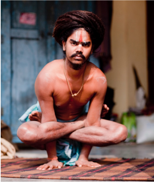
Figure 27 The same yoga posture, kukkuṭāsana , meaning 'the cock pose' executed by a yogi in our times and captured by photography

forms of devotion of Hinduism, which can even have dangerous effects on the ascetic's health. The leg, forced in that position for long, can atrophy and gangrene can set in, as shown in the picture where the penitent's leg is rather swollen [figs. 28-29].