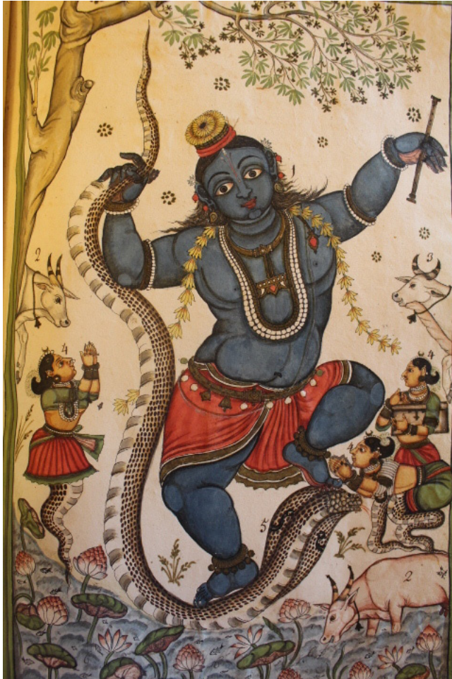
Figure 16 Venice, Biblioteca Nazionale Marciana, Codex Ita VI 136 (=8300), Libro Nero . Anonymous Indian artist for Nicolò Manucci, Lord Vishnu depicted with the cosmic snake and some devotees. Watercolour on paper, 1700-10 ca., 415 × 250 cm

Other rites represented in Libro Nero can still appear bizarre, incomprehensible or shocking, under Western eyes. Notwithstanding this, they were pictured without censure by Manucci's artists. These customs still survive in photographs of ascetics engaged in difficult yoga poses or in the ecstatic ritual consumption of drugs, along with radical deprivations, which today reach their utmost celebration during the Khumb Mela . As the English scholar Mildred Archer has argued, the typology of these images corresponds to a genre of artistic