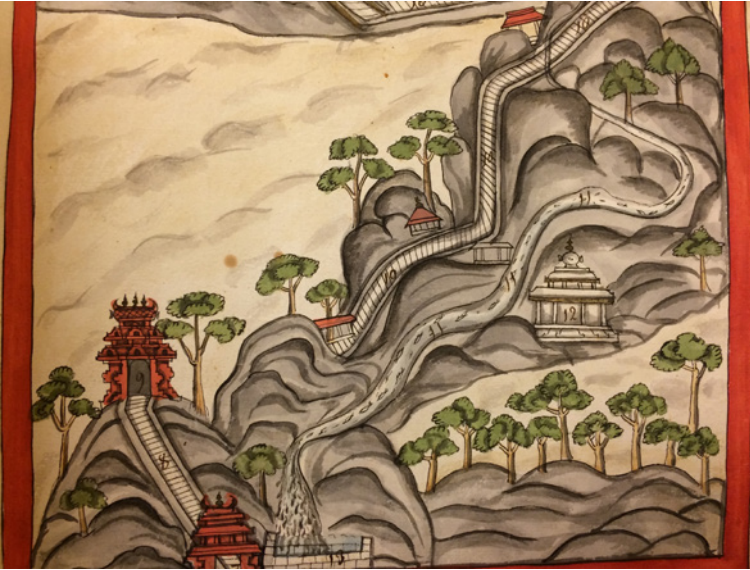
Figure 23 Venice, Biblioteca Nazionale Marciana, Codex Ita VI 136 (=8300), Libro Nero , c. 85. Anonymous Indian artist for Nicolò Manucci, View of the Temple at Tirupati (detail). Watercolour on paper, 1700-10 ca., 415 × 250 cm

ci's view this topic was very interesting for a European readership. One of these illustrations represents the significant southern Indian architectural complex in the Tamil Nadu region: the Kanchipuram temple (Manucci writes "Cangivaron" in his caption), one of the most relevant religious sites ever built in southern Tamil Nadu. In his manuscript, Manucci offers highly accurate – for their time – representations of the two main Hindu temples of the Kanchipuram site, which is confirmed by modern site plans and Manucci's description (Irvine 1907, 3: 243). They are the Ekambareshvara temple, devoted to Shiva, and the Kamakshi temple. As to the Ekambareshvara temple, which is worth analysing in detail, it is clear that Manucci understands the Shivaite nature, because he has his artists illustrate the holy lingam , the main symbol of Shiva, always present in the sancta sanctorum of the temples of this god and visible at the centre of this representation.