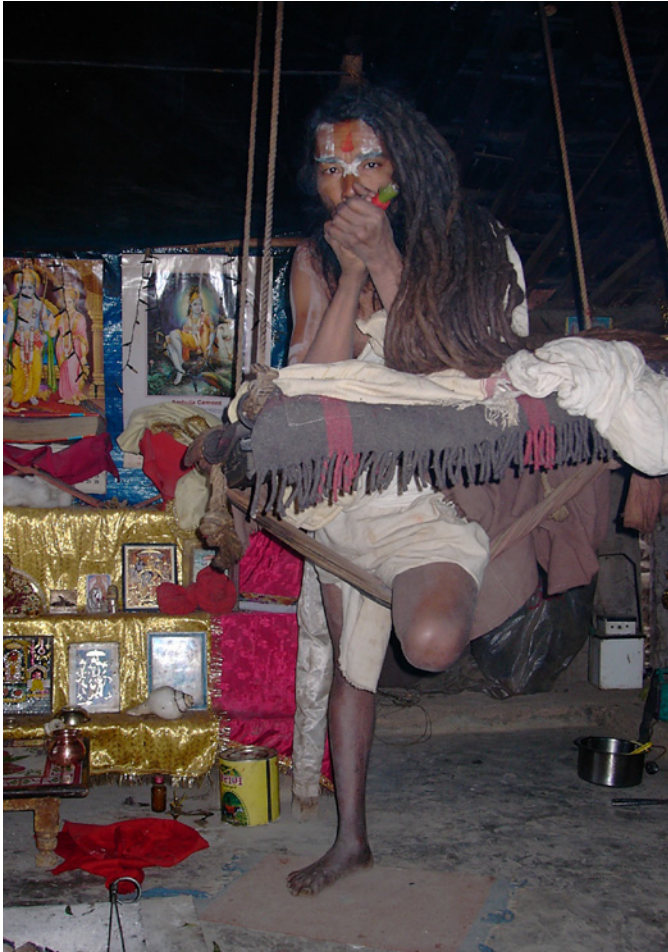
Figure 28 The same image available in the context of contemporary India where the penitent is standing like in the Manucci painting on one single leg and is smoking most likely cannabis and its derivatives

I have seen Hindūs who, on festival days, through religious fervour, climbed up a mast where there was a wheel bearing two iron hooks, and fixing these into their loins at the back, hung down, and praised the idol, swung round three times, making various gestures with their hands and feet. Such persons are held by Hindūs in great esteem. (Irvine 1907, 3: 145)