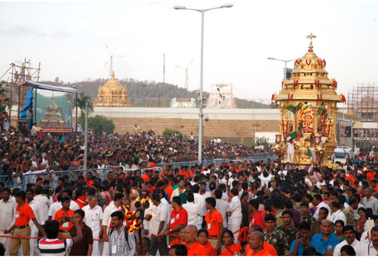
Figure 21 The sanctuary of Tirupati from a contemporary photography

pati temple is very similar to a wall painting of the rock-cut temple of Ramnad, a painting made in about 1720 under the royal patronage of the Setupati dynasty (Howes 2003, 40).