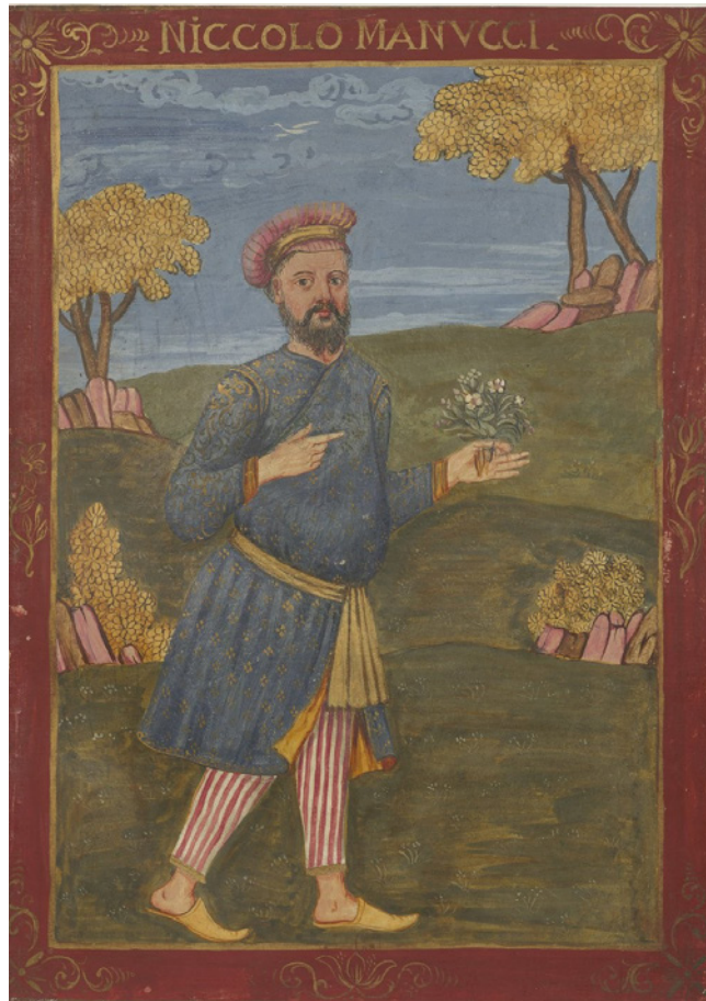
Figure 2 Bibliothèque Nationale de France, Cabinet des Estampes, Codex OD 45 Rés ( Libro Rosso ). Anonymous Indian artist for Nicolò Manucci, Nicolò Manucci as Doctor Gathering Medical Plants in a Landscape . Watercolour on paper with gilded inserts, 1680 ca., 38,5 cm

Manucci commissioned both of these portraits for his books. Some details in these portraits, particularly in the one where the doctor is holding the patient's wrist, may be connected to the wide current of Indian images that represent European subjects. The bibliography on this theme is so vast that it cannot be mentioned here, but one detail that connects Manucci's portrait to an example of such imagery is so notable it must be drawn attention to. The traditional Indian cap he is wearing in the miniature with the patient is very similar to the one of another European portrayed with his family in a Deccan kalamkari