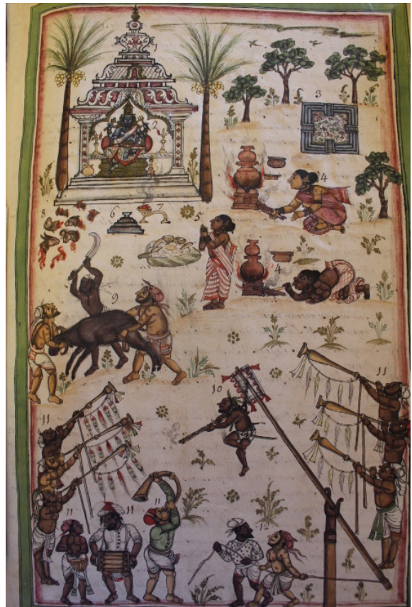
Figure 32 Venice, Biblioteca Nazionale Marciana, Codex Ita VI 136 (=8300), Libro Nero , cc. 38v-39r. Anonymous Indian artist for Nicolò Manucci, Representation of the Cerimonies During the Festival of Kali, Hindu Goddess that Takes Place in the Month of November . Watercolour on paper, 1700-10 ca., 415 × 250 cm