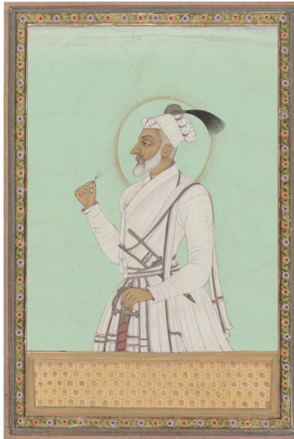
Figure 6 Amsterdam, Rijksmuseum, Witsen Album. Anonymous 17th-century Indian artist, Portrait of the Emperor Aurangzeb with Hailoo . Watercolour on paper, 1686 ca., 61 mm x 308 mm

en Album [fig. 6] (Subrahmanyam 2011, 152 fn. 48; Lusingh Scheurleer 1996, 167-254; Forberg 2016, 213-47; Kruijtzter, Lusingh Scheurleer 2005, 48-60). It is named for collector Nicolaes Cornelisz Witsen who was a wealthy patrician of the Dutch Republic, mayor of Amsterdam and administrator of the VOC, the Dutch East India Company.