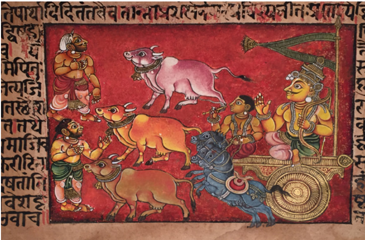
Figure 18 Folio nr. 70 of a manuscript representing the Virata Pravan showing the scene of the Mahabharata when Arjuna and Uttara retake the sacred cows. The drawing was executed in 1680-90 ca. in Tirupati and is an example of portable pilgrimage art (Losty 2013, 158) (© Losty 2013)

der Manucci's direction. Such format was not common for the artists, paper was not a common material for them: Manucci himself provided them with it (Archer 1970, 112). Instead, these artists were used to drawing their pictures on cotton fabric made in the area, the already mentioned kalamkari (Subrahmanyam 2011, 165).