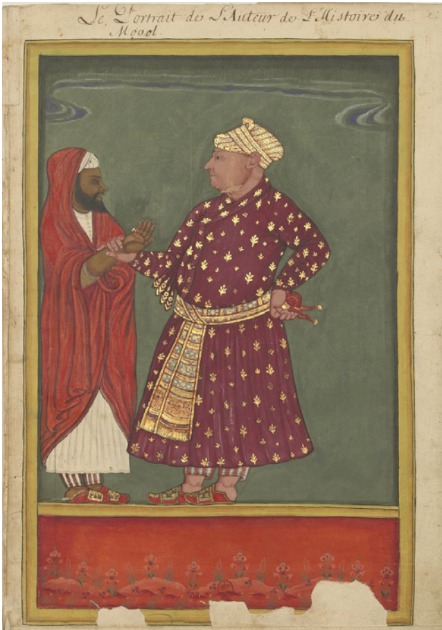
Figure 1 Bibliothèque Nationale de France, Cabinet des Estampes, Codex OD 45 Rés ( Libro Rosso ). Anonymous Indian artist for Nicolò Manucci, Portrait of Nicolò Manucci Dressed in Indian Clothes as Doctor While Holding the Hand of an Indian Patient . Watercolour on paper with gilded inserts, 1680 ca., 38,5 cm

a turban [figs. 1-2]. Manucci is portrayed in middle age, relaxed in a precious gold-embroidered Mughal robe and a pair of local coloured slippers. In the other portrait Manucci is shown collecting medicinal plants in a hilly setting. This piece is characterised by strong influences from Flemish figurative imagery. Manucci himself seems younger, and sports a long beard and a traditional pakol cap, which is still used today in the region between Northern India, Pakistan, and Afghanistan. He also wears an indigo robe and a pair of red and white striped trousers, essentially the classic Indian kurta pajama.