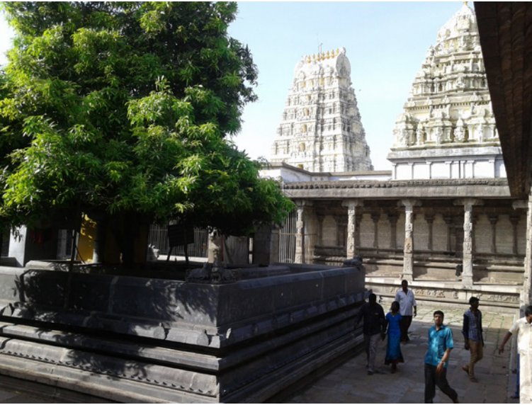
Figure 25 A contemporary photo of the ancient mango tree inside the main courtyard of the temple

can be accessed) are faithfully represented. Both are datable to the period of greatest expansion of the reign, between the fifteenth and the sixteenth century. The representation of the Kanchipuram temples by the Indian artists is again the result of a first-person observation [figs. 24-25]. Manucci was clearly interested in architecture, but even more in any tangible cultural expression of Hinduism. Besides architecture, the Venetian obviously considered ethnography highly relevant: this field of research would gain its definitive expression and importance at the beginning of the eighteenth century, persisting all through the colonial period.