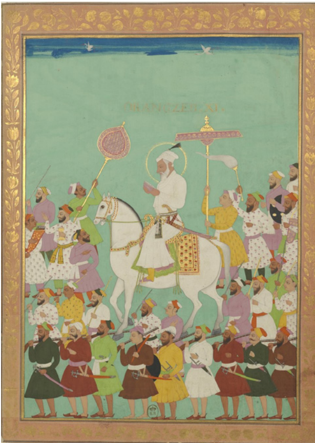
Figure 7 Paris, Bibliothèque Nationale de France, Cabinet des Estampes, OD45 ( Libro Rosso ), f. 13r. Anonymous 17th-century Indian artist for Nicolò Manucci, Aurangzeb. Watercolour on paper, 1680 ca., 38,5 cm

pictures, the one commissioned by Manucci and the other collected by Witsen, Aurangzeb's gestures are remarkably graceful. In one of the portraits, he smells a white flower with an absorbed expression and, concentrated on the scent, his thoughts seem far from the mundane realities of life.