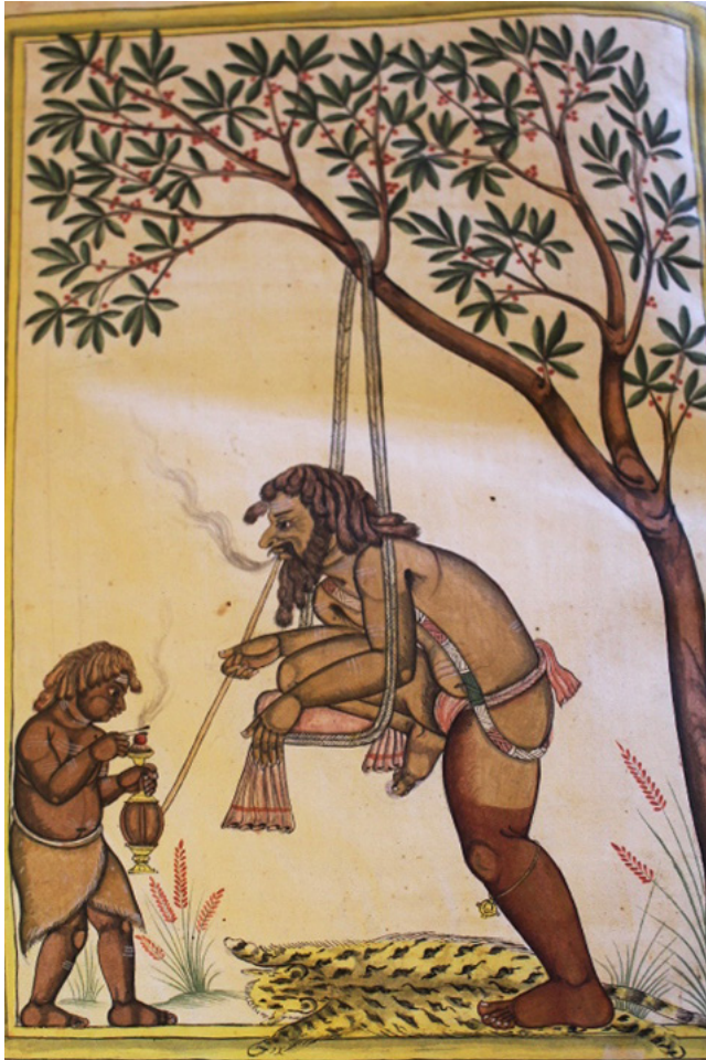
Figure 28 Venice, Biblioteca Nazionale Marciana, Codex Ita VI 136 (=8300), Libro Nero , 1700-10 ca., 415 × 250 cm

la Bibliothèque de Sainte Geneviève , published in 1692 (Du Molinet 1692) [fig. 31]. In spite of the low artistic quality, there are many similarities with the yoga poses that Manucci ordered his Indian artists to represent on paper. Moreover, these portraits of yogis in the context of the French Ancien Régime practice of collecting is rather thought-provoking.