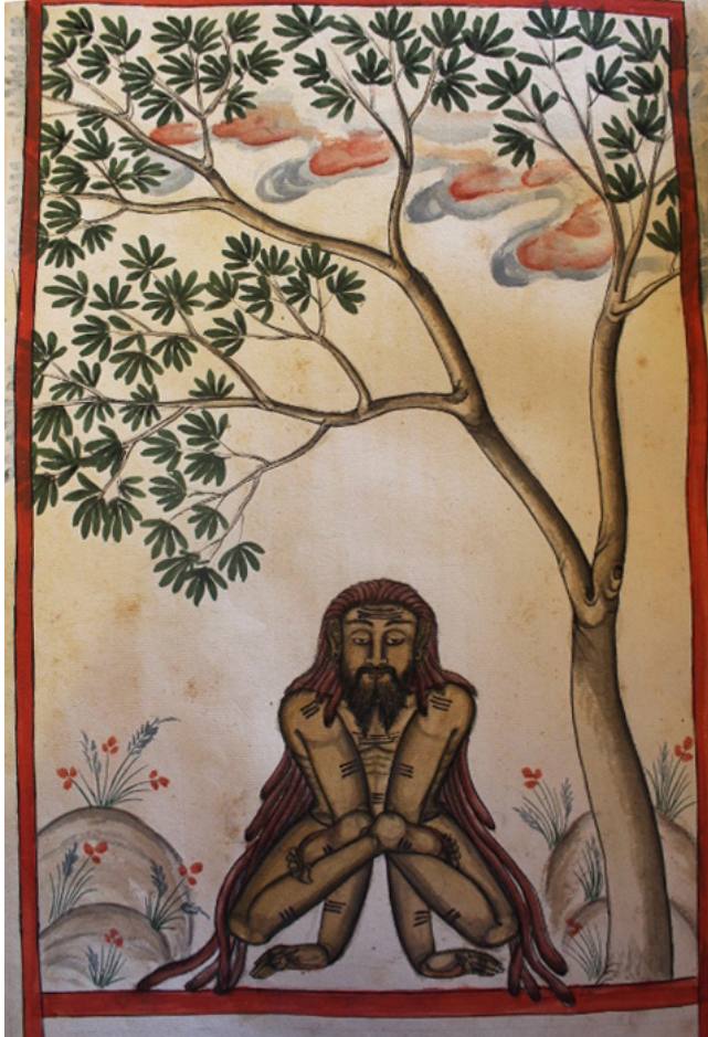
Figure 26 Venice, Biblioteca Nazionale Marciana, Codex Ita VI 136 (=8300), Libro Nero , c. 116v. Anonymous Indian artist for Nicolò Manucci. Watercolour on paper, 1700-10 ca., 415 × 250 cm

Hindu motifs, did not idealise the subjects, but portrayed them faithfully, through empiric observation (Mallinson 2013). The same perspective may be found in [figs. 26-27].