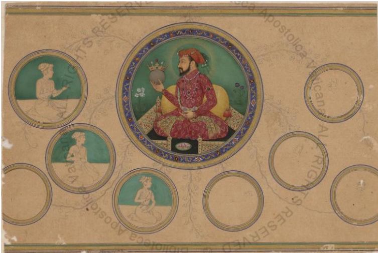
Figure 12 Rome, Vatican Library, Cod. Barberini Orientale nr. 136, f. 10. Anonymous 17th-century Indian artist, Genealogy of the Emperor Shah Jahan . Incomplete drawing, miniature on a gouache technique on paper