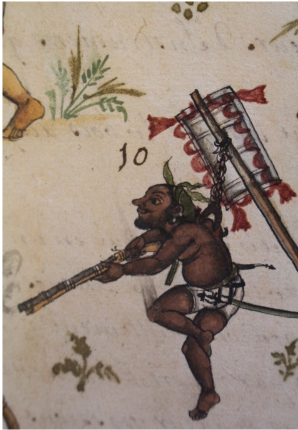
Figure 33 Venice, Biblioteca Nazionale Marciana, Codex Ita VI 136 (=8300), Libro Nero , cc. 38v-39r. A detail of the same image showing an Hindu penitent involved in the practise of hook-swinging where the ascetic is attached through his body with hooks to a high pole rotating 360° upon itself

son has observed, the illustrations representing customs, costumes and traditions had a wide circulation (Wilson 2005, 71). In this way, Europeans could get to know an entire world through pictures, and the books of customs expressed just this fascination for geographical classification and its spread (71). If we observe European art, we can find an example similar to Manucci's (although its patronage is of a completely different social level), more than one century before: the work of Nicolas de Nicolay. As the Royal Geographer of France, de Nicolay ordered sixty life-drawn portraits of men and women of different ethnic groups (De Nicolay 1568). In the works of both Manucci and De Nicolay, each category is rendered by precise illustra-