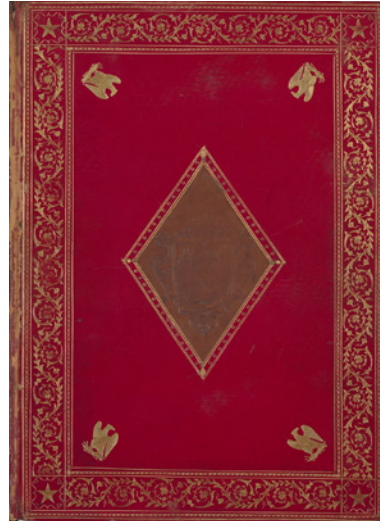
Figure 5 Paris, Bibliothèque Nationale de France, Cod. OD 45 Rés. Red cover of the Libro Rosso by Manucci and his artists. In the centre of the cover the Lion of Saint Mark can be seen. It is circled by four gilded eagles, i.e. the symbol of Napoleon Empire. These were executed after the illustrated book was taken from the Saint Mark Library in 1797 by Brumet, Napoleon's High Commissioner for Venice

has cleverly argued, this was, however, the result of the extraordinary cosmopolitanism of the region, which was composed, ethnologically and culturally speaking, not only of Muslim Indians and Hindus, but also of wide and powerful communities of Turks, Persians, Arabs and Africans, settled in the courts together with merchants, holy sufis, and generals – all generous patrons, who financed painters and calligraphers (Zebrowski 1983, 9). In those courts the milieu was certainly multicultural, undoubtedly characterised by a Shiite predominance, whereas the other ethnicities and cultures fed on the dialogue between Hindus and Sunnis and Africans and Afghans, and the central power developed a strong Iranian influence thanks to the good relations with the Persian Safavid empire (Zebrowski 1983, 9). Therefore, the Deccan became, at least until the 1687 Mughal conquest, a huge patronage centre, crucial for the developing of court arts, where miniatures and calligraphy had great importance in relation to power (Zebrowski 1983, 9).