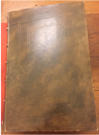
Figure 15 Venice, Biblioteca Nazionale Marciana, Codex Ita VI 136 (=8300), Libro Nero . The dark leather cover of the Manuscript explains its Italian name, Libro Nero , meaning 'Black Book'

author's embarrassing deprecative opinions, the work is, in its complexity, a pioneering figurative treaty of Indian ethnography. Moreover, it is significant for its still valid and accurate representations, which can be confirmed today by reflections of the practices he records in the complex mosaic of present-day Indian society. It is something of a tour de force in the figurative culture of southern India, and in particular of the coastal region between Karnataka, Andhra Pradesh, and Tamil Nadu.