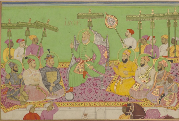
Figure 8 Paris, Bibliothèque Nationale de France, OD 45 Rés, Cabinet des Estampes ( Libro Rosso ), f. 38. Anonymous 17th-century Indian artist, The Household of Bijapur . Watercolour on paper, 1680 ca.

and literary culture of Persian influence (Zebrowski 1983, 60). The word “ISOF” is visible, which connects this picture to Yusuf in Manucci’s miniature.