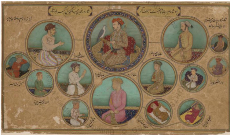
Figure 11 Rome, Vatican Library, Cod. Barberini Orientale nr. 136, f. 11. Anonymous 17th-century Indian artist, Genealogy of the Emperor Jahangir . Miniature on a gouache technique on paper