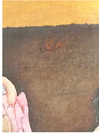
Figure 10 New York, MET, Kamal Muhammad and Chand Muhammad. The House of Bijapur . Ink, opaque watercolour, gold and silver on paper, 1680 ca. 41,3 × 32,5 cm. Detail from the same image showing a European vessel, probably Portuguese or Dutch