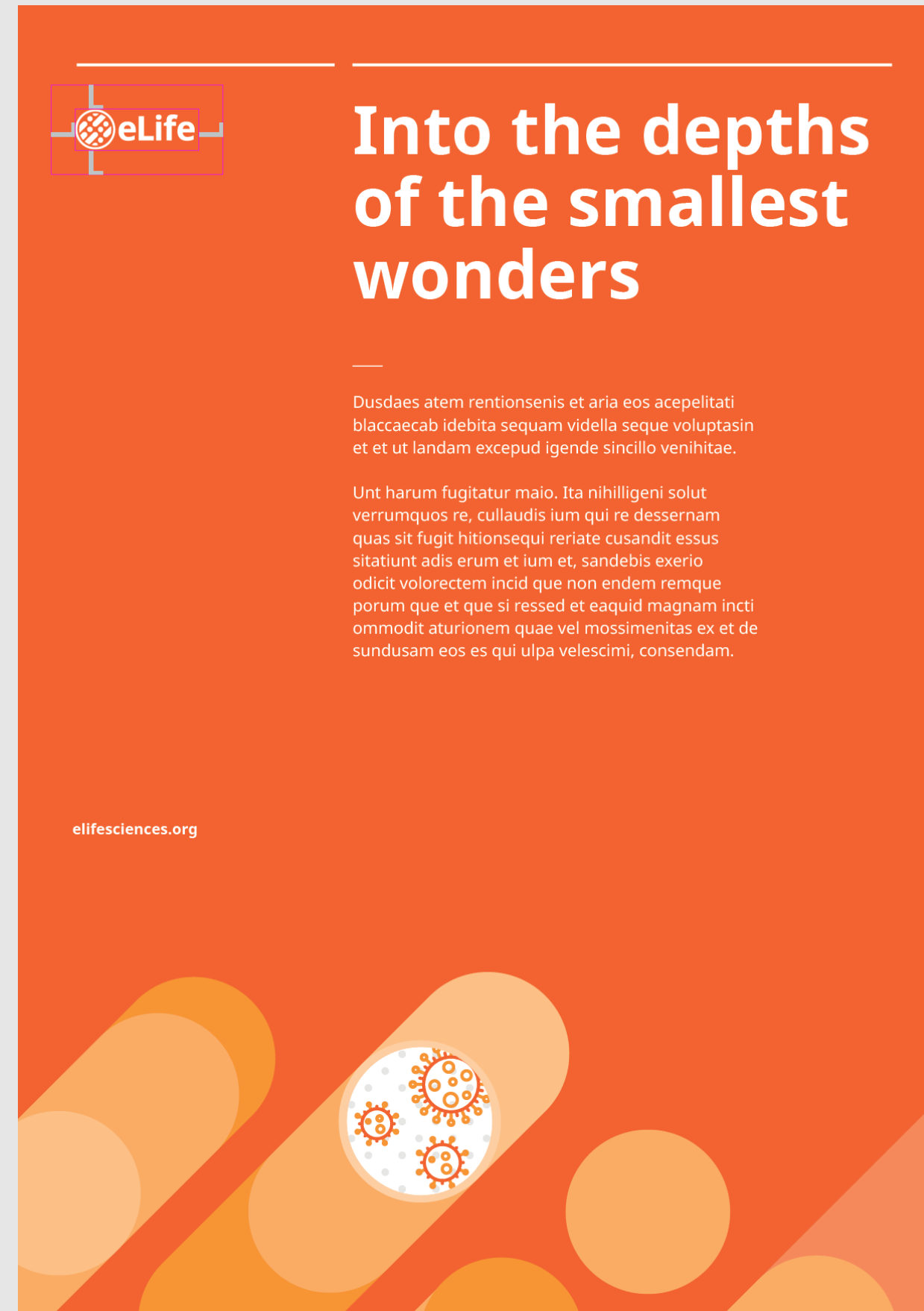
Top left aligned logo