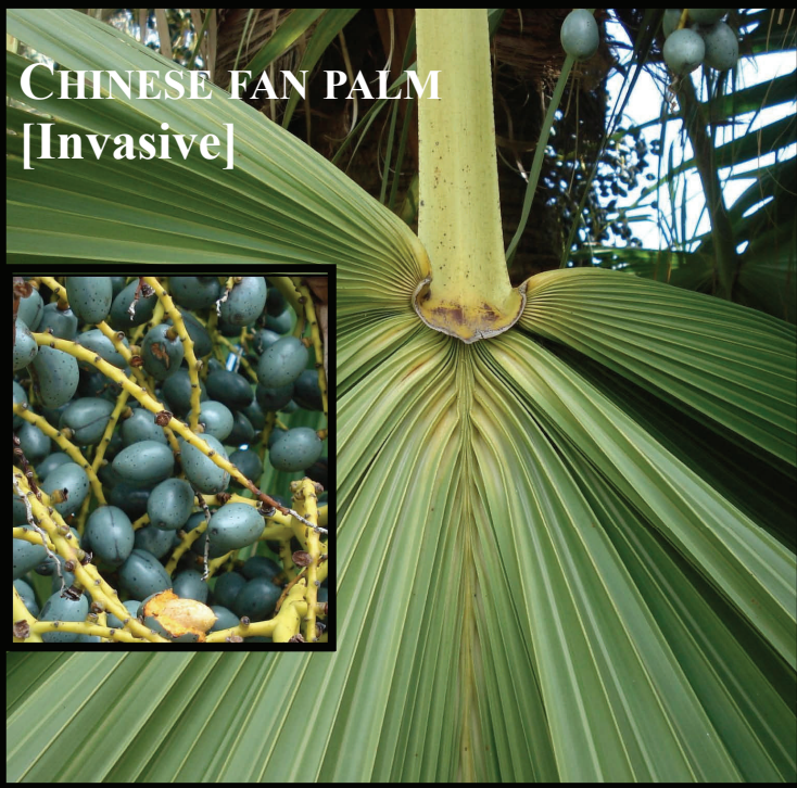
CHINESE FAN PALM [Invasive]