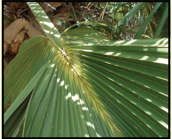
CHINESE FAN PALM