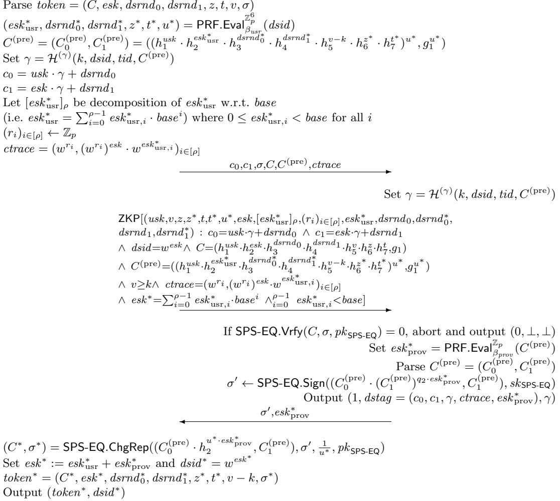
Alg. 4. Spending protocol