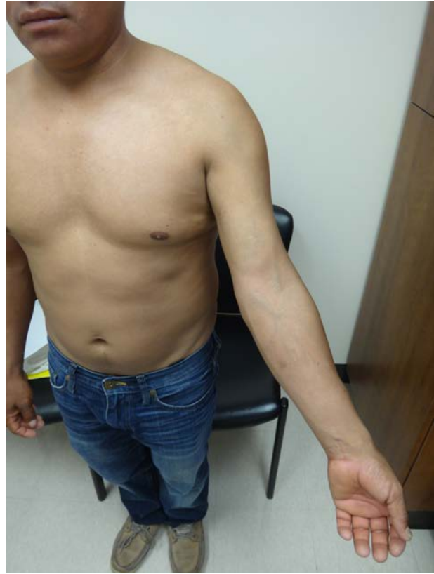
Figure 3. Multiple hypopigmented , 1-3mm macules and papules coalescing into patches and plaques on the left chest. Figure 4. Multiple hypopigmented , 1-3mm macules and papules coalescing into patches and plaques on the left chest, upper arm and forearm.