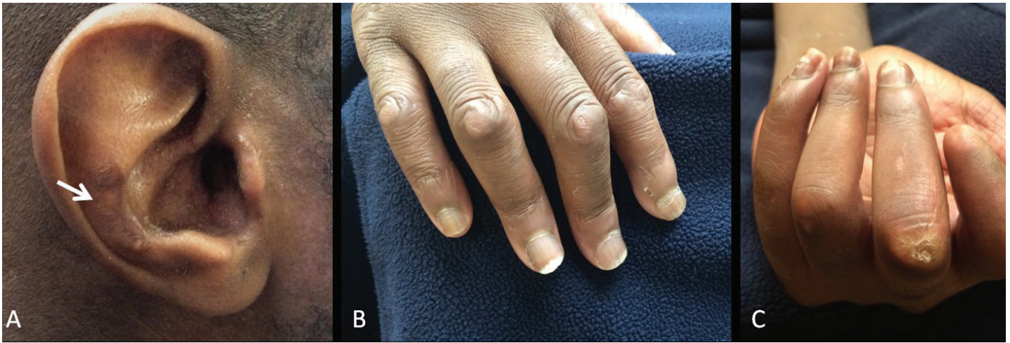
Figure 2. New onset discoid lupus erythematosus lesions (A, arrow) and sclerodactyly in the patient's right (B) and left hand (C) evidenced by narrow tapering, shiny distal skin, associated skin atrophy, and joint contractures.

and discoid lupus lesions with +ANA, +anti-dsDNA antibody, +anti-Smith antibody, +anti-Ro antibody, +anti-RNP antibody, and +lupus anticoagulant antibody (meets ACR criteria for systemic lupus diagnosis [8]) and 2) possible scleroderma overlap as evidenced by sclerodactyly with finger-tip ulcerations. Despite negative anti-Scl-70 antibody and anti-RNA polymerase antibody, the patient meets 2013 ACR/EULAR criteria for scleroderma diagnosis with clinical symptoms (sclerodactyly, Raynaud phenomenon, finger-tip ulcerations) alone [9].