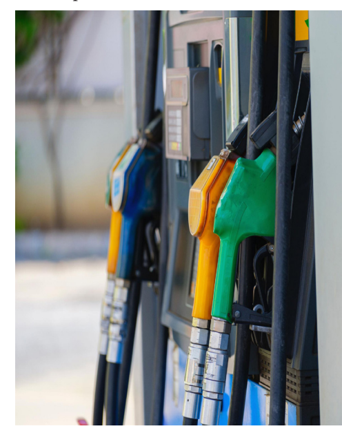
Figure 3: Row of gasoline pumps ready to be used to fuel vehicles

At UC Berkeley, biodiesel production is being used by the Biofuels Technology Club to provide a unique learning opportunity for students and researchers. This collaborative effort promotes sustainable practices beyond the campus boundaries.