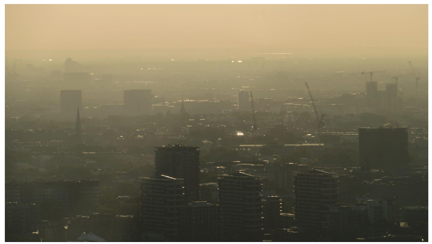
Figure 1: London barely visible through the hazy smog filled air.

These innovations represent a multifaceted approach aimed at achieving a balance between biofuel production and environmental sustainability, thereby paving the way for a greener and more responsible energy future.