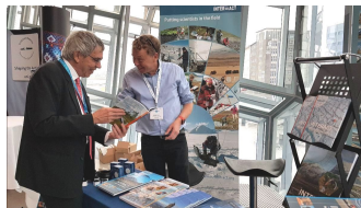
INTERACT at Arctic Circle in Iceland