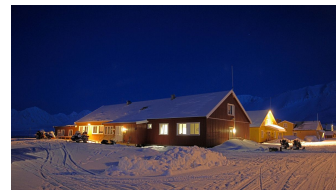
TA call open until 30th November