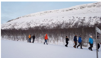
Annual Meeting in Kilpisjärvi