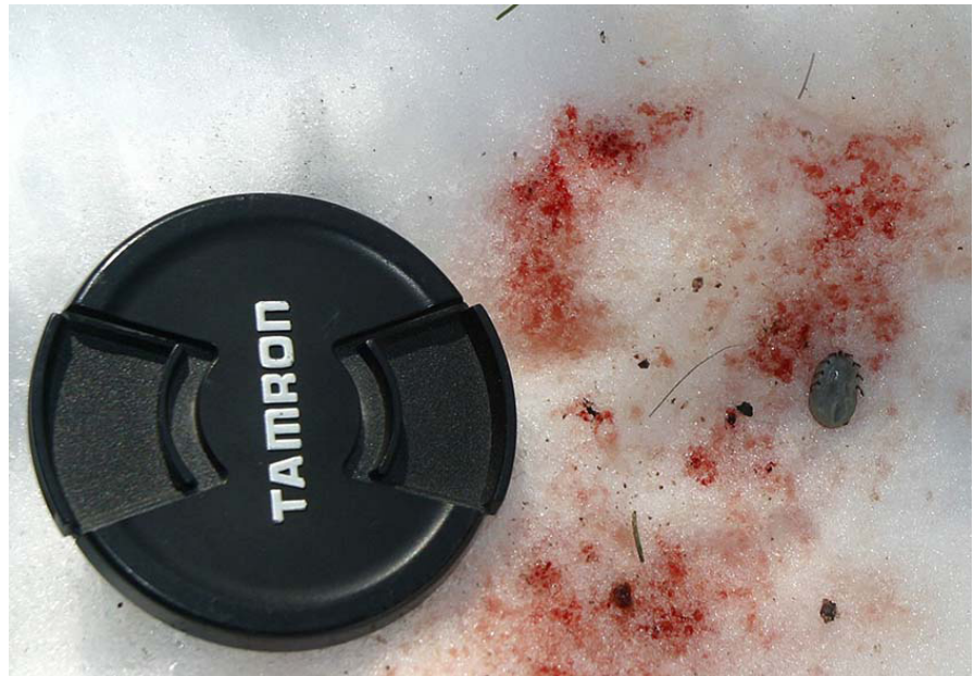
Engorged female in snow, moose bed.

Winter ticks will bite domestic animals and people if given the opportunity. Several New Hampshire deer hunters have sent UNH specimens found on their clothing. One had more than 50 larvae on his glove. Horse owners have also submitted specimens of ticks biting their animals in late fall or winter.