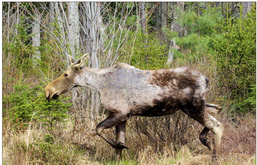
Walking moose with heavy hair loss.

In late winter and early spring, heavily infested moose rub against trees and groom the heavily infested spots with teeth and hooves. This damages the protective coat of hair, and hair loss follows a predictable pattern, starting around the shoulders. With many guard hairs broken off, the animal's coat appears light gray or tan, instead of dark brownish black. The photo at below shows such an example in May, from northern New Hampshire.