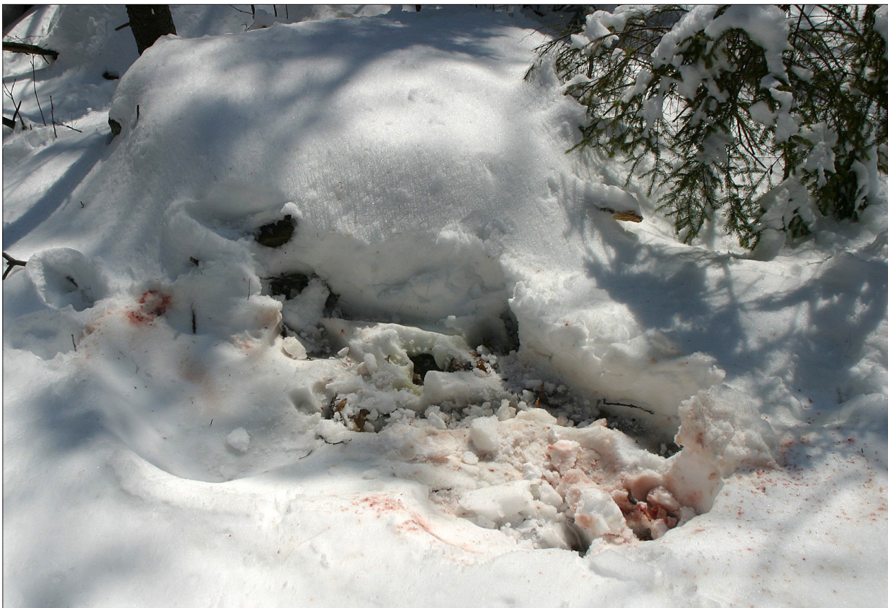
Moose bed in snow, showing blood.

In areas of high moose density, in bad winter tick years, blood and/or ticks can be found in moose trails and moose beds in the snow in late March and April (photo, below). When conditions are right for a tick outbreak, large die-offs of moose can occur. The most recent year with significant New Hampshire moose deaths from ticks was 2002. There were die-offs in Maine, Vermont, and parts of Canada at that time.