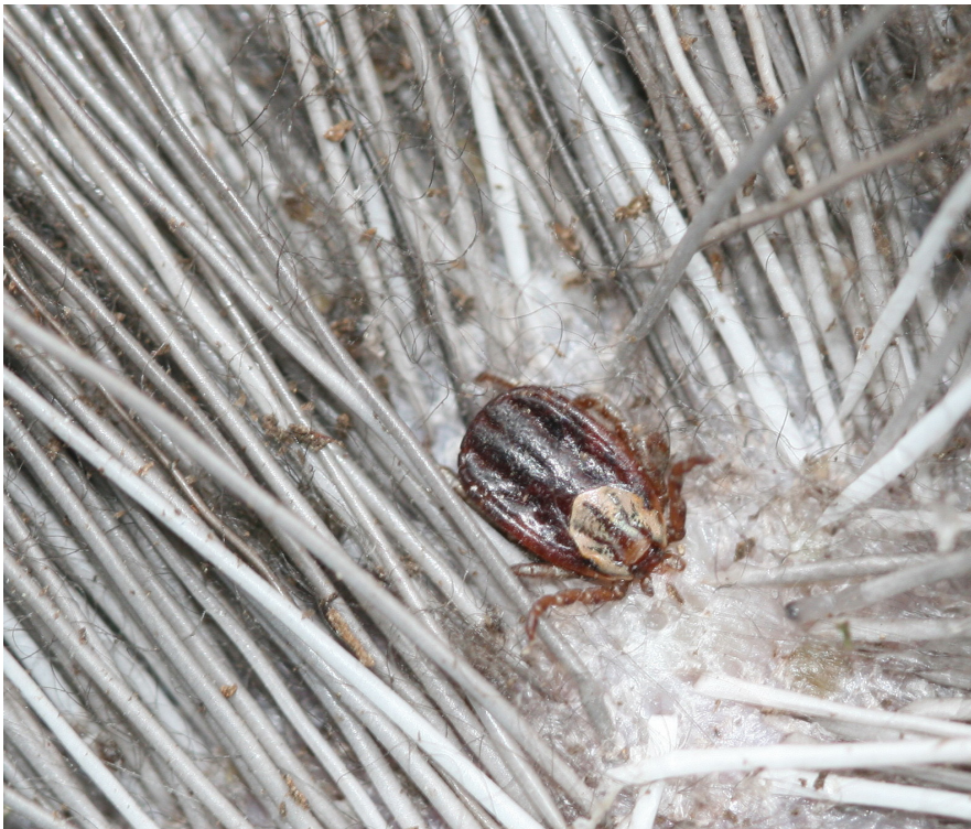
Adult female (not yet engorged) on a moose.

The average questing height for winter tick is average chest height for moose or deer. Animals that are active groomers such as white-tailed deer remove ticks early with teeth and/or hooves. Moose start grooming in response to irritation very late in the tick-infestation phase. That means they begin when the blood loss (and presumably the irritation) is getting significant.