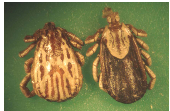
Adult winter ticks.