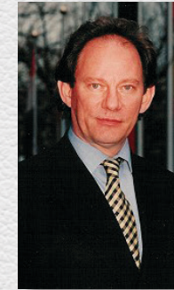
Edward McMillan-Scott Vice President of European Parliament

I am absolutely convinced that over a long period from 1999 onwards organ harvesting from prisoners of conscience has been taking place, especially of Falun Gong, but also Uyghurs and Tibetans, and more proof is now coming out about this.