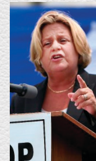
Ileana Ros-Lehtinen U.S. Congresswoman

I am convinced that there is so much evidence now, it must be true. If it is true, it is a terrible international human rights crime that the Chinese government is committing. In other countries, that would be regarded a crime against humanity.