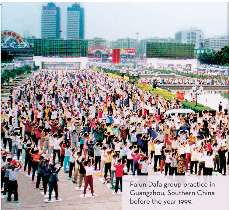
Falun Dafa group practice in Guangzhou, Southern China before the year 1999.