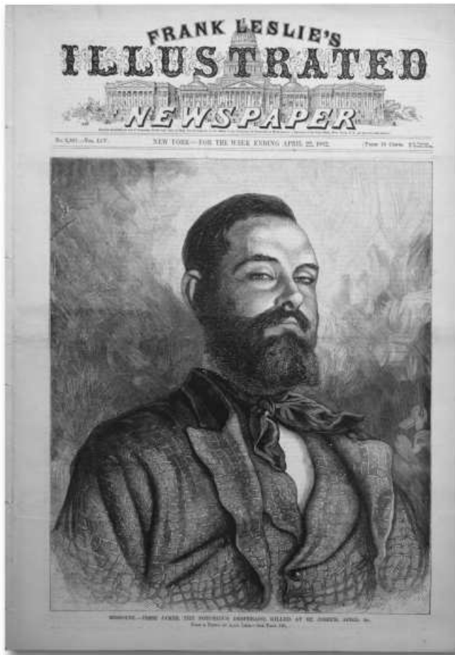
See item 699928 on page 20.

This was during the Democratic Convention, where Bill Clinton would ultimately be the candidate for the general election. Sixty pages, tabloid-size, great condition. $35