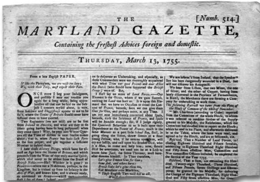
See item 694150 on page 2.

At the time he preached this sermon, Bishop John Sharp was the Archbishop of York. He would later replace Lord Tenison as the confidential advisor to Queen Anne. Note: the year printed as "1691/2" would be 1692 by the current Gregorian calendar, 1691 by the older Julian calendar, both of which were in use for a period of years. $115