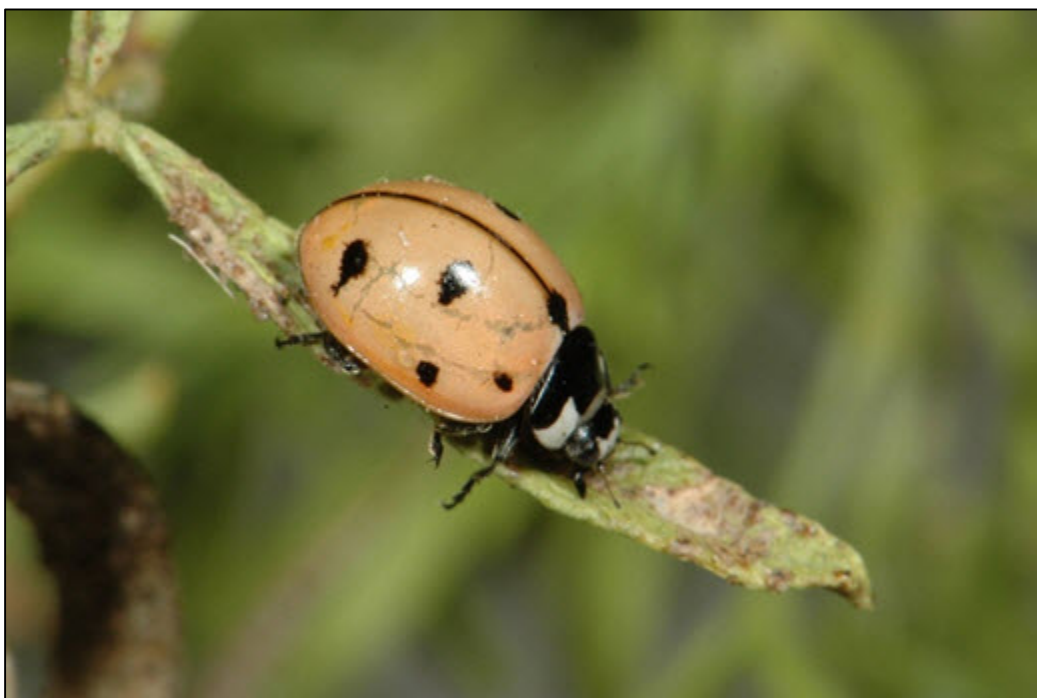
Figure 1. Adult Nine-spotted Lady Beetle

Eggs are elongate, approximately one mm in length, yellow to orange in colour, and laid in tightly packed clusters (Hodek et al. 2012). The larvae are black with periodic orange/red markings at the sides and dorsal segments (terga), have mound-like projections bearing seta, or hair-like structures (Rees et al. 1994). The pupae are usually yellow to orange with black markings (Hodek et al. 2012).