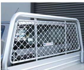
62mm headboard pipe