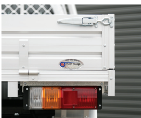
Anodised drop sides