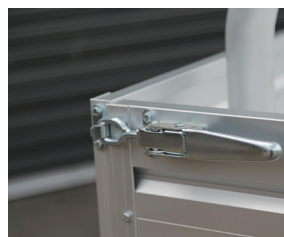
Adjustable anti-rattle over-centre latches