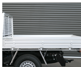
Full length tie rails