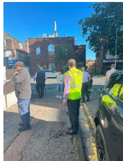
FNC Centre Volunteering & Supporting Local Clinic - Flu Vaccine Sep - Oct 2023