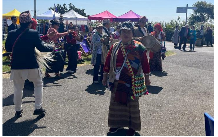
Community participating in Folkestone Multicultural Festival - 03 June 2023