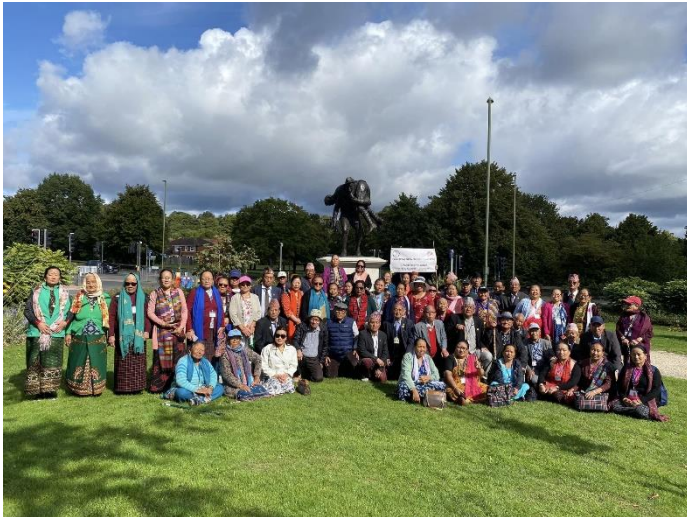
Beneficiaries visiting VC Statues -27 August 2023