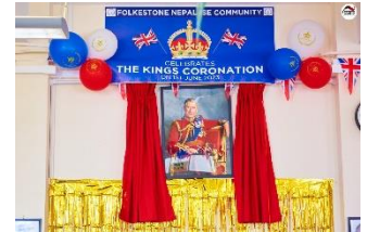
Unveiling the Portrait of the HM King Charles II at the Centre - 01 June 2023