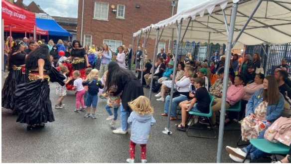
Multicultural Festival at the Centre - 09 July 2023