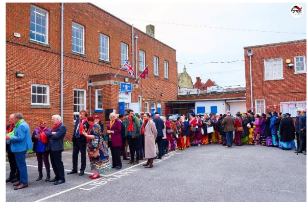
Unveiling the Portrait of the HM King Charles II at the Centre - 01 June 2023