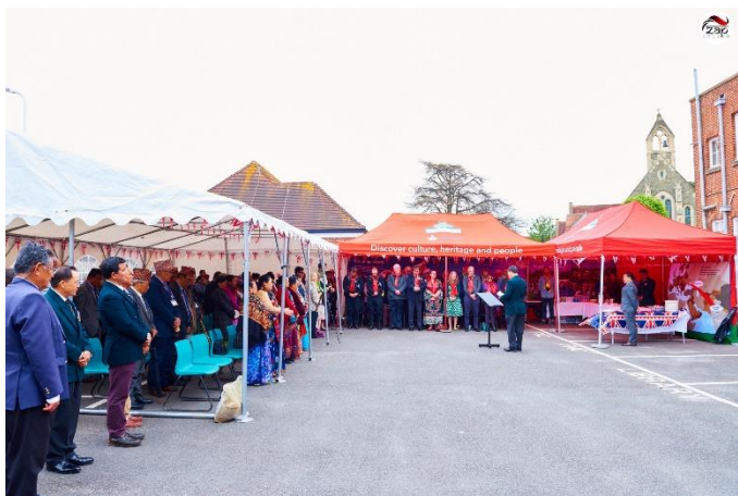
Unveiling the Portrait of the HM King Charles II at the Centre - 01 June 2023