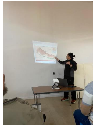
Talking about the Gurkha Veterans to other organisations May – Sep 2023.