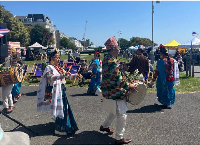
Community participating in Folkestone Multicultural Festival - 03 June 2023