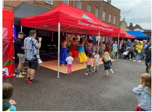
Multicultural Festival at the centre – 09 July 2023