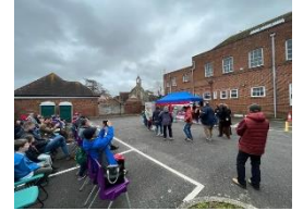
Nepalese Holi Festival at the Centre 12 March 2023