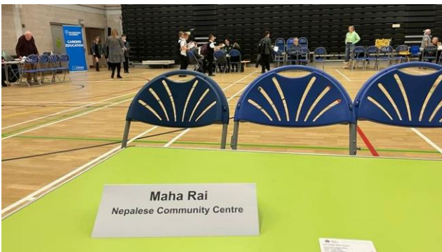
Visiting Schools to talk about the Nepalese/Gurkha Veteran Community in Folkestone & UK – June to July 2023