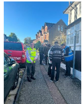
FNC Centre Volunteering & Supporting Local Clinic - Flu Vaccine Sep - Oct 2023