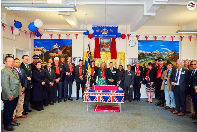
Unveiling the Portrait of the HM King Charles II at the Centre - 01 June 2023