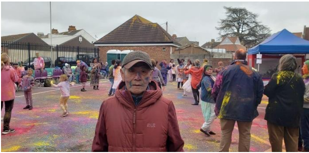
Nepalese Holi Festival at the Centre - 12 March 2023