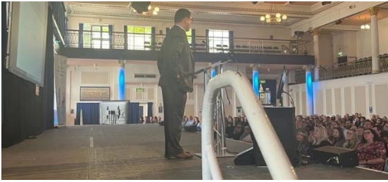
Presenting work of the Centre at the NHS Kent and Medway Event, Leas Cliff Hall – 10 May 2023