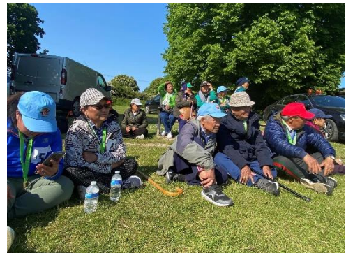
Beneficiaries participating 5 KM Charity Walk - 04 June 2023