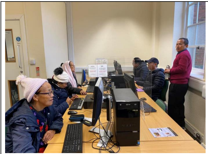
DIGITAL CLASS 1