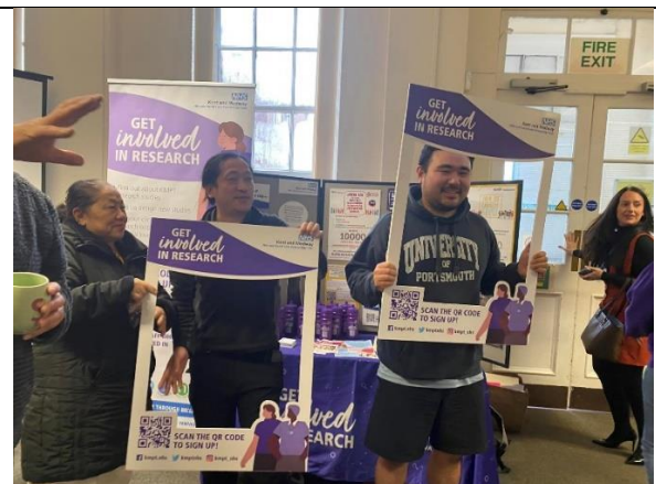
KENT AND MEDWAY NHS SOCIAL CARE PARTNERSHIP TRUST (KMPT) – MENTAL CARE PROVISION AND RESEARCH, 22/02/2024