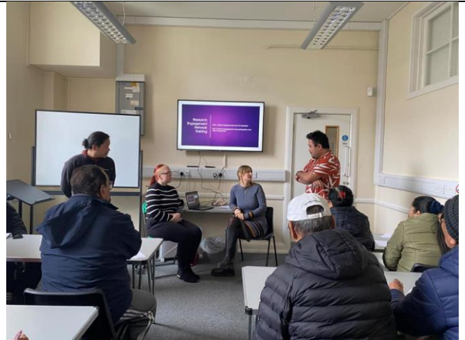
KENT AND MEDWAY NHS SOCIAL CARE PARTNERSHIP TRUST (KMPT) – MENTAL CARE PROVISION AND RESEARCH, 25/01/2024