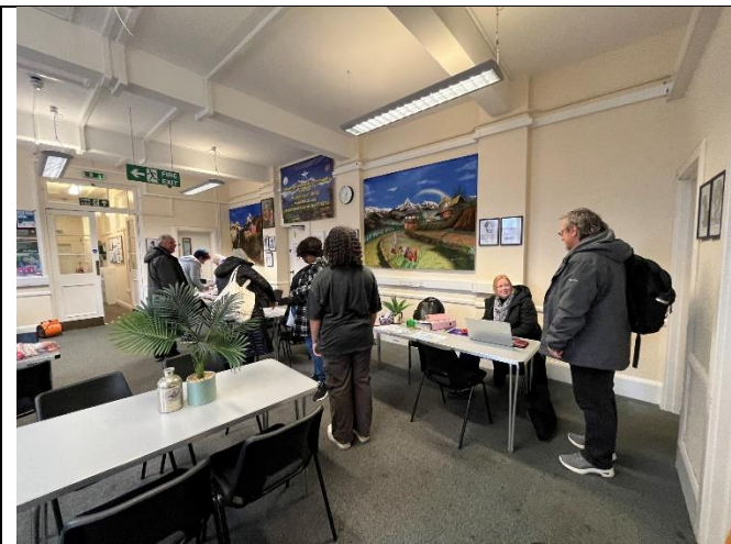
FOLKESTONE REPAIRS TOGETHER, 28/01/2024