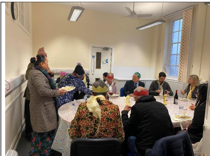
CHRISTMAS DINNER WITH TOWN MAYOR, DEC 2023