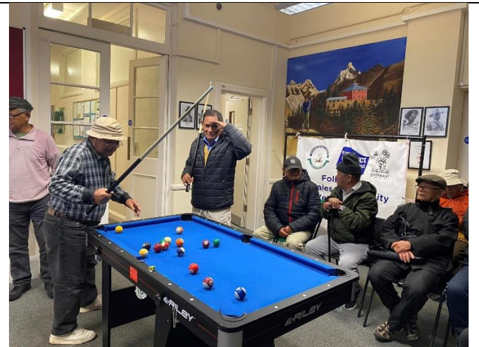
VETERANS DROP IN