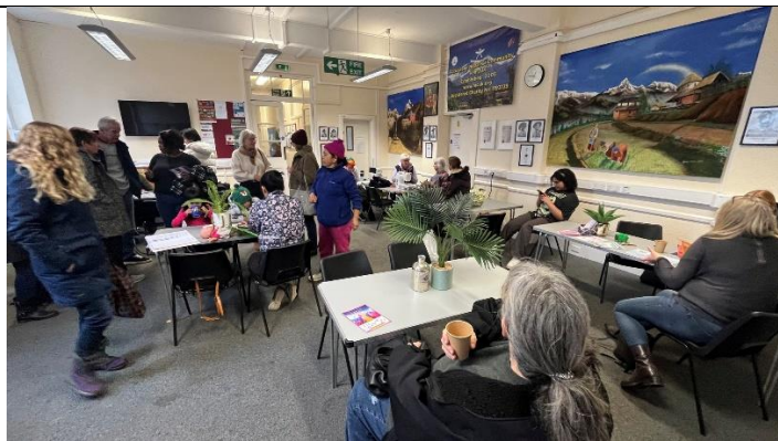
FOLKESTONE REPAIRS TOGETHER, 28/01/2024