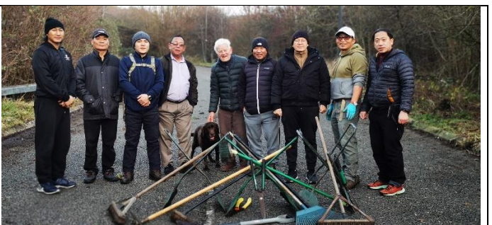
CASTLE HILL CLEANING, 08/01/2024