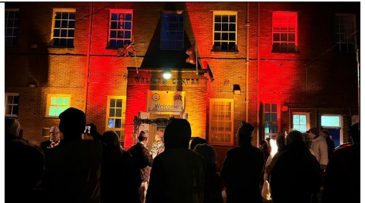
FOLKESTONE LIVING ADVENT CALENDAR, 23/12/2023