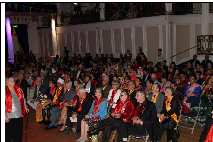
FOLKESTONE NEPALESE COMMUNITY CENTRE DASHAIN TIHAR FESTIVAL CELEBRATION, 15/10/2023