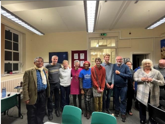
CHERITON QUIZ NIGHT, 11/11/2023