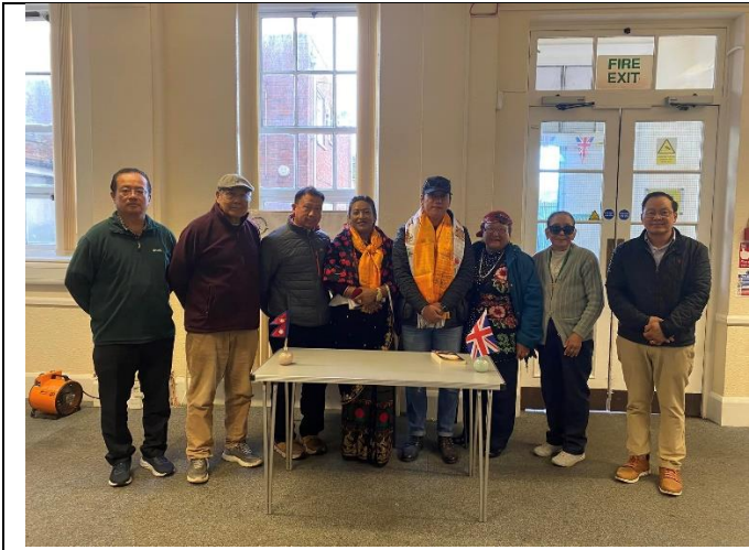
NEPALI ARTIST VISIT