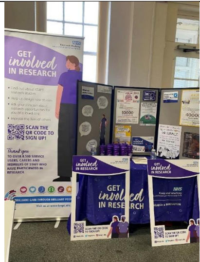
KENT AND MEDWAY NHS SOCIAL CARE PARTNERSHIP TRUST (KMPT) – MENTAL CARE PROVISION AND RESEARCH, 22/02/2024