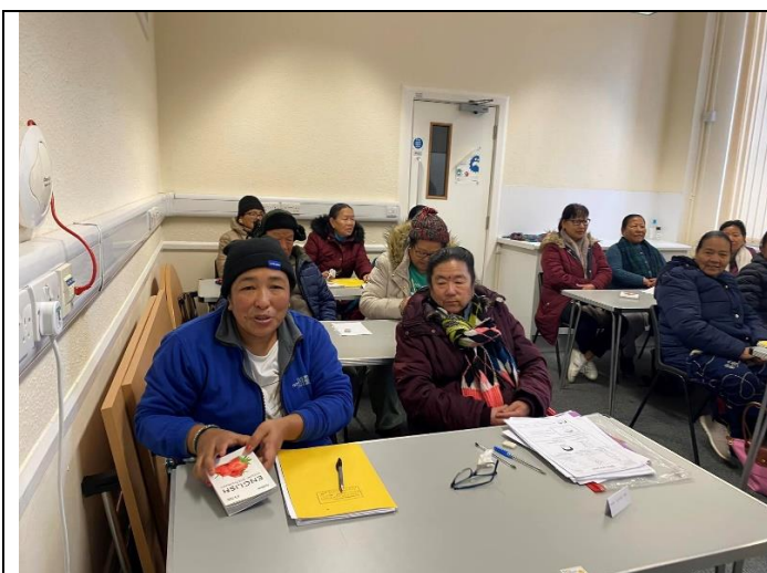
ESOL CLASS 2