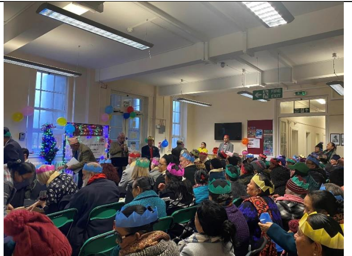
CHRISTMAS DINNER WITH TOWN MAYOR