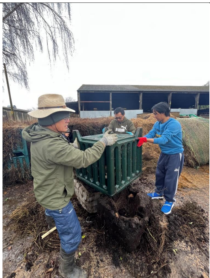
PENT FARM COMMUNITY FARM PROJECT