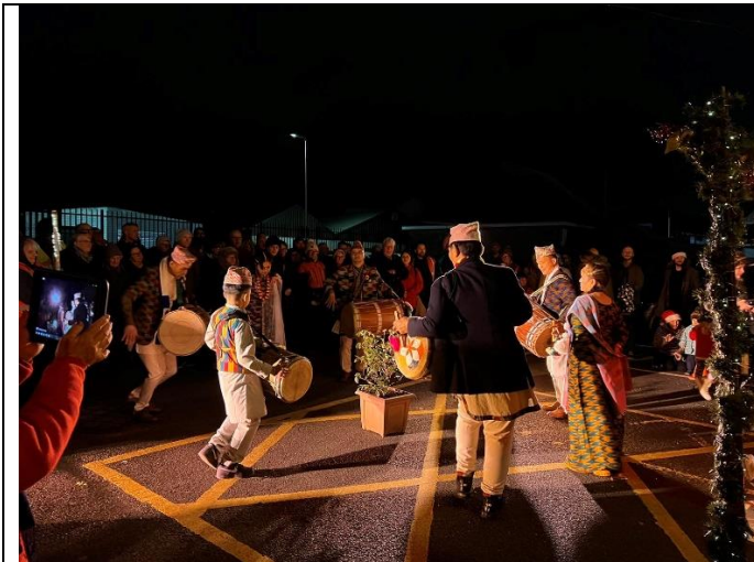
FOLKESTONE LIVING ADVENT CALENDAR, 23/12/2023