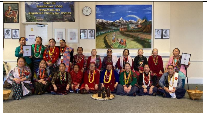
PORTRAIT OF NEPALESE INDIGENOUS GROUPS, 02/2024