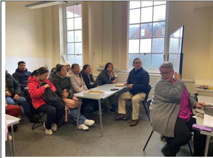
PRO FORCE RECRUITMENT WORKSHOP 2, 02/2024