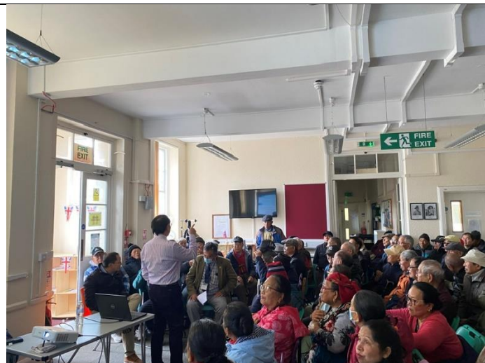
GURKHA WELFARE TRUST PRESENTATION, 19/10/2023