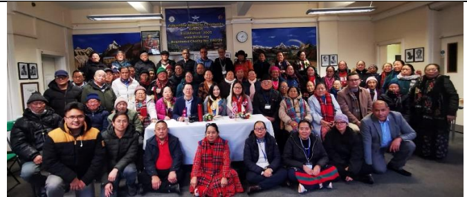
SAPANA ROKA MAGAR (BBC 100 WOMEN 2020), INTERACTION PROGRAM, 25/01/2024