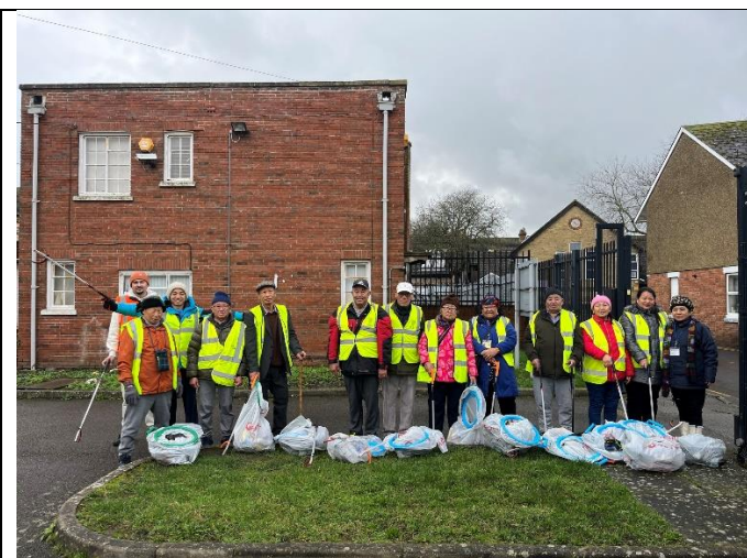
COMMUNITY CLEANING, 07/01/2024