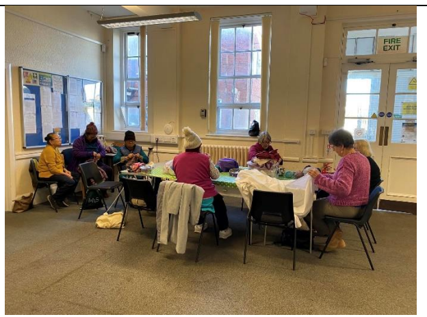
STITCH AND CHAT