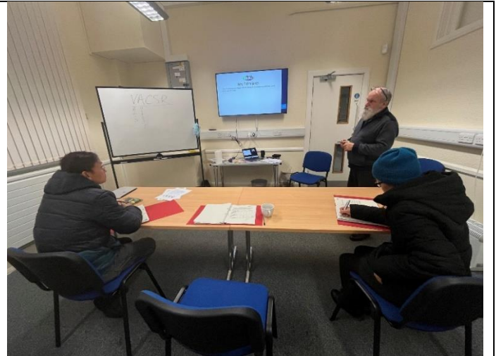
NCFE LEVEL 4 AWARD IN EDUCATION AND TRAINING