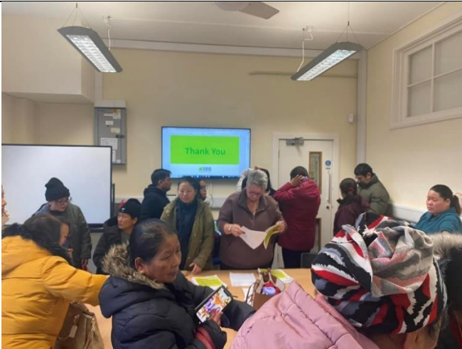
PRO FORCE RECRUITMENT WORKSHOP 1, 02/01/2024