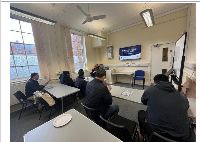
SGN SAFE AND WARM COMMUNITIES SCHEME, 01/03/2024