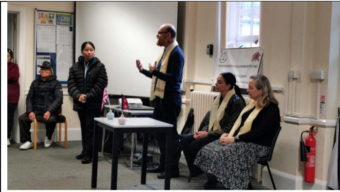
KENT COUNTY COUNCIL SOCIAL CARE ENGAGEMENT, 16/11/2023