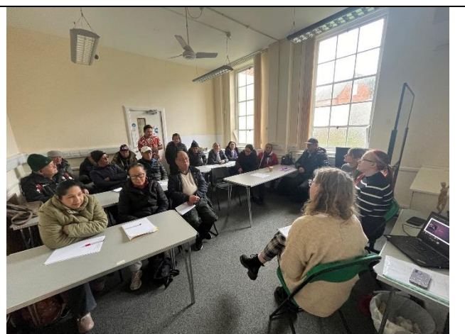
SEK & KENT COUNTY COUNCIL, TAKING PART IN RESEARCH, 13/02/2024