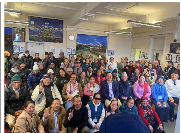
NEPALI ARTIST VISIT