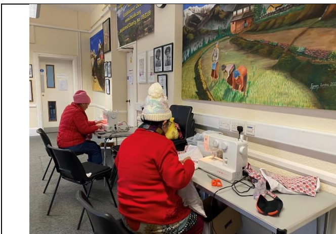
STITCH AND CHAT