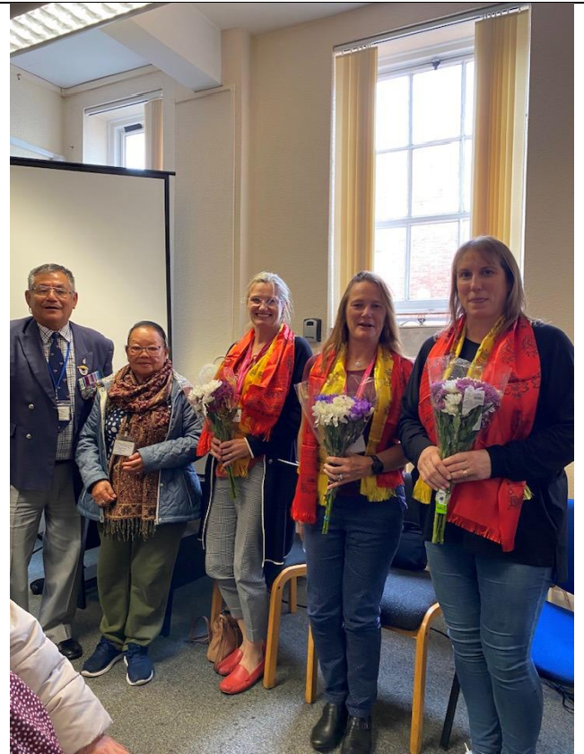
NATIONAL LOTTERY FUNDERS MEETING, 05/11/2022