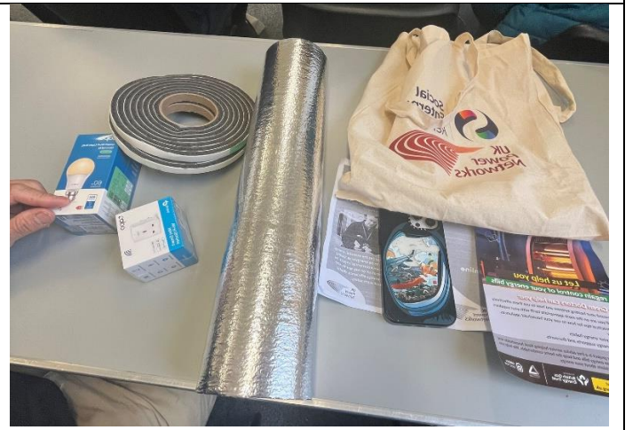
SGN SAFE WARM COMMUNITIES SCHEME, 01/03/2024