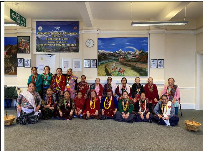
PORTRAIT OF NEPALESE INDIGENOUS GROUPS, 02/2024