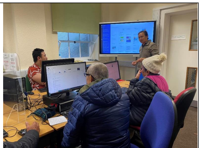
DIGITAL CLASS 2