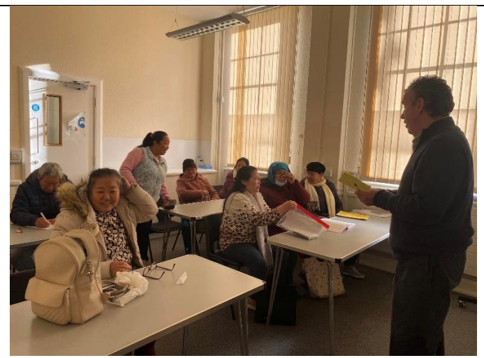
ESOL CLASS 1