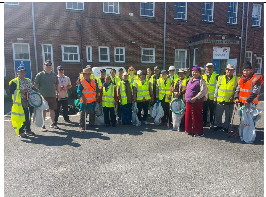
F&HDC Council &FNC Litter Pick