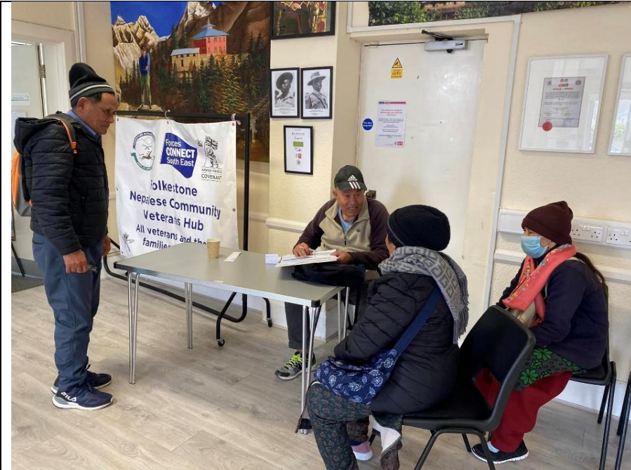
VETERANS DROP IN