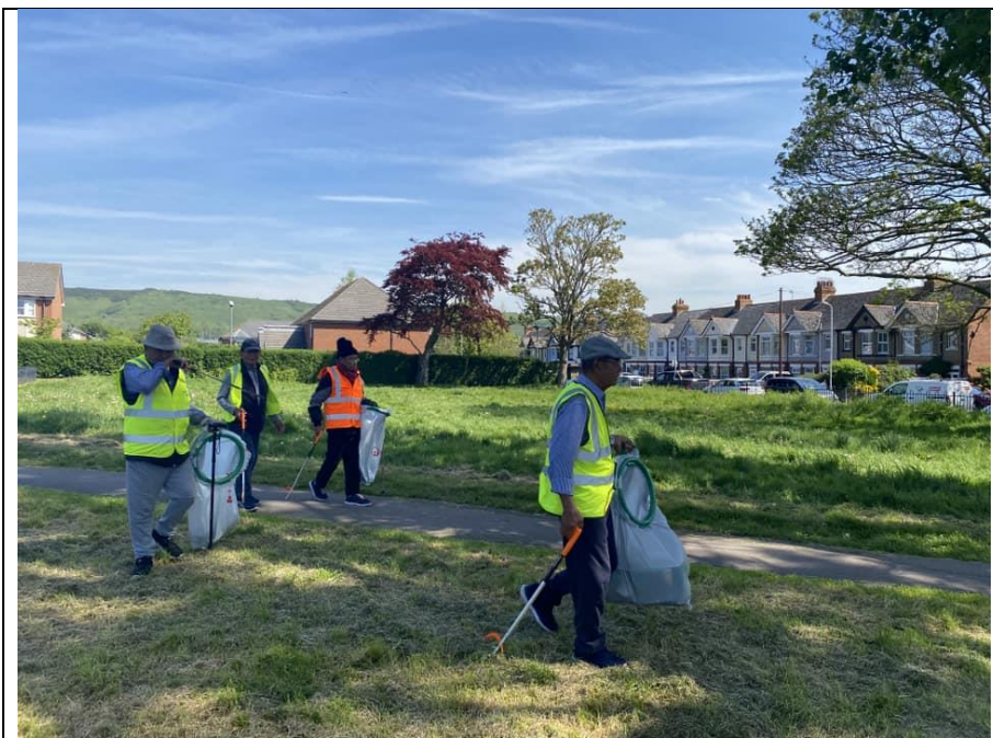
F&HDC Council &FNC Litter Pick