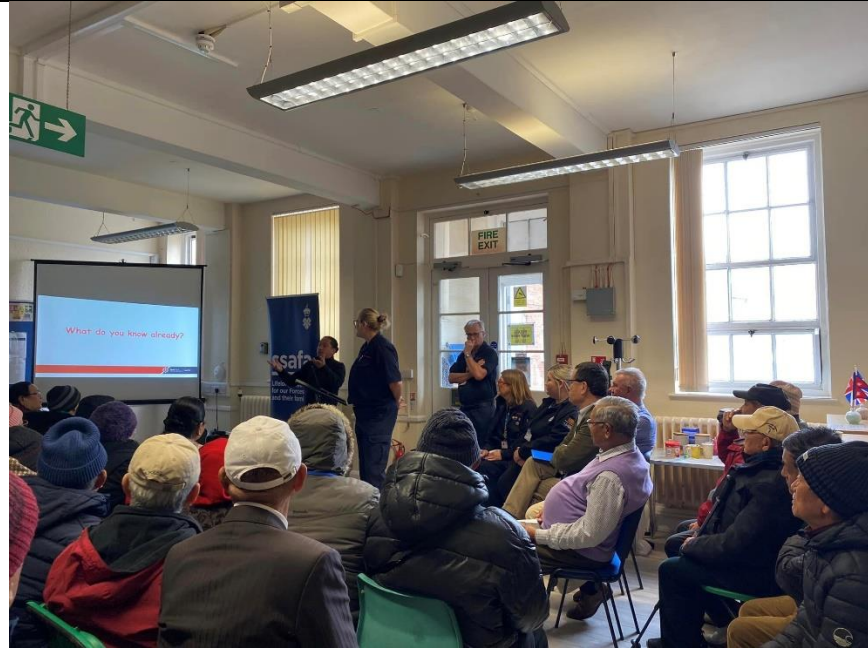
KENT FIRE AND RESCUE SERVICE