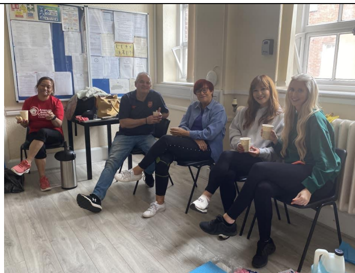
ARAMARK CLEANING FNC CENTRE