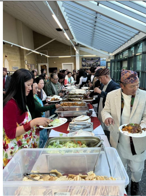
Nepalese New Year