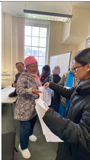
HEALTHY EATING WORKSHOP