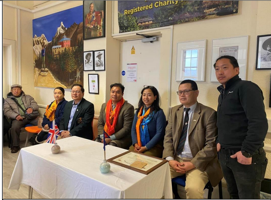
Visual Art Exhibition: Gurkha Women, Shrish Creative Arts Initiative