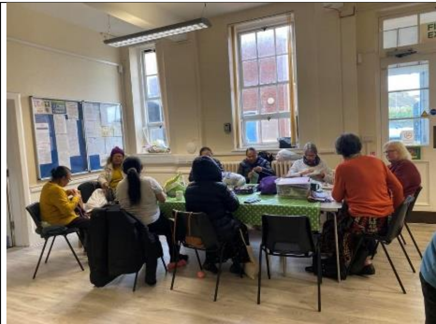
STITCH AND CHAT