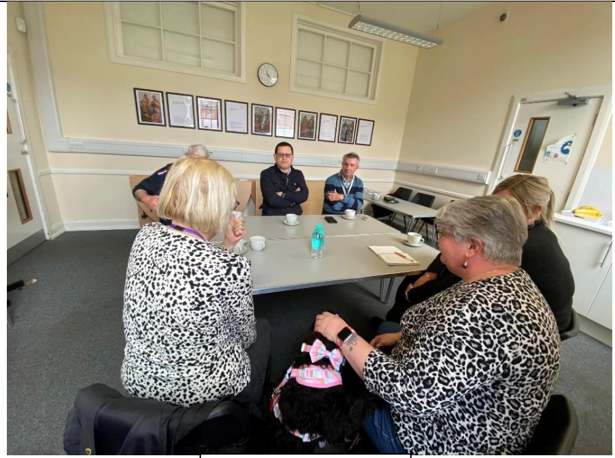
VETERANS DROP IN