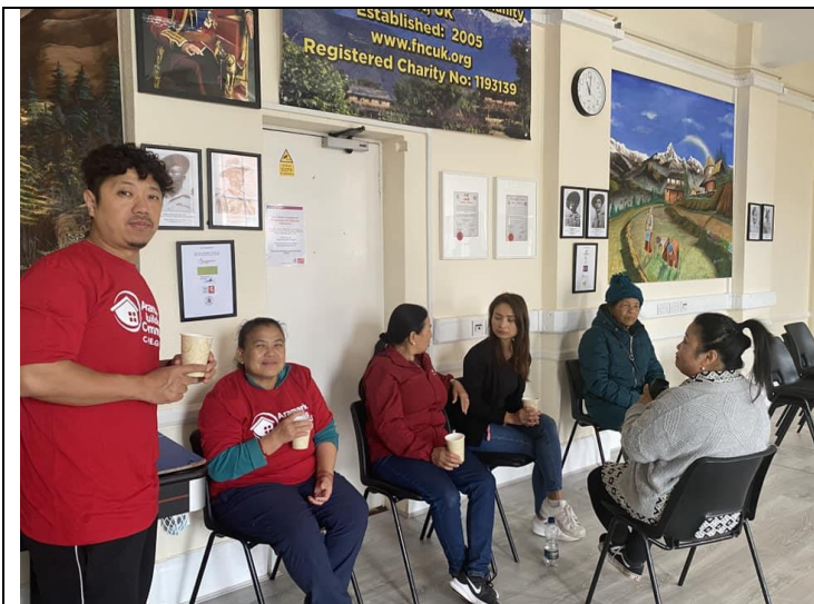
ARAMARK CLEANING FNC CENTRE