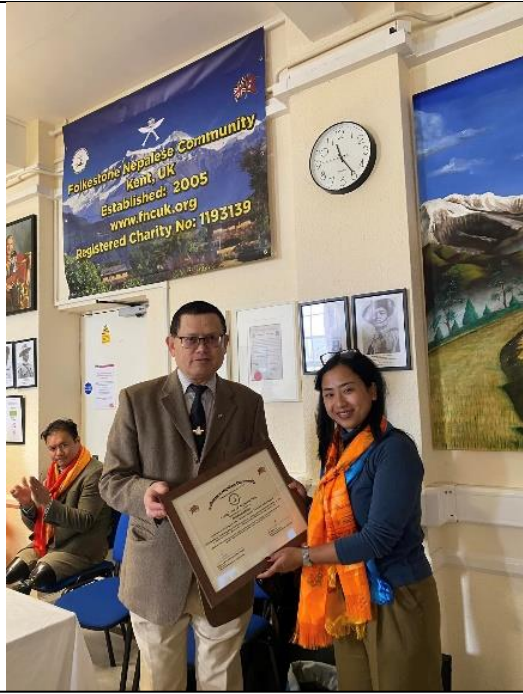
Visual Art Exhibition: Gurkha Women, Shrish Creative Arts Initiative