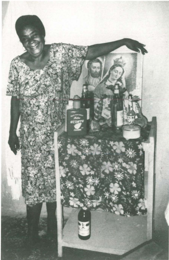
The Vodoun altar at Madame Nerva's bounfor in Jacmel, Haiti, incorporates chromolithographs of Catholic deities.

to the same metropole. The nature of the colonial enterprise was also different: as R.W. Thompson (1957:353) explains, "a more serious effort was made by the Spaniards and Portuguese to plant their New World territories with peasants of European stock. As a result, their subjects of African descent did not greatly overwhelm in numbers those who spoke a European language in conformity with native usage." However, ritual languages of African origin such as Lucumí were conserved in Cuba and elsewhere, and Spanish became imbued with intonations and variations, idioms and inflections, variations of pronunciation and style, as well as new local terms.