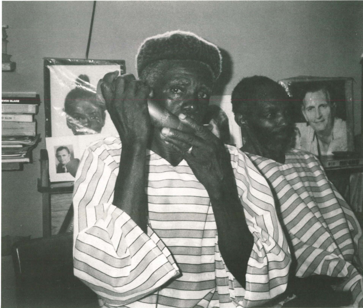
Maroon abeng player from Moore Town, Jamaica. This wind instrument was used during the 18th century war against the British and has retained sacred meaning to this day.

consensus even on its geographic definition; this controversy is not necessarily esoteric. The broadest prevailing geographic definition of the Caribbean is that given in the Atlas of the Caribbean Basin (1984), which defines the Caribbean to include “the islands of the Caribbean Sea as well as the countries on its shores.” This definition includes 30 countries and a total population of nearly 400 million people since it encompasses the United States, Mexico, the five Central American republics, Panama, Colombia, Venezuela, Belize, Guyana, Surinam and French Guiana. A narrower definition of the Caribbean includes only the 13 independent former British colonies of the West Indies, whose total population is slightly over 6 million. Between an overly broad Caribbean