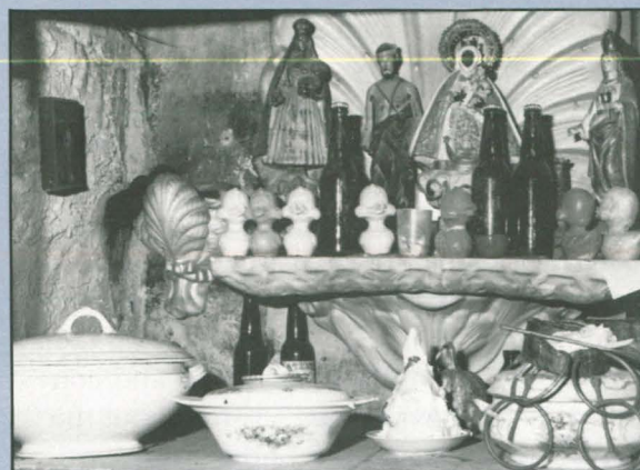
Domestic shrine for orichas and saints with offerings, Guanabacoa, Havana, Cuba, 1986. Saints' images traditionally stand above the porcelain soperas (tureens) containing the deities' "secrets."

The orichas are understood as so many refractions of a distant, incomprehensible Supreme Being or Creator. Each oricha is