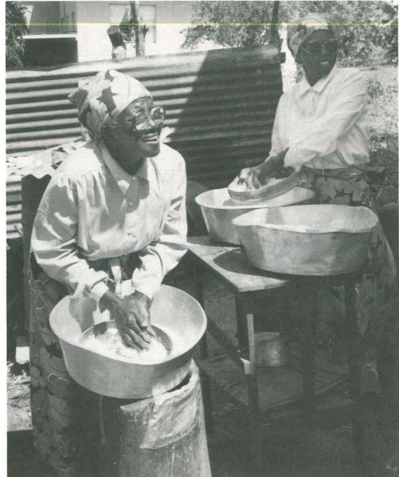
Sifting cassava flour for making bammies . Methods and utensils used in the processing and cooking of manioc or cassava derive from the indigenous Arawak people.

During the first centuries of the colonial period Europeans viewed musical forms of African origin as a form of social control and a way to maximize labor productivity. They attributed a functional meaning to such music, consistent with their own interests. African-based music sometimes gained legitimacy in its own right. And over time African-based music made its way into the sitting rooms of Europeans. Musical styles and dances from Europe were transformed and Africanized through the infusion of African elements in