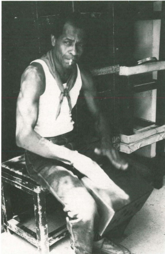
Playing the small rumba box or quinto , a drum-substitute which has been traditionalized as part of the Afro-Cuban percussive repertoire.

Church. The following portion of the litany Djo (prayer from Guinea) in Haitian creole, collected in Port-au-Prince, is important in showing how Roman Catholic and West African traditions come together in Vodoun: