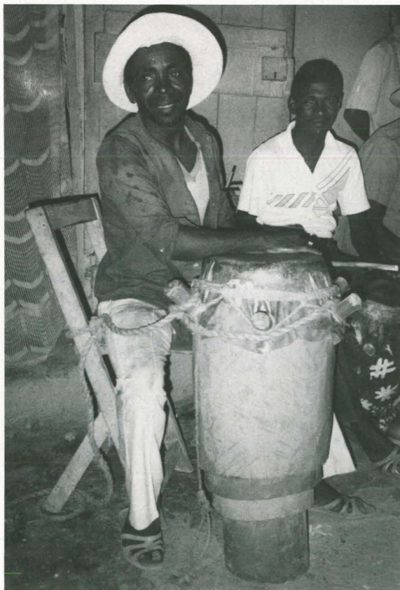
Master drummer of Madame Nerva's bounfor plays the manman or bountor drum, the largest of the ensemble, using one bare hand and one stick.