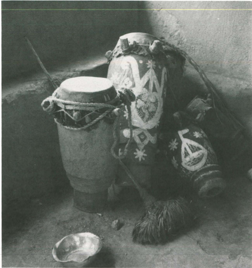
Arada or Vodoun drums with painted vèvès . Note the variety of artistic carvings in the base of these Dahomey-style drums.