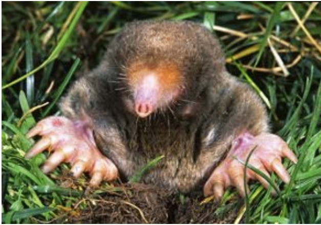
The eastern mole Scalopus aquaticus

Having two ears helps animals locate the source of a sound. Two forward-facing eyes give an animal depth perception. What about two nostrils (or antennae)—do animals smell in stereo too? Holey moley—smelling in stereo sure helps to find food underground!