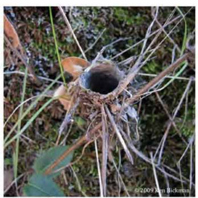
Turrets are built with silk and available materials. Outward radiating "spokes" may help the spider sense prey nearby.

Full-grown, turret spiders are only about 3/4inch long, and they generally hide in the ground in daytime. You may never see the spiders, but you can look for their tiny turrets! They're usually camouflaged by bits of plant debris, so the first thing your eyes might pick out are holes in the ground (up to half-inch or so in diameter). Keep looking to notice a collar or tube, made of soil and plant bits, that extends roughly perpendicularly above the soil surface, sometimes by an inch or two. Other creatures, such as tiger beetle larvae, also live in burrows, but their entrances are flush with the soil surface and unadorned. The spider's silk-lined burrow can be up to 8-inch deep. The silk lining is thicker nearer the top, and gradually thins to the bottom. This thicker silk provides support where soil is less compacted, and also helps incorporate debris for building the turret. The spiders build with whatever materials are handy. Where available, tiny