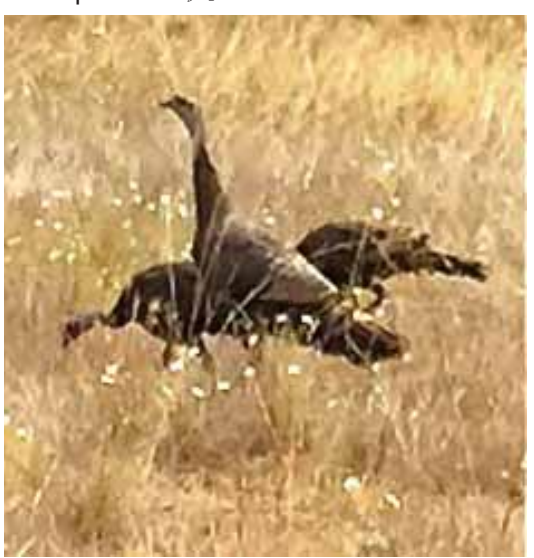
Turkeys in Edgewood

Why did the turkeys show up in Edgewood this year, the same year they showed up at Jasper Ridge? It might have to do with the drought and the fact that turkeys need to drink up to twice a day. I do not know which spring they were using at Edgewood, but they must have had access to some surface water. Perhaps the water supplies they had been using before dried up, forcing them to look for new habitat. Will they remain in Edgewood? The answer to that question is not known at this time. Under article 4.1.3 of the Strategic Plan for Wild Turkey Management of Nov. 2004, Fish and Wildlife will work with a park's management objectives to control or remove when the turkeys conflict with the park's objectives. Since Edgewood is a natural preserve whose primary management objective is to protect, preserve, and restore Edgewood's natural resources, this is a possible avenue to take if the turkeys become a problem. 💪