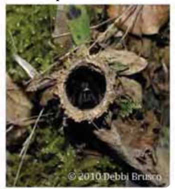
Poised just inside its burrow, the ambush predator awaits passing prey.

Any creature that would eat a spider that size is a potential turret spider predator, but the protective burrow makes it a harder meal to find. As is often the case, the dispersing young are most vulnerable. The burrow provides little protection from a parasitoid fly that uses turret spiders as a host.