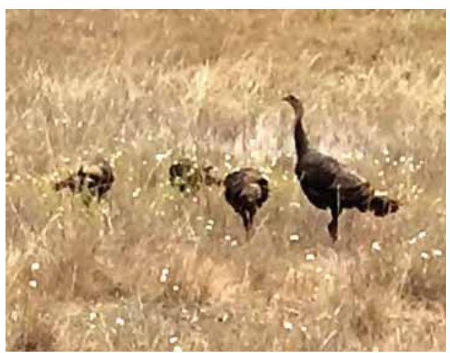
Turkeys in Edgewood

The turkeys ( Meleagris gallopavo ) have arrived in Edgewood. This is no surprise to most people since they are large birds that often gather in open areas and have been seen by most frequent visitors. But what does it mean for Edgewood, and what can we expect?