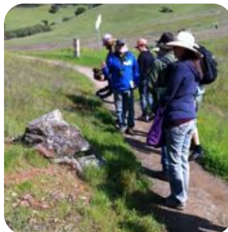
2016 Docent Class learns "How to Lead a Walk".