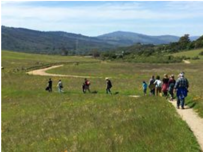
CGF's Stegner Giving Circle guests enjoy a special hike through Edgewood.

This past April, Friends of Edgewood partnered with the Committee for Green Foothills (CGF) in hosting their Stegner Giving Circle Hike and Picnic at Edgewood. The event, targeting CGF's most generous donors, marked the first joint project between our organizations.