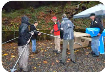
Photo: FoE Board members and other helpers team up to set up a pole and tarp canopy to help keep meeting attendees dry.

The Parks Department provided the 2 canopies that covered the delicious sandwich bar, once again supplied by our great friends at Arguello Catering