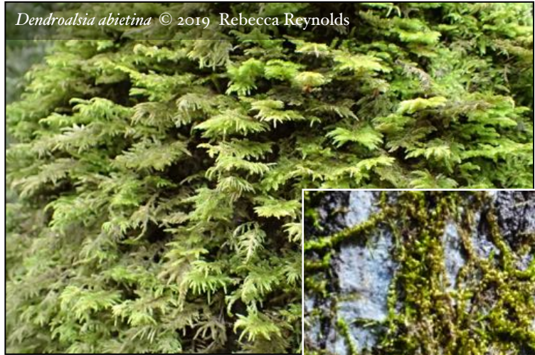
Dendroalsia abietina