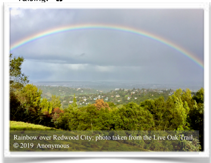
Rainbow over Redwood City; photo taken from the Live Oak Trail.