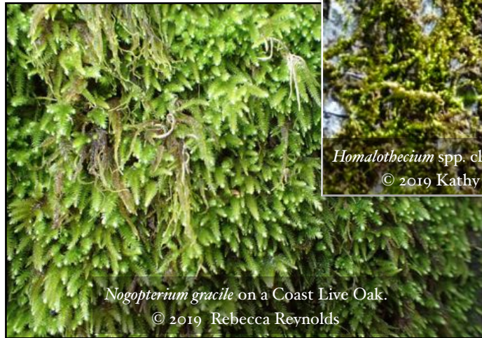
Nogopterium gracile on a Coast Live Oak.