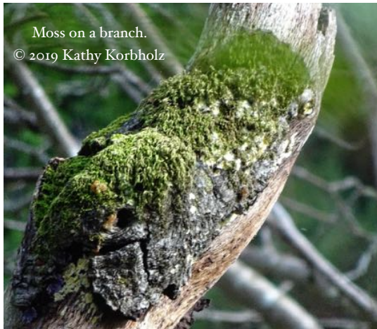
Moss on a branch.

The winter rains wake up our landscape. For months, the plants have been drying out, losing their leaves, turning brown, dying back, or drawing on their underground resources to maintain life. Then it rains, and immediately we see touches of new green. Little spears of grass, the cotyledons of new ground cover, bulging buds, and, all around the woodlands, a coat of fresh green moss.