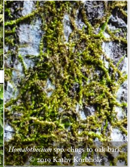
Homalothecium spp. clings to oak bark.