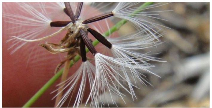
White Hawkweed.

Dense Sphere Many tan-colored fruits (generally over 100 per flower head) grow no beak, but attach directly to bristles, creating a dense sphere filled with pappus. Common and prickly sow thistle have this form.