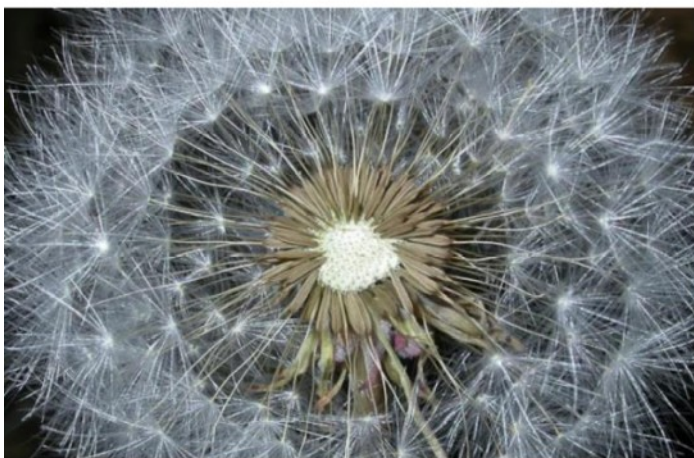
Common Dandelion.

To see Edgewood's 21 members of the dandelion tribe, use "Looks Like Dandelion" on the PlantID.net Edgewood Preserve list.