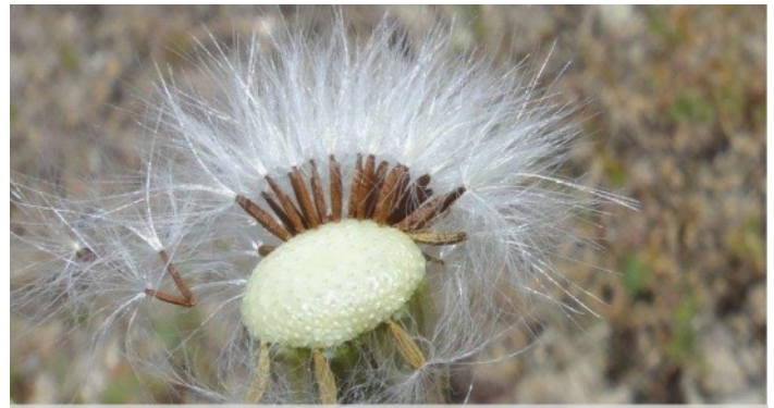
Common Sow Thistle.

Fluffy Sphere Tan-colored fruits grow narrow beaks often longer than the seed. Dozens of bristles attach to the tip of the beak, forming an effective parachute where lots of wind can get under the fluff. Annual agoseris, salsify, bristly ox-tongue, California dandelion, and common dandelion have this form.