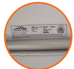
IDENTIFICATION LABEL FLAME CERTIFICATE