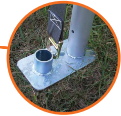
MASTER SERIES BASE PLATE