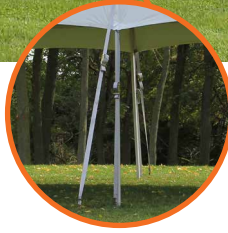
MASTER SERIES RATCHET ASSEMBLY