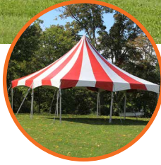
TWO COLOR OPTIONS