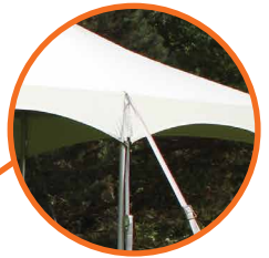
CURVED FIXED VALANCE