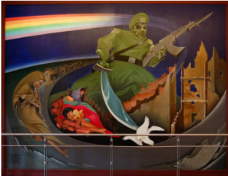
Soldier kills the dove of peace at Denver Airport

https://www.matthewbooks.com/august-13-2005/